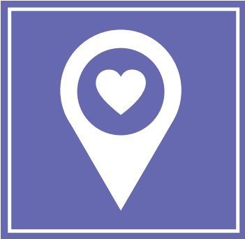
A Great Place to Live & Experience

Vision Gainesville 2035 balances an equitable community for all and a sustainable community for the future. Gainesville 2035 is a world-class lifelong learning community, is a great place for neighbors to live and thrive, and provides meaningful experiences for everyone. Gainesville 2035 has an alive/vibrant downtown, a strong, resilient economy, and mobility for all neighbors. Mission Gainesville city government’s mission is to build community by providing services responsive to neighbors and our community in a financially responsible and neighbor-focused manner in partnership with our neighbors while engaging neighbors and community builders.