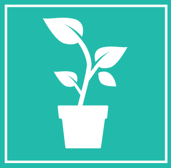
More Sustainable Community