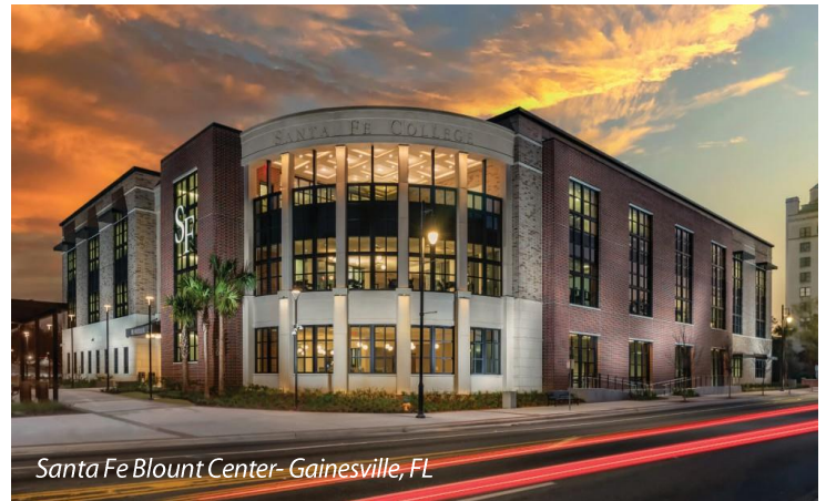
Santa Fe Blount Center - Gainesville, FL