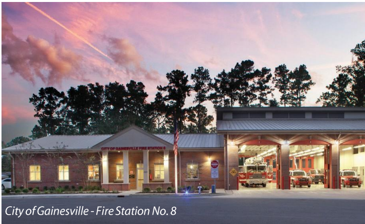
City of Gainesville - Fire Station No. 8

$1.53M $3.5M $225K $265K $3.1M $2.1M $1.3M $3.1M $8.0M $1.59M $3.94M $7.9M