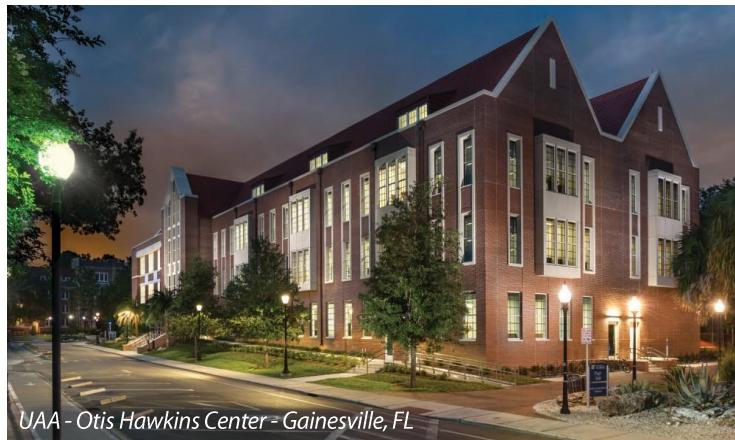
UAA - Otis Hawkins Center - Gainesville, FL