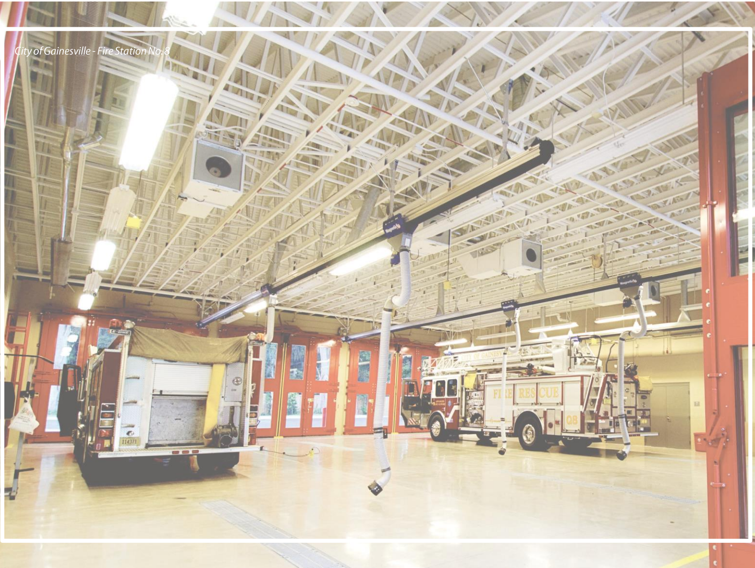
City of Gainesville - Fire Station No. 8

Nonetheless, we will make every reasonable effort to comply.