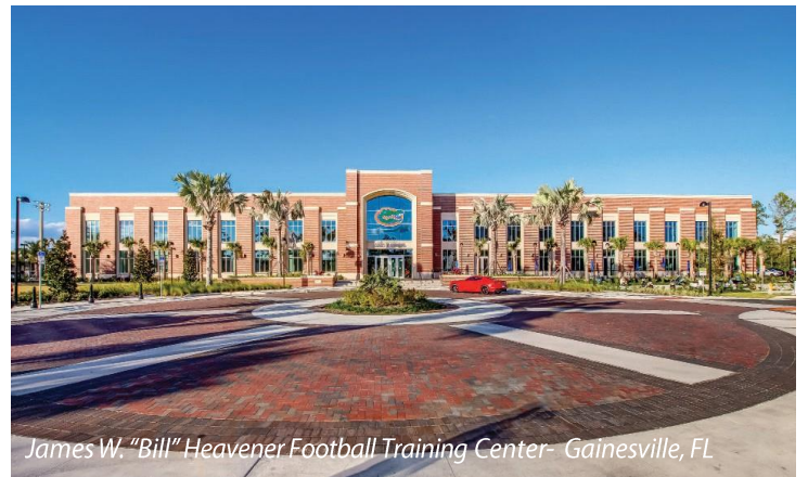
James W. "Bill" Heavener Football Training Center - Gainesville, FL