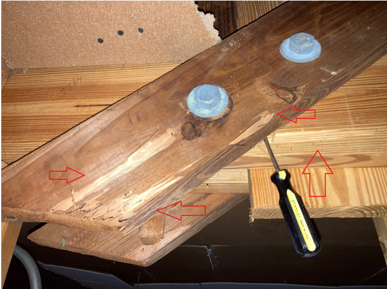
Figure 8. South truss. Note visible termite damage to both old and replacement wood. When the screwdriver was inserted between the plies, black pellets dropped, indicating the probability of termite activity and damage between the wood plies.