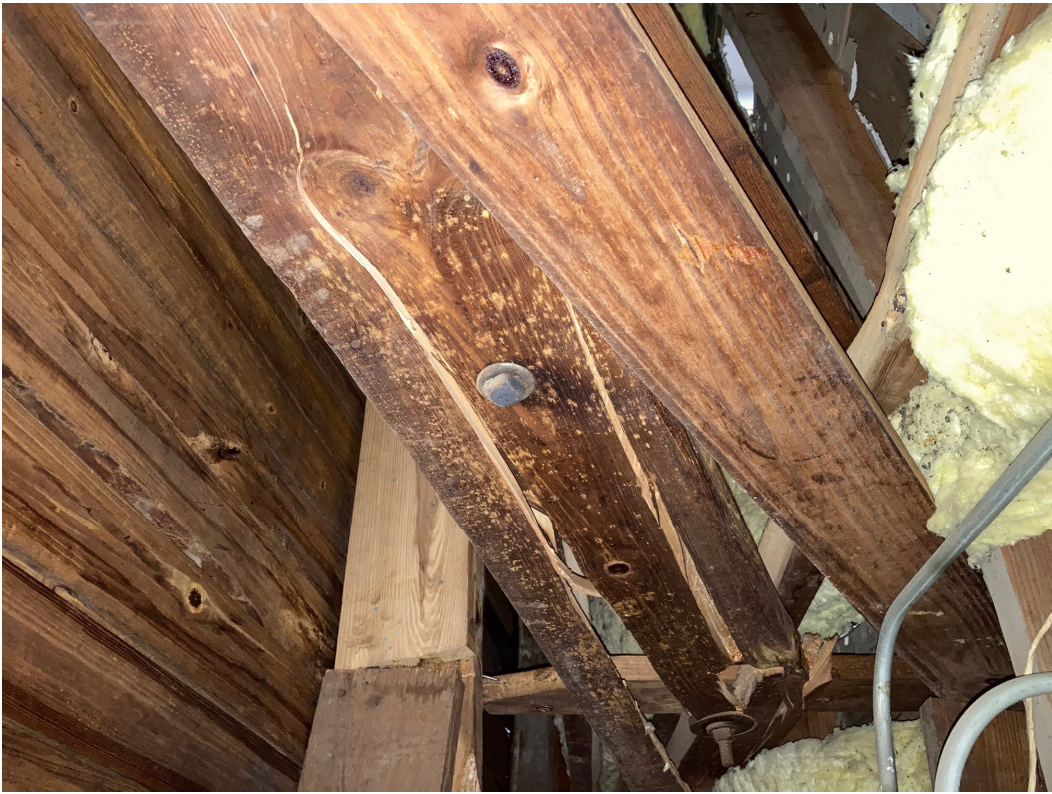
Figure 1. West end of truss