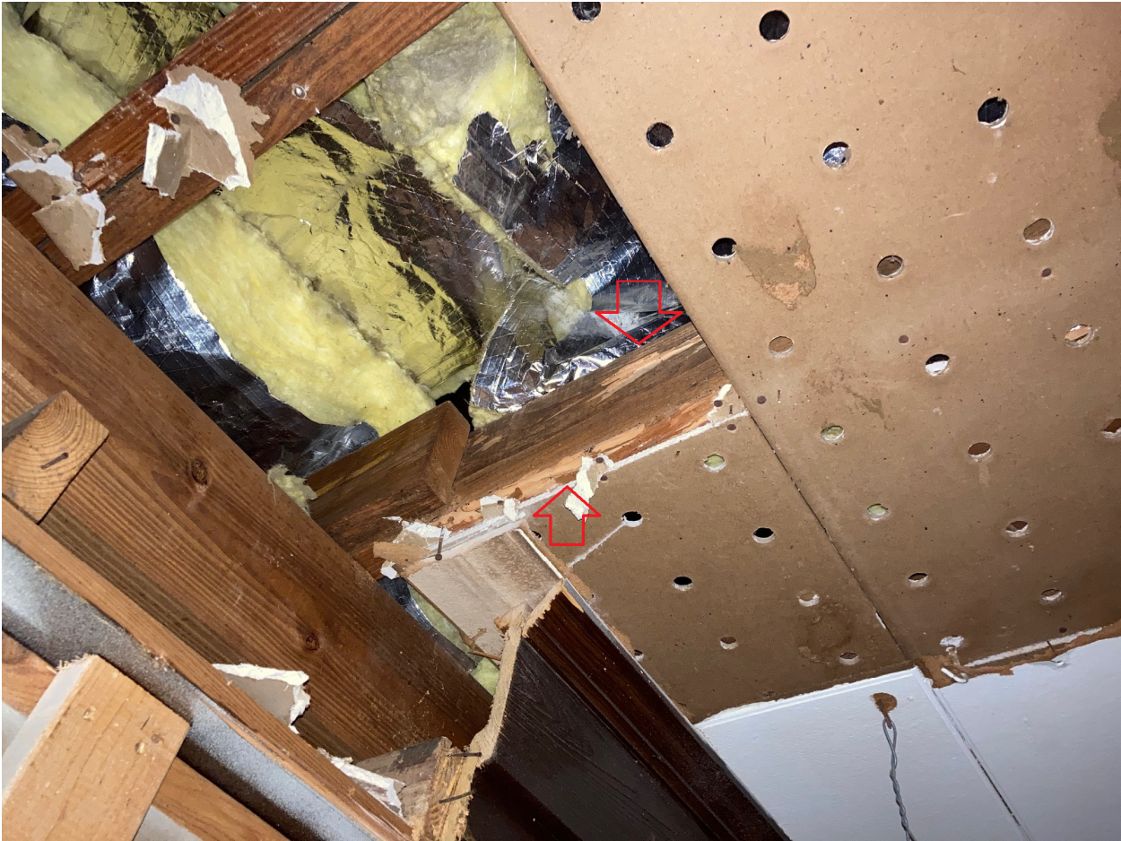
Figure 5. Termite damage to ceiling joist