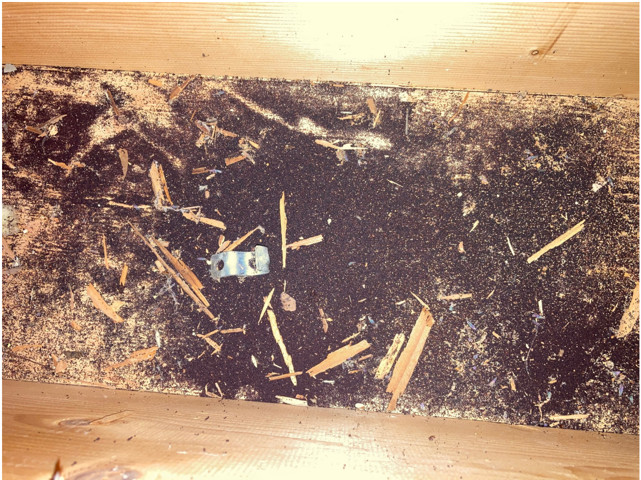
Figure 10. Example of black pellets from suspected termites on trim boards added during 1990's renovation.