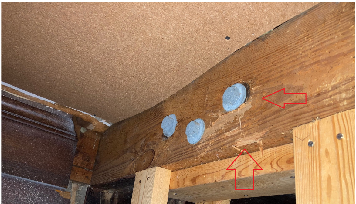
Figure 11. Termite damage to truss chord, including under bolt heads