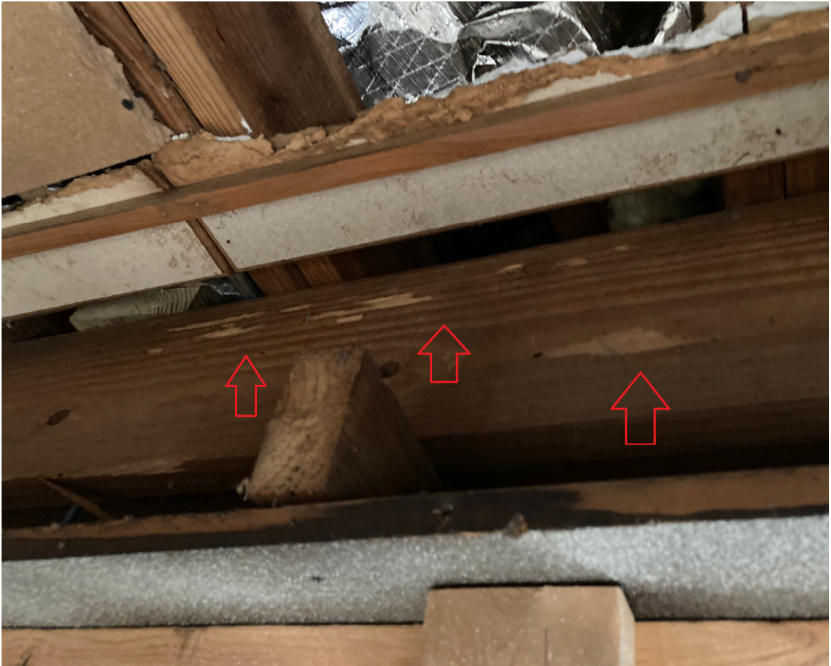
Figure 13. Termite damage along truss chord