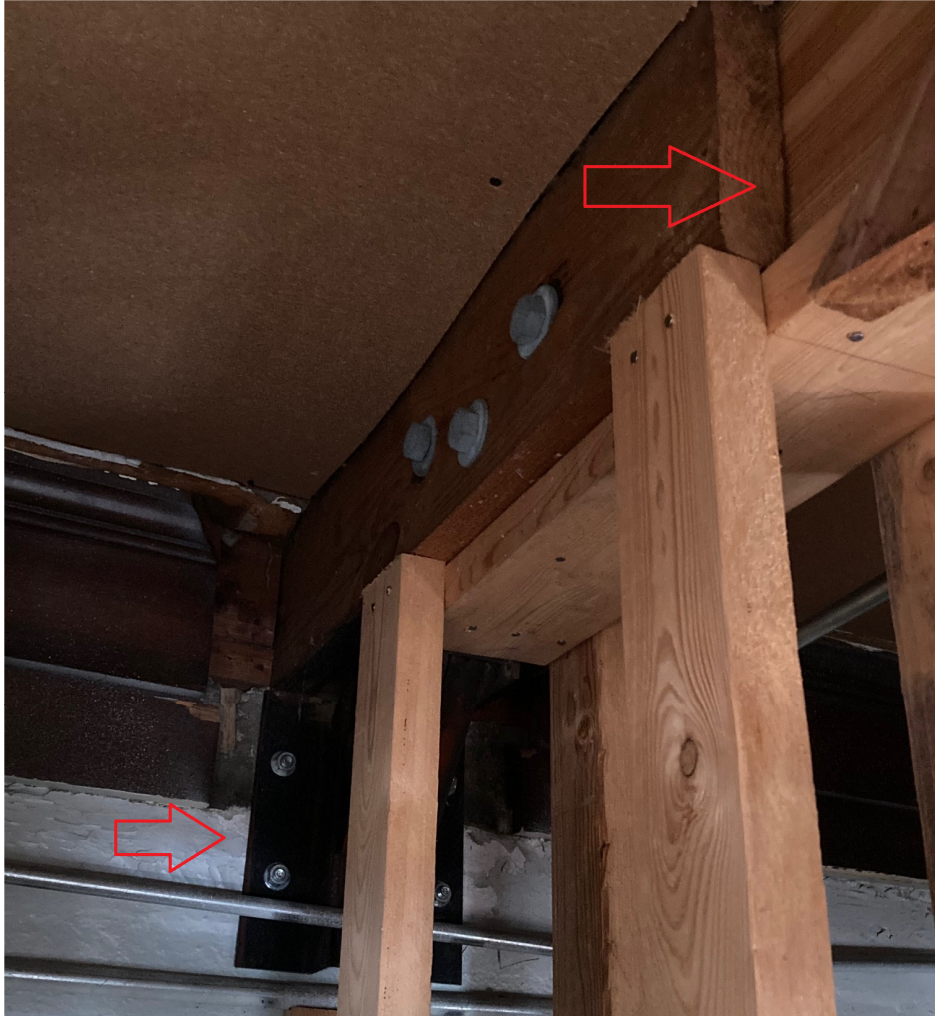
Figure 6. Retrofit seat and repaired (spliced) truss chord at south truss