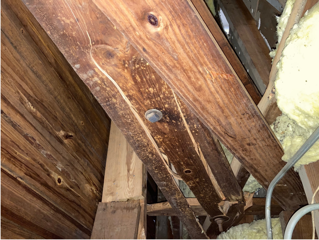
Figure 1. West end of truss