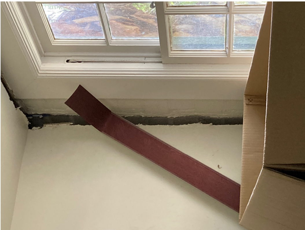
Figure 4. Interior wall damage