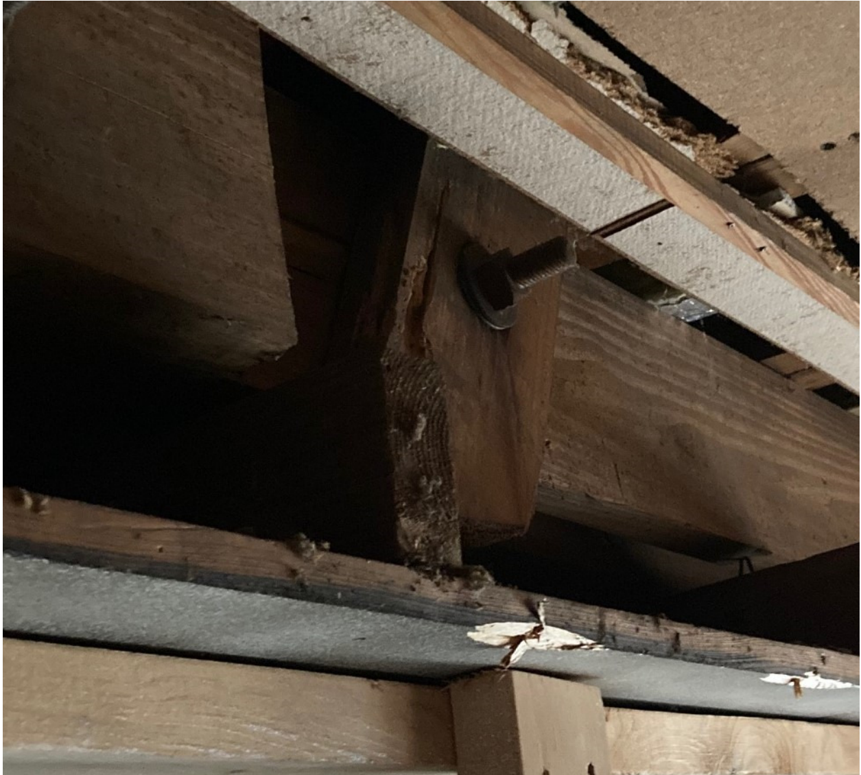
Figure 12. Termite damage extending into connection