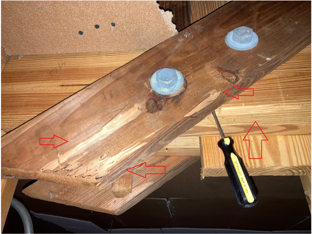
Figure 8. South truss. Note visible termite damage to both old and replacement wood. When the screwdriver was inserted between the plies, black pellets dropped, indicating the probability of termite activity and damage between the wood plies.