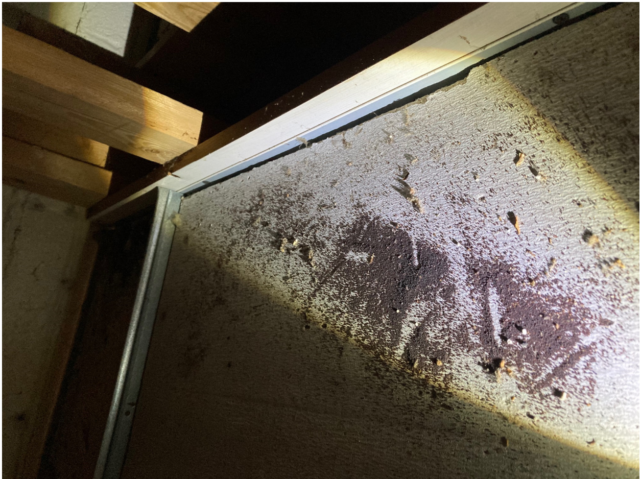
Figure 9. Example of black pellets from suspected termites on suspended ceiling added during 1990's renovation.