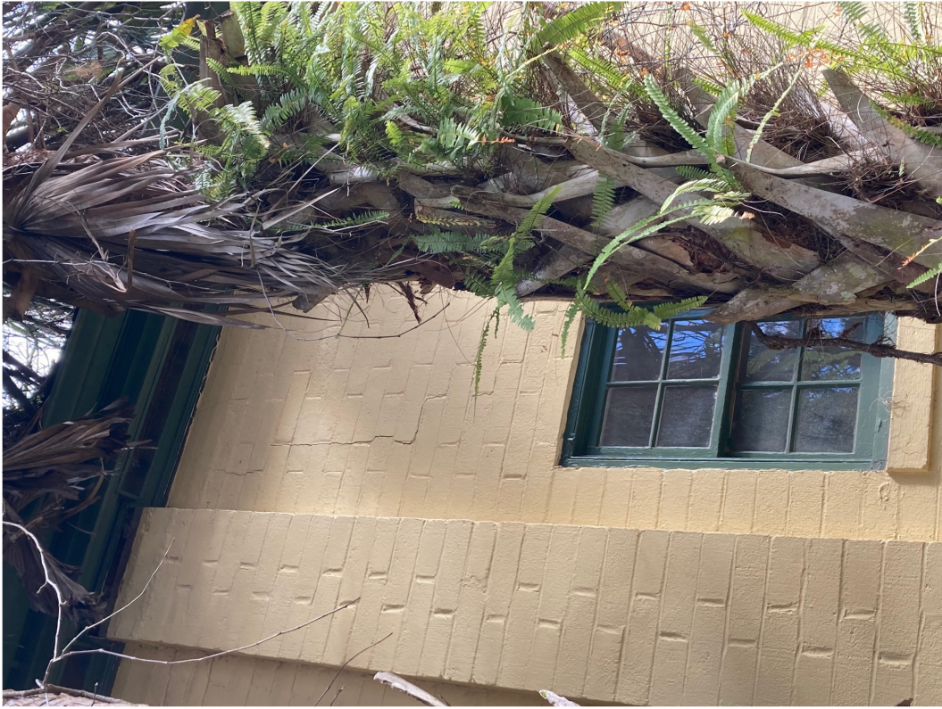
Figure 3. Exterior masonry wall with crack