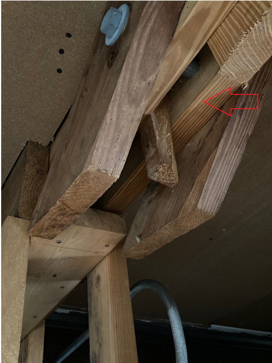
Figure 7. South truss. Failed web member with exposed bolt not engaging replacement web