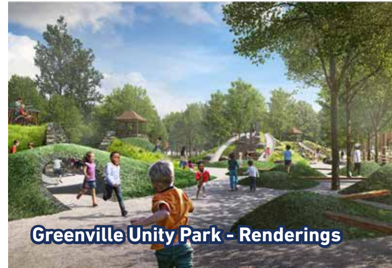
Greenville Unity Park - Renderings