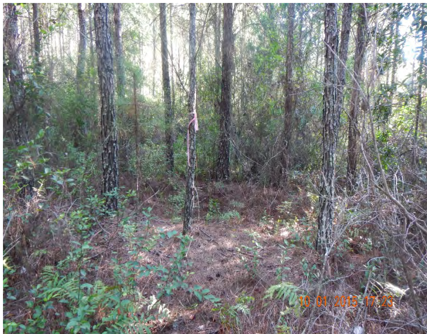
Photo 478. Boundary of Hydric: Planted Pine Flatwoods and Transitional: Planted Pine Flatwoods as seen at GPS location 8416 (Frame 7697; 10/01/15).