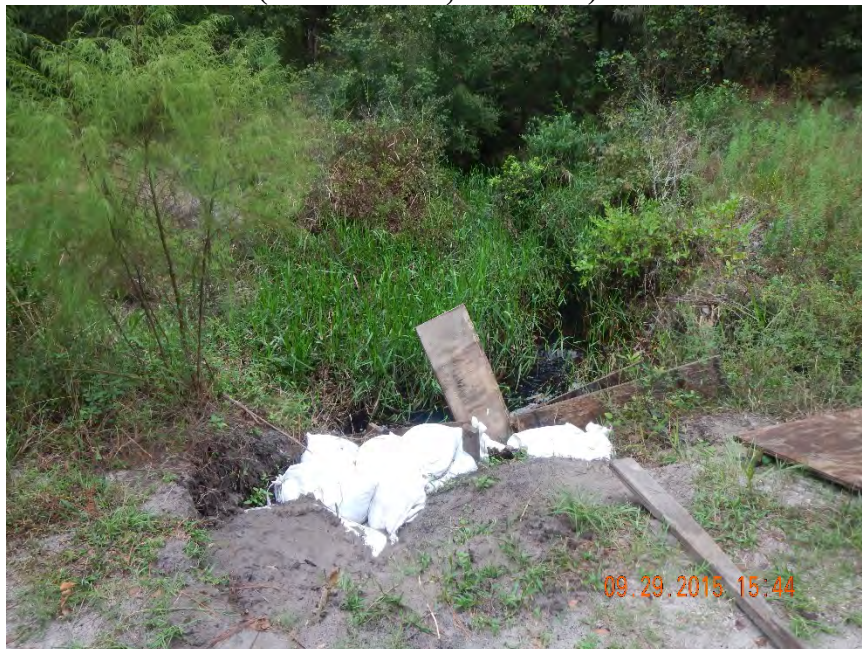
Photo 435. View of eroded Physical Feature: Culvert as seen looking north from GPS location 8100 (Frame 7647; 09/29/15).