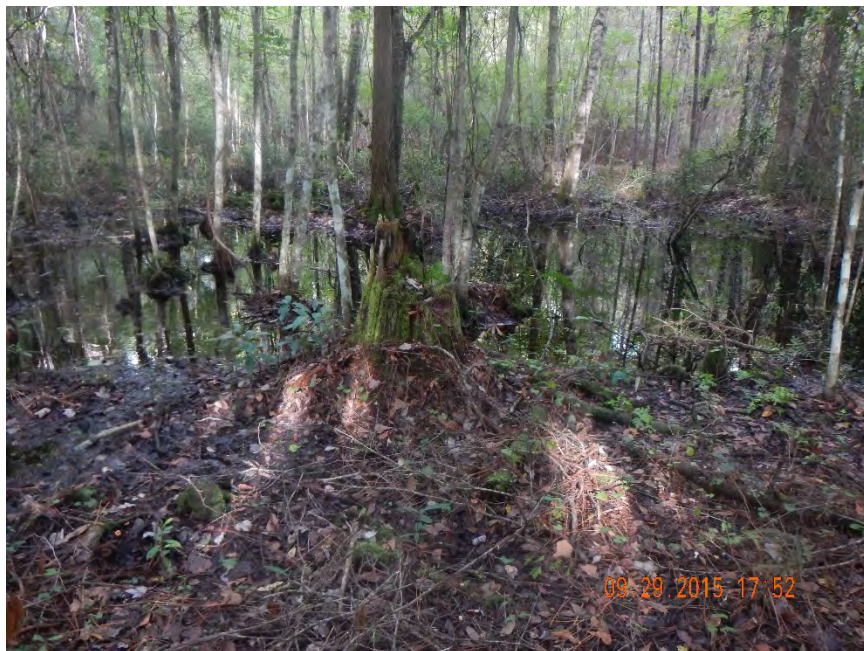
Photo 450. View of Wetland: Natural Flow-way that occurs at GPS locations 8166–8173. View is at GPS location 8168 (Frame 7666; 09/29/15).