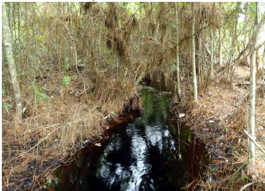
Photo 409. View of stream inflow into Wetland: Planted Pine-Mixed Hardwoods as seen looking west from GPS location 7754 (Frames 2177-2178; 09/18/15).