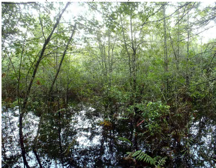
Photo 287. View of Hydric: Planted Pine Flatwoods as seen looking southwest from GPS location 5930 (Frames 2024-2025; 09/08/15).