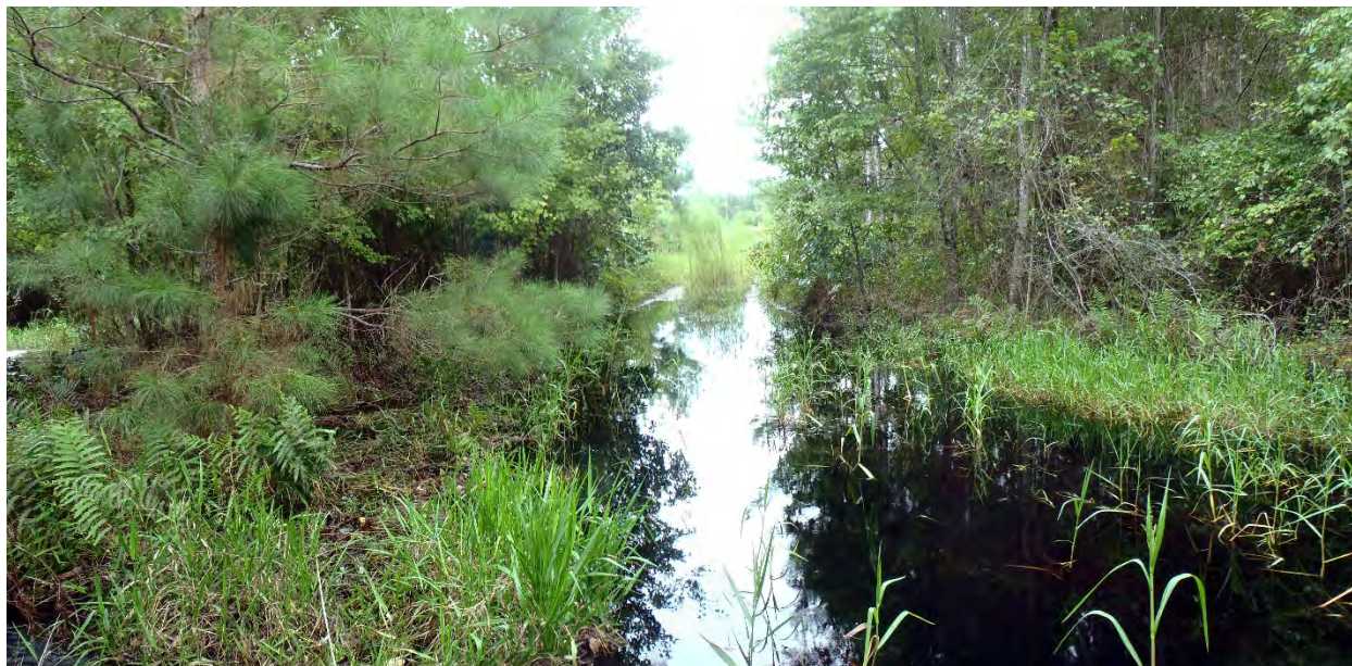
Photo 426. View of Wetland: Natural Flow-way as seen looking southeast from GPS location 7945 (Frames 2205-2206; 09/18/15).