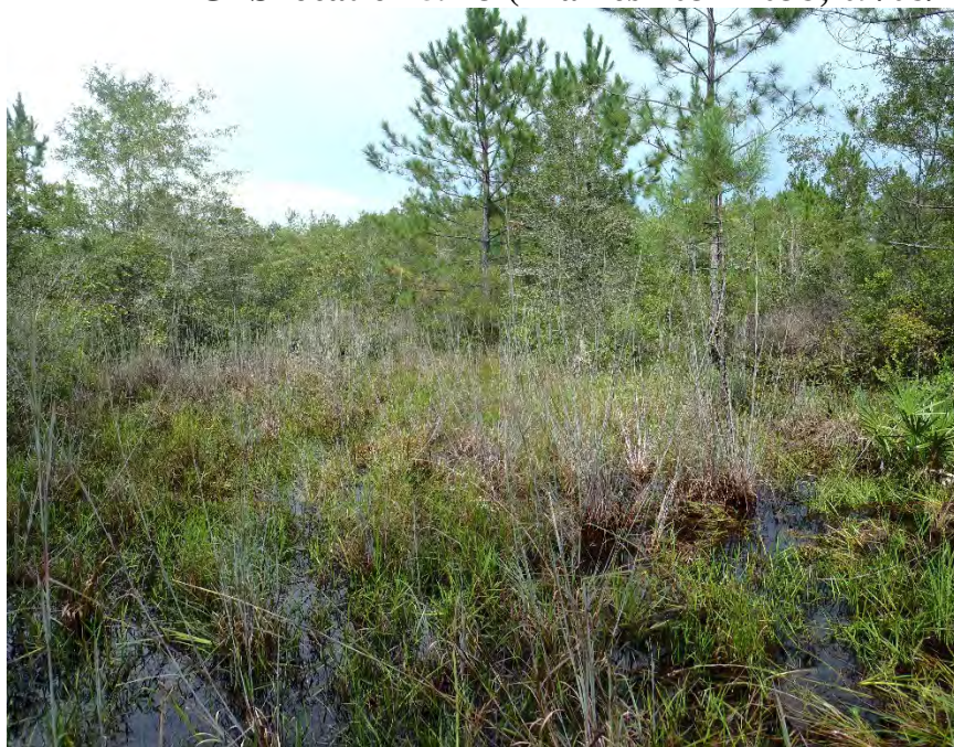
Photo 293. View of Wetland: Planted Pine-Marsh as seen looking northeast from GPS location 5997 (Frames 2043-2044; 09/08/15).