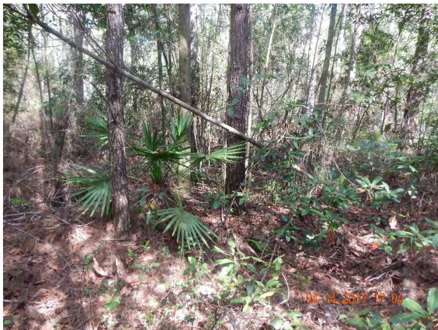
Photo 531. View of Bay-dominated area of Hydric Hammock habitat found at GPS location 10251 (Frame 1442; 04/14/17).