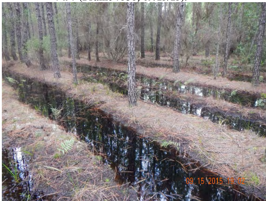
Photo 401. View of Hydric: Planted Pine Flatwoods as seen looking northeast from GPS location 7510 (Frame 7537; 09/15/15).