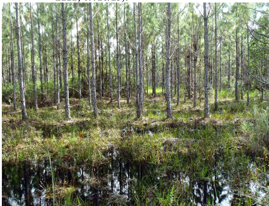
Photo 327. View of Wetland: Planted Pine-Marsh as seen looking south from GPS location 6634 (Frame 2112; 09/10/15).