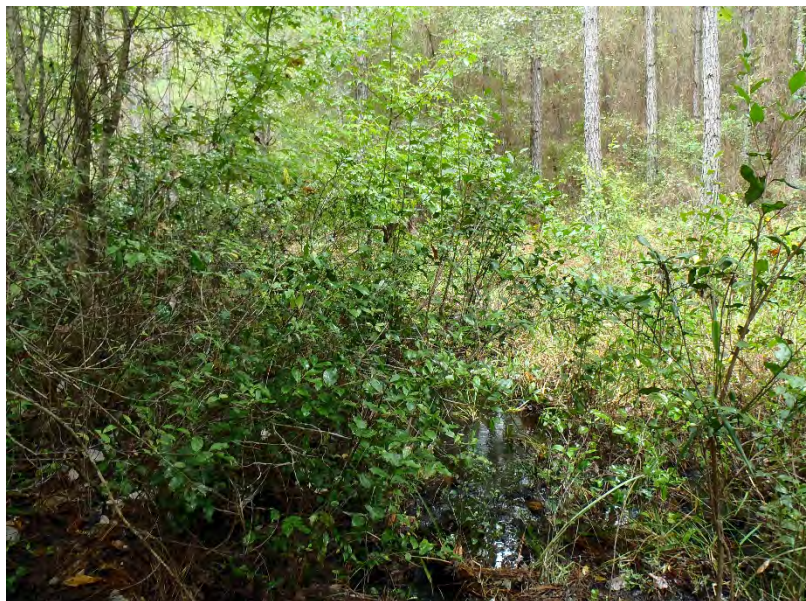
Photo 418. View of Surface Water: Excavated Ditch within Upland as seen looking east from GPS location 7843 (Frame 2191; 09/18/15).