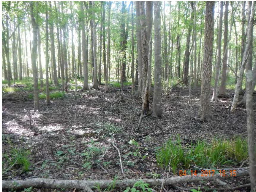
Photo 538. View of sweetgum-red maple ( Liquidambar styraciflua - Acer rubrum ) dominated Hydric Hammock as seen at GPS location 10312 (Frame 1453; 04/14/17).