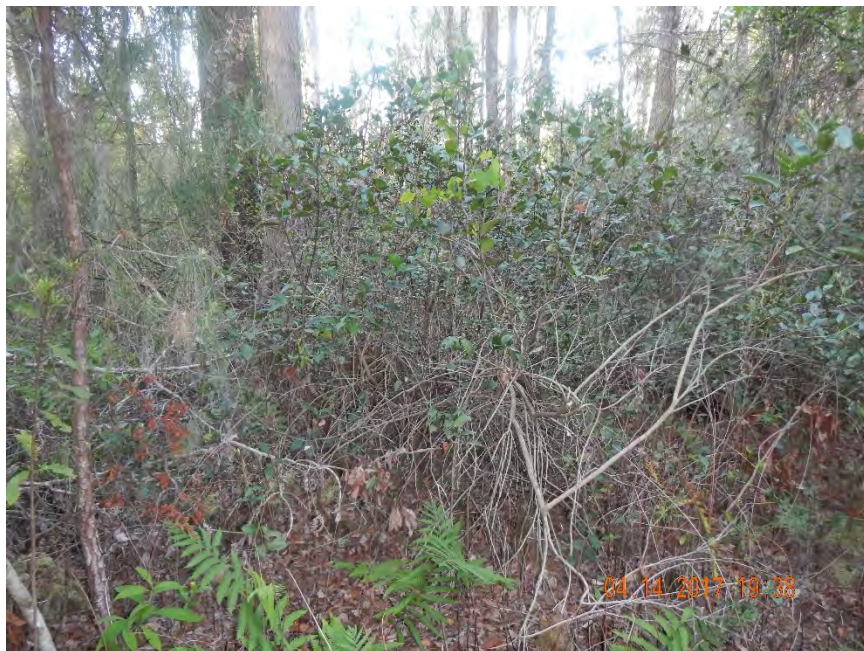
Photo 553. View of very disturbed historical cypress habitat with minimal pine and cypress canopy and very dense shrubs and briers as seen at GPS location 10396 (Frame 1469; 04/14/17).