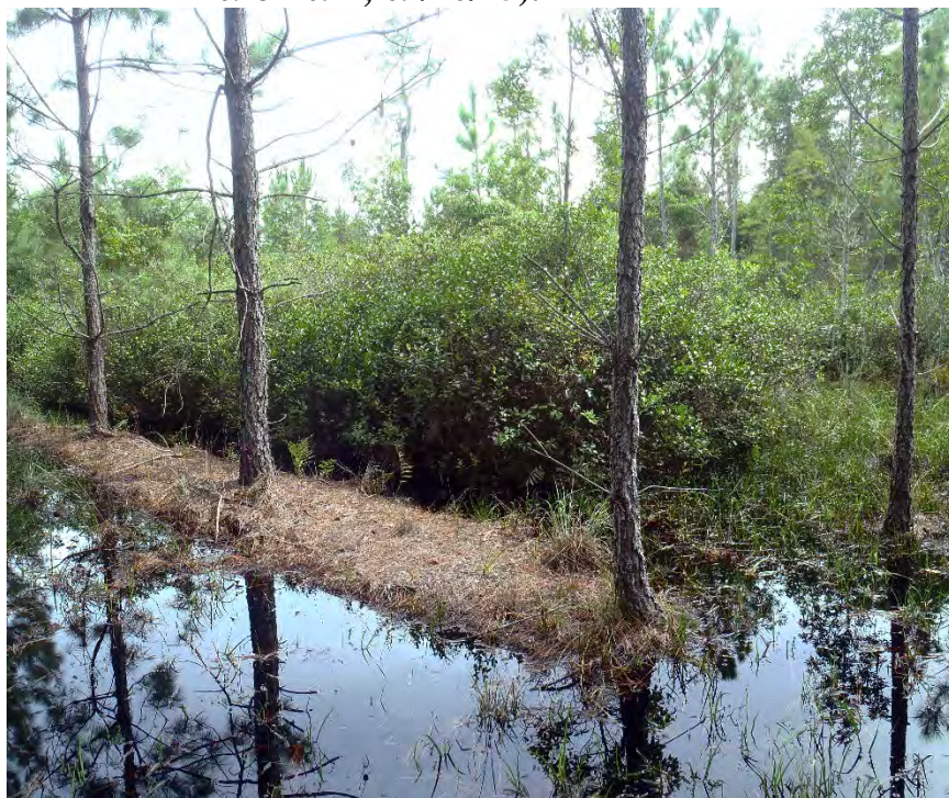
Photo 319. View of Wetland: Planted Pine-Marsh as seen looking south from GPS location 6574 (Frames 2098-2099; 09/10/15).