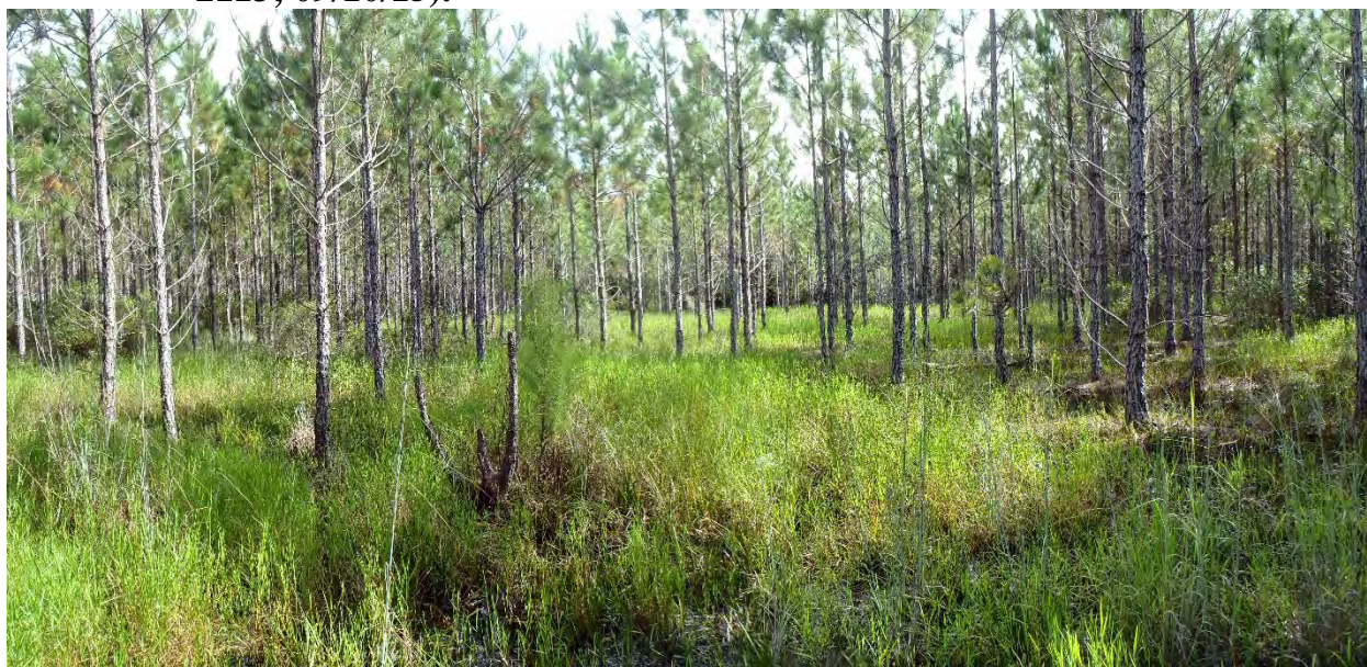
Photo 329. View of Wetland: Planted Pine-Marsh as seen looking southeast from GPS location 6637 (Frames 2114-2115; 09/10/15).