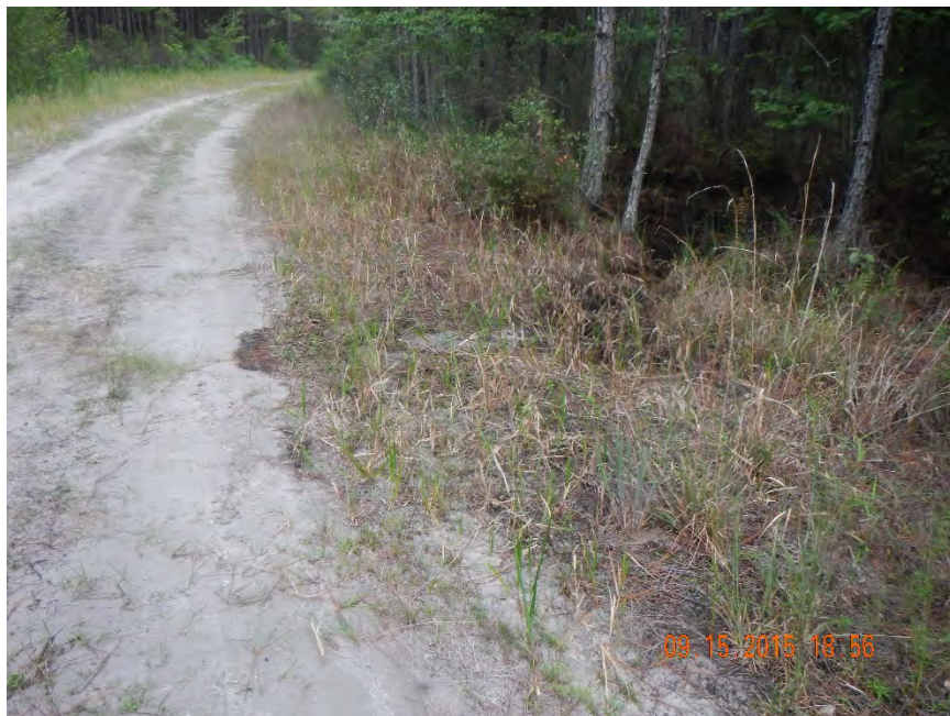
Photo 400. View of Physical Feature: Culvert as seen looking south (upstream) from GPS location 7497 (Frame 7536; 09/15/15).