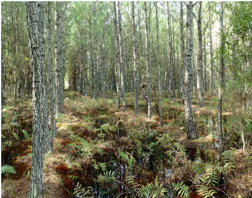
Photo 297. View of Wetland: Planted Pine-Marsh as seen looking north from GPS 6112 (Frames 2050-2051; 09/08/15).