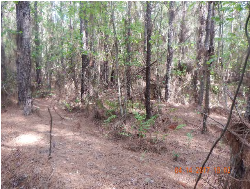
Photo 535. View of red maple ( Acer rubrum L) dominated understory in Hydric Planted Pine Flatwoods as seen at GPS location 10295 (Frame 1449; 04/14/17).