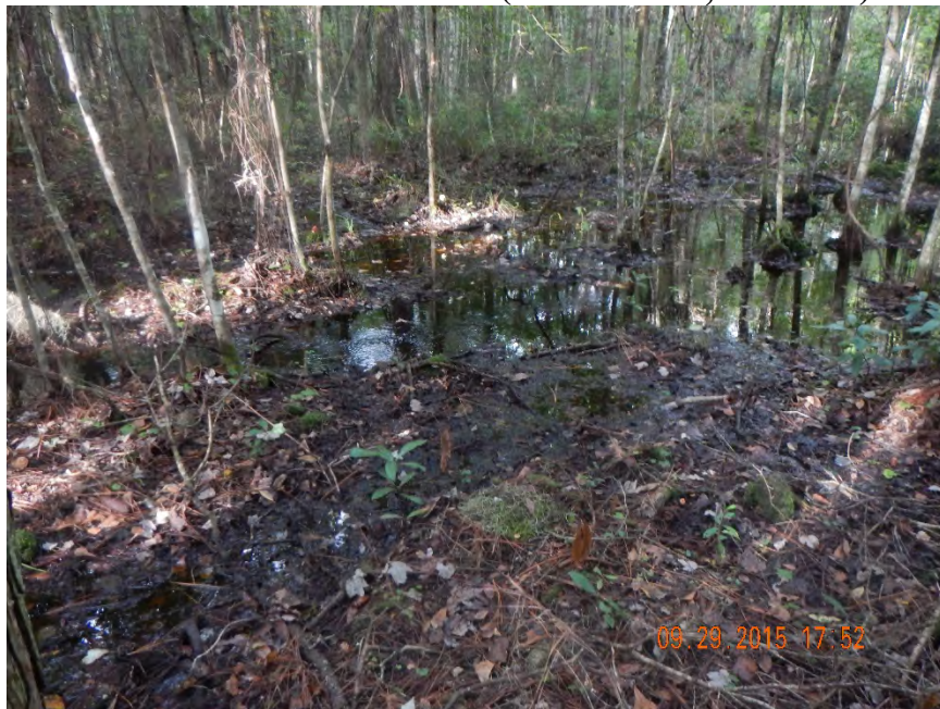
Photo 449. View of Wetland: Natural Flow-way that occurs at GPS locations 8166–8173. View is at GPS location 8168 (Frame 7665; 09/29/15).