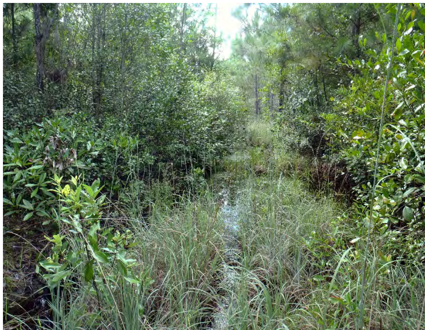
Photo 346. View of Wetland: Natural Flow-way as seen looking west from GPS location 6893 (Frames 2147-2148; 09/11/15).