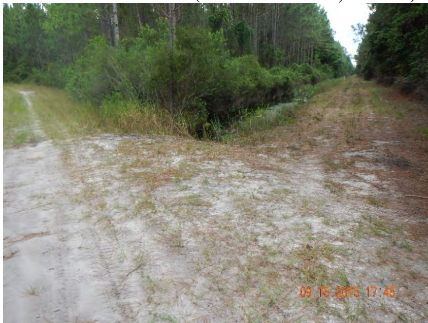
Photo 381. View of gas line (right) and forest road (left) that accesses property to the east. This photo is taken from GPS location 7403 looking southeast to south. There are several Physical Feature: Culverts at this location that route water north and east through this intersection (Frame 7515; 09/15/15).