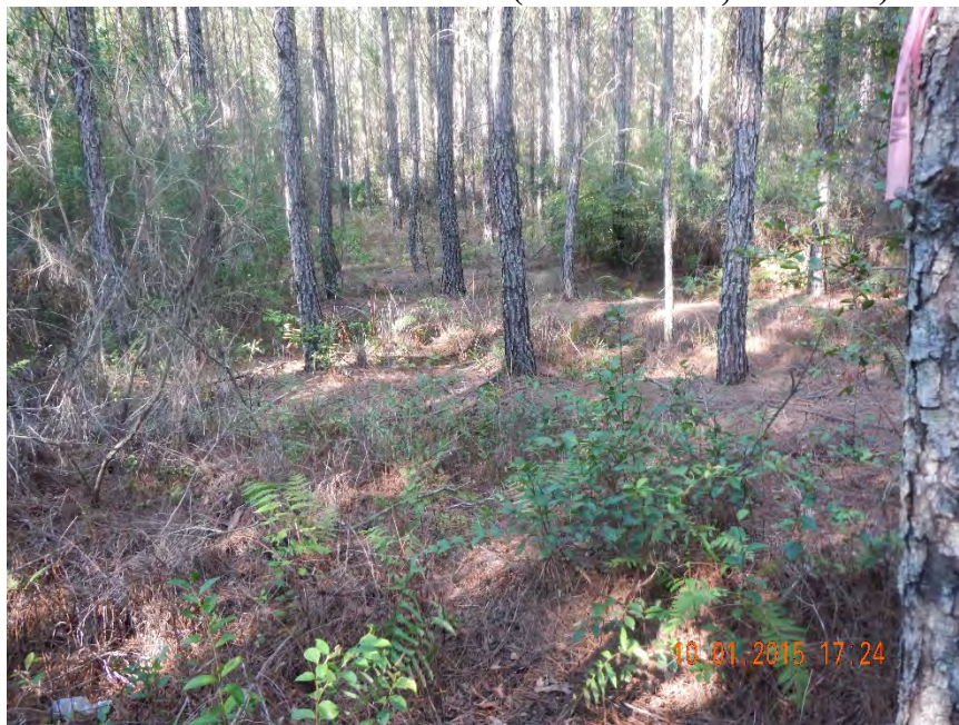
Photo 481. View to northeast of Hydric: Planted Pine Flatwoods as seen from GPS location 8416 (Frame 7700; 10/01/15).