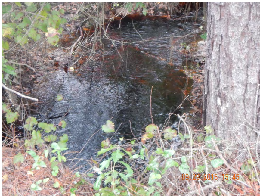
Photo 438. View of flow at Physical Feature: Culvert at GPS location 8100. Flow is to north on north side of road (Frame 7649; 09/29/15).