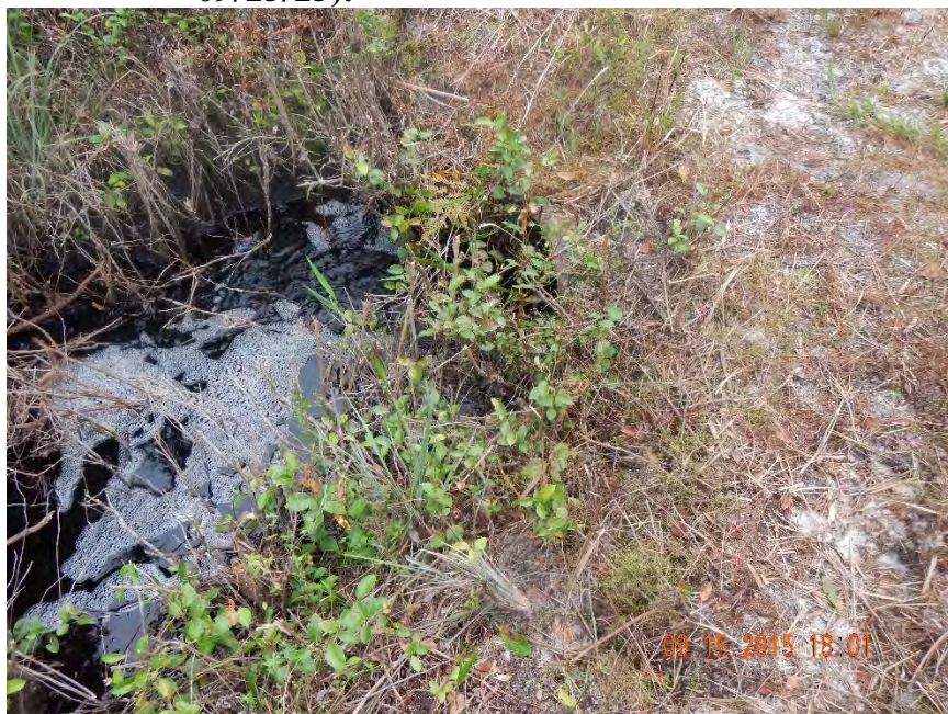
Photo 387. View of flow-way at west end of Physical Feature: Culvert located in gas line right-of-way at GPS location 7421 (Frame 7521; 09/15/15).