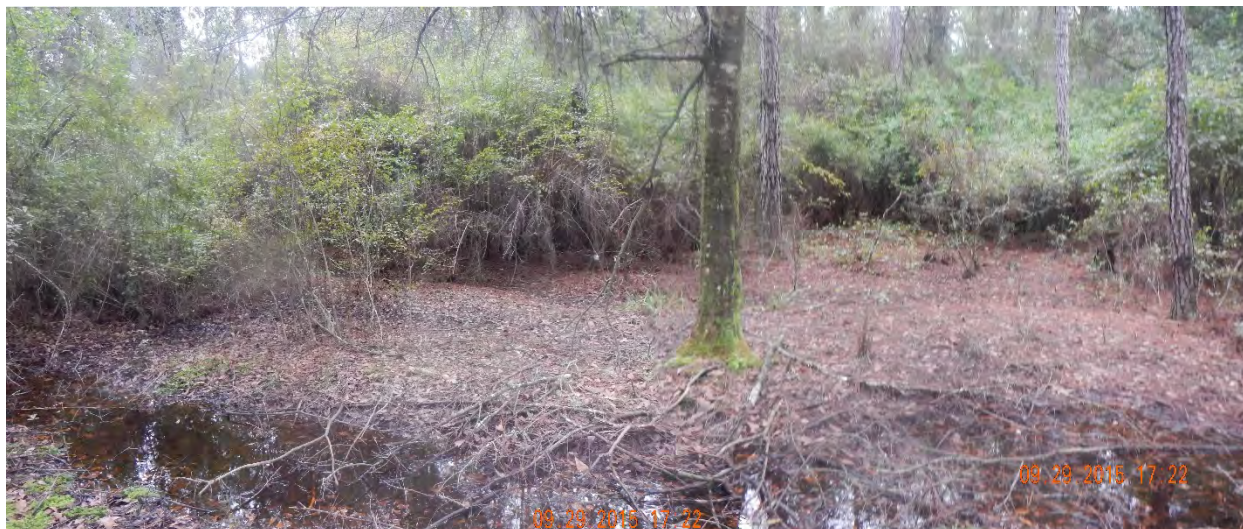
Photo 444. View of Wetland: Wetland Shrubs-Rabbit-eye Blueberry ( Vaccinium virgatum ) Understory as seen looking south from GPS location 8120 (Frames 7656-7657; 09/29/15).