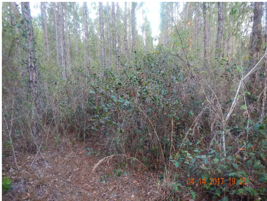
Photo 550. View of transitional Planted pine Flatwoods as seen at GPS location 10392 (Frame 1466; 04/14/17).