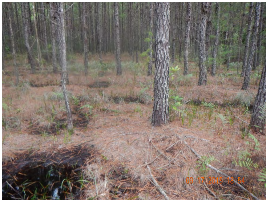
Photo 406. View of Wetland: Planted Pine-Marsh as seen at GPS location 7649 (Frame 7625; 09/17/15).