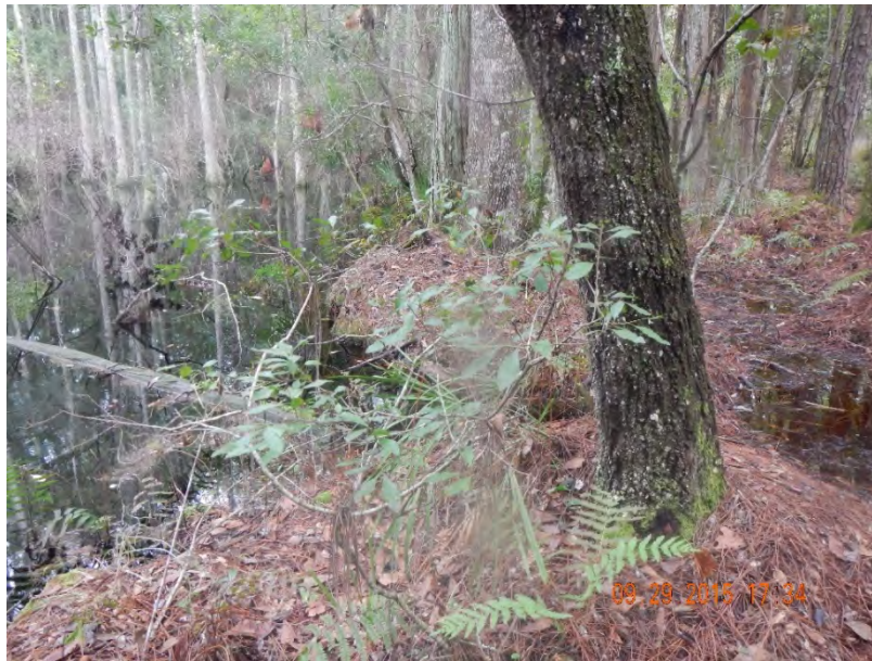
Photo 446. View of south boundary of buttonbush dominated, excavated Wetland: Cypress-Mixed Hardwoods-Bays as seen looking southeast from GPS location 8138 (Frame 7660; 09/29/15).