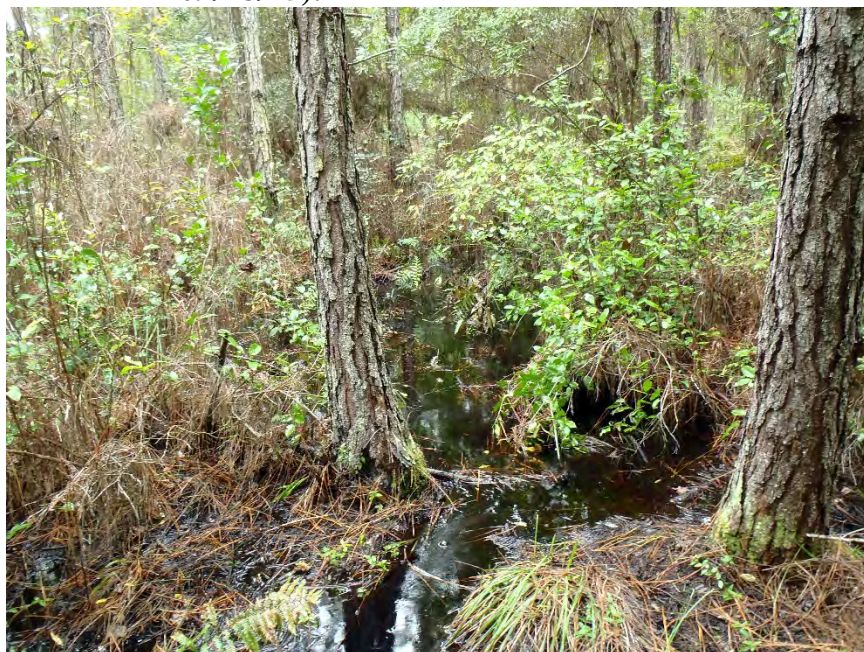
Photo 419. View of Surface Water: Excavated Ditch within Upland as seen looking west from GPS location 7843 (Frame 2192; 09/18/15).