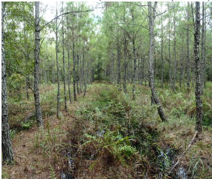
Photo 313. View of Wetland: Planted Pine-Marsh as seen looking north from GPS location 6513 (Frames 2086-2087; 09/09/15).