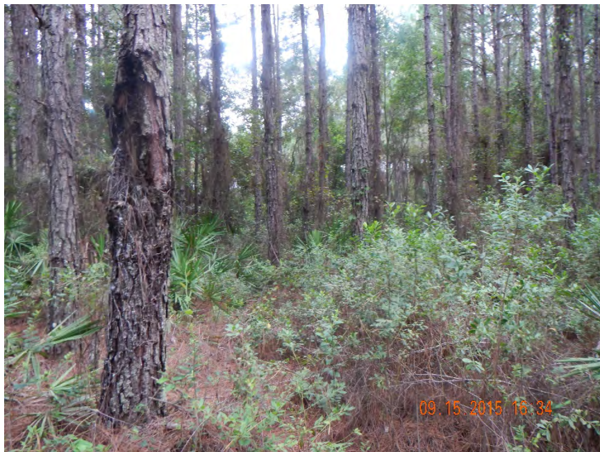
Photo 370. View of Mesic: Planted Pine-Mesic Pine Flatwoods as seen looking west from GPS location 7349 (Frame 7501; 09/15/15).