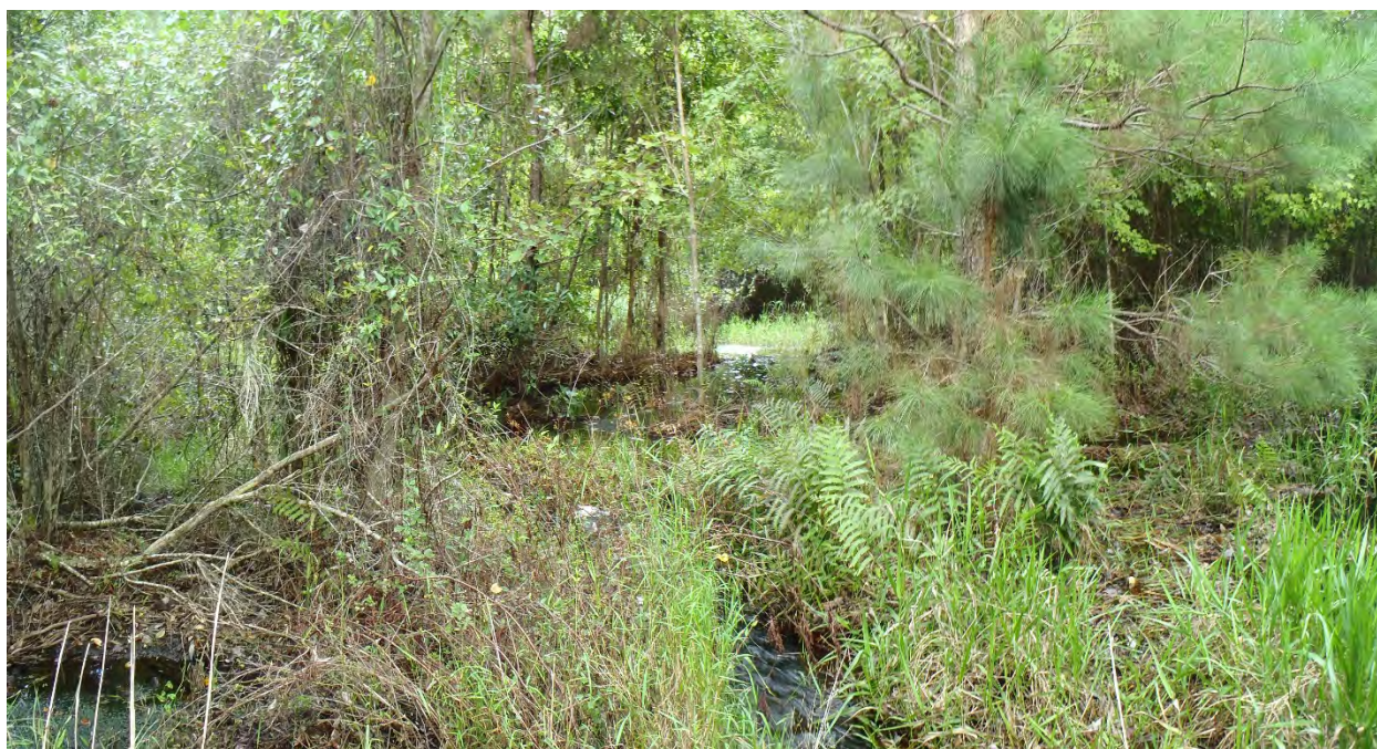
Photo 425. View of Wetland: Natural Flow-way as seen looking northwest from GPS location 7945 (Frames 2203-2204; 09/18/15).