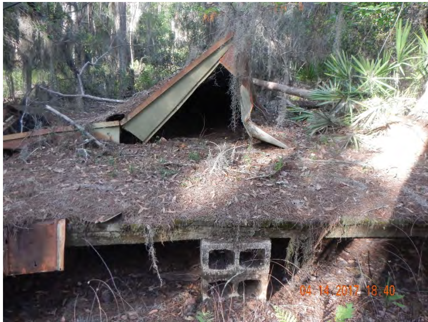
Photo 549. Work platform.