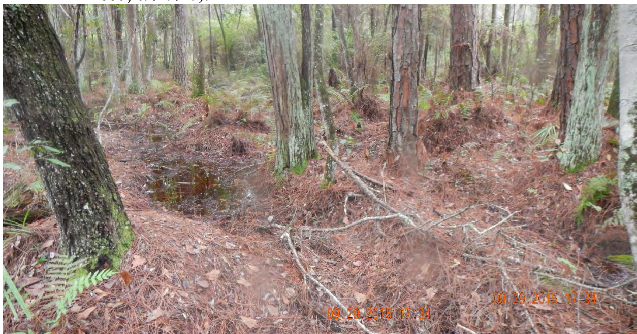
Photo 447. Viewed of drained Wetland: Cypress-Mixed Hardwoods-Bays that lies along southwest boundary of excavated buttonbush and cypress area. View is southwest from GPS location 8138 (Frames 7661-7662; 09/29/15).