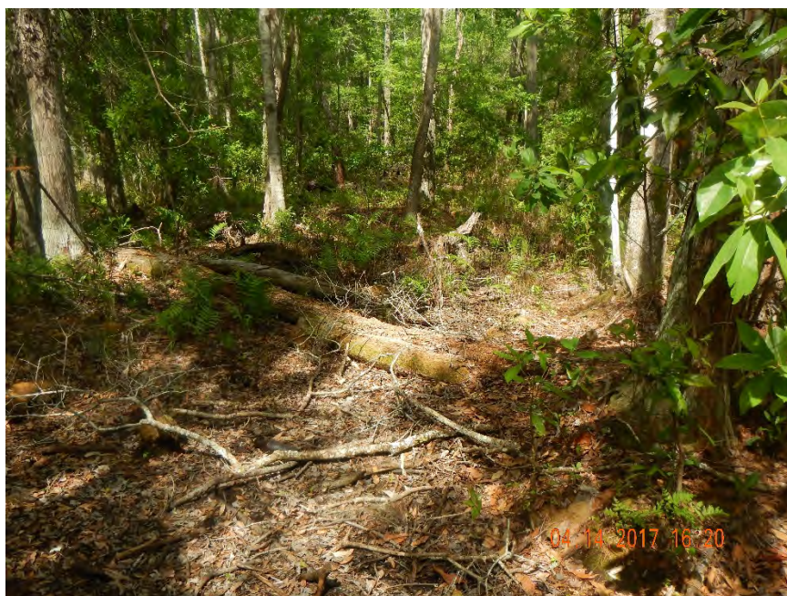
Photo 521. View of ditch located within the Cypress-Mixed Hardwood-Bay Swamp as seen looking north at GPS location 10183 (Frame 1428; 04/14/17).