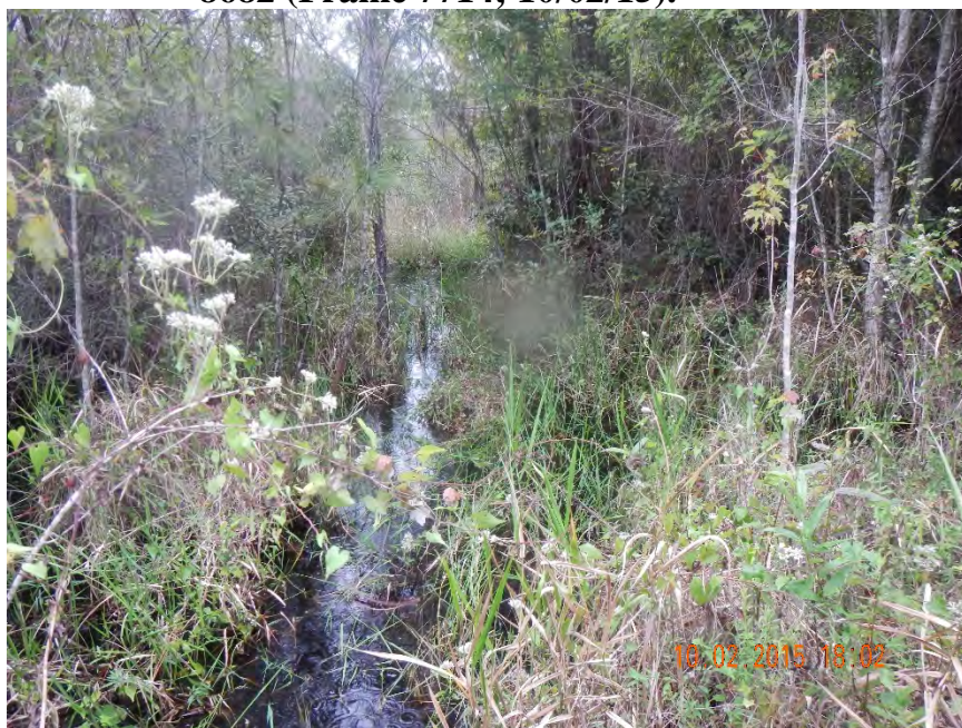
Photo 491. View of Wetland: Mixed Shrubs & Vines as seen looking south from GPS location 8682 (Frame 7715; 10/02/15).