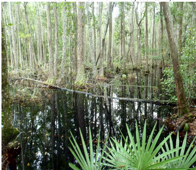
Photo 429. View of Wetland: Cypress-Mixed Hardwoods-Bays as seen looking west from GPS location 7968 (Frames 2211-2212; 09/18/15).