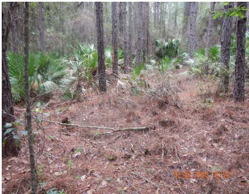
Photo 488. View of Planted Pine-Mesic Pine Flatwoods as seen looking northwest from GPS location 8587 (Frame 7712; 10/02/15).