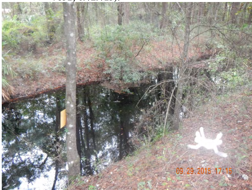
Photo 441. View of offsite excavated ditch through an upland as seen from the Fill: Old Roads- Berms-Windrows at GPS location 8106 (Frame 7653; 09/29/15).