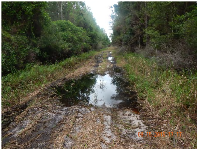
Photo 378. View of gas line as seen looking south from GPS location 7378 Wetland: Natural Flow-way, which occurs from west to east across top of gas line extending from GPS locations 7375–7380 (Frame 7511; 09/15/15).