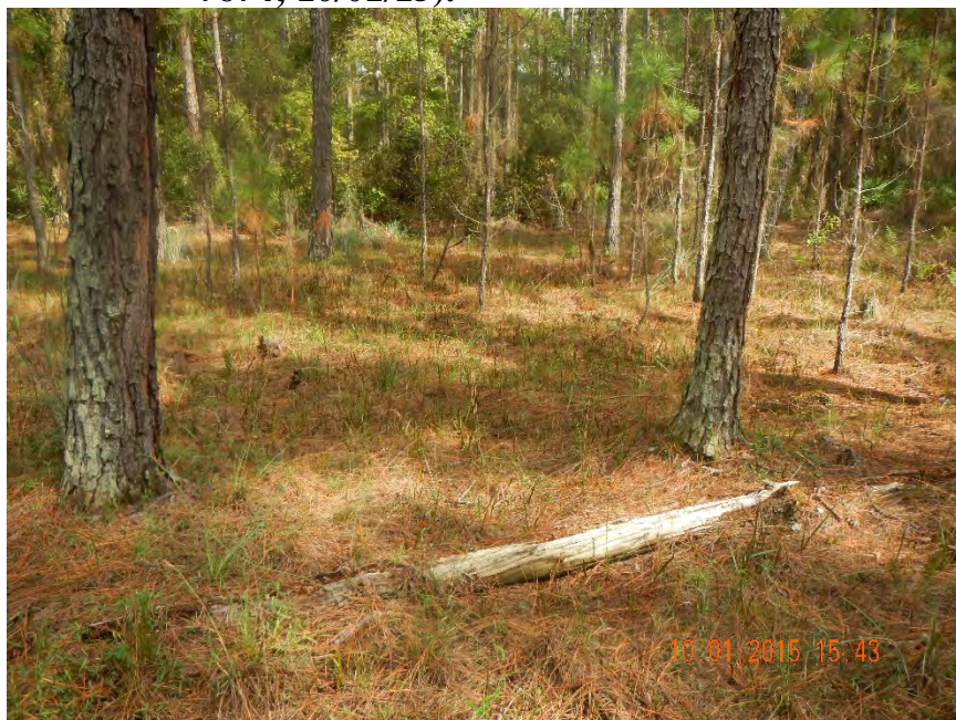
Photo 457. View of Hydric: Planted Pine Flatwoods in area of GPS location 8256 (Frame 7675; 10/01/15).