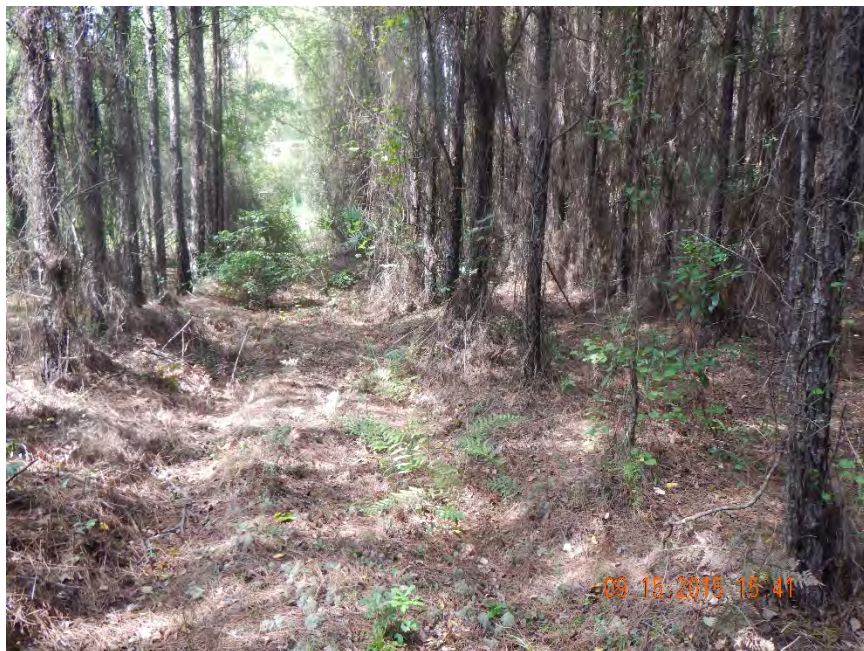
Photo 368. View of Mesic: Planted Pine-Mesic Pine Flatwoods as seen looking north from GPS location 7340 (Frame 7499; 09/15/15).