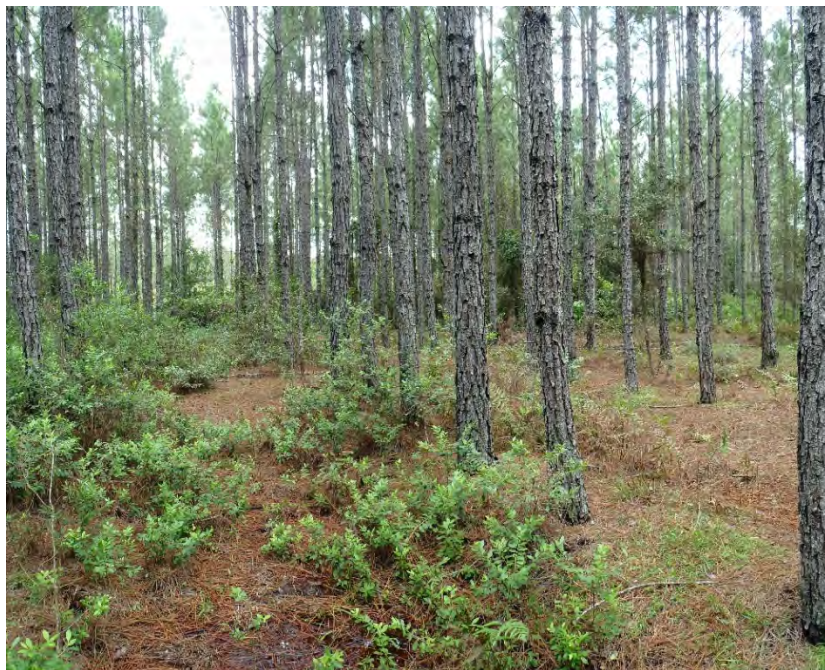
Photo 312. View of Mesic: Planted Pine-Mesic Pine Flatwoods as seen looking north from GPS location 6462 (Frames 2084-2085; 09/09/15).