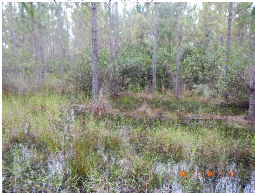
Photo 497. View of Wetland: Planted Pine-Marsh as seen looking south from GPS location 8699 (Frame 7722 (10/02/15).