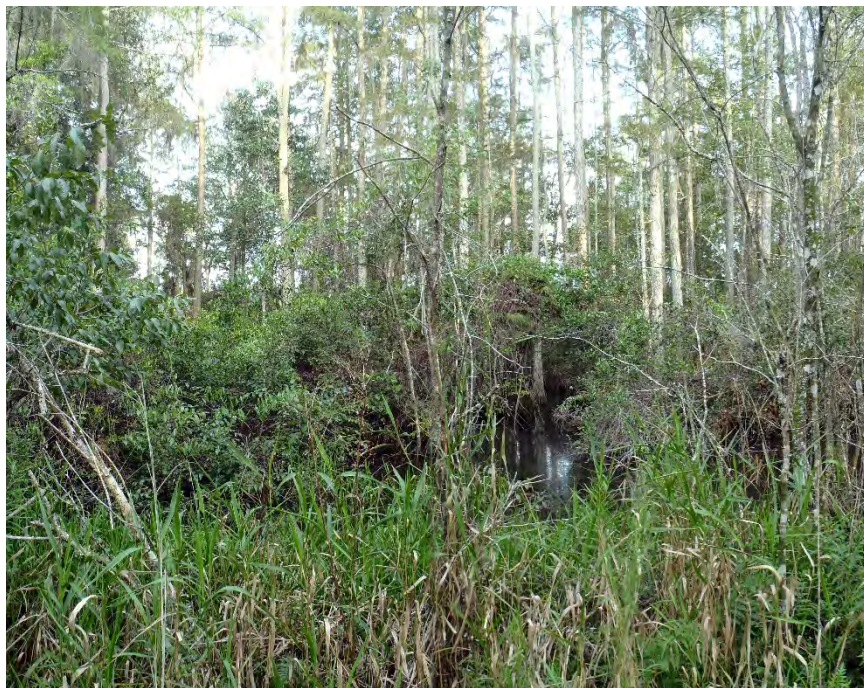
Photo 358. View of Wetland: Cypress-Mixed Hardwoods-Bays as seen looking east from GPS location 7086 (Frames 2171-2172; 09/11/15).