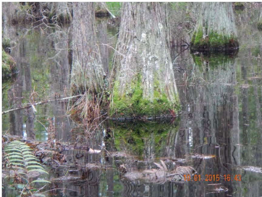
Photo 472. View of moss and lichen lines on Taxodium ascendens at GPS location 8363 (Frame 7691; 10/01/15).