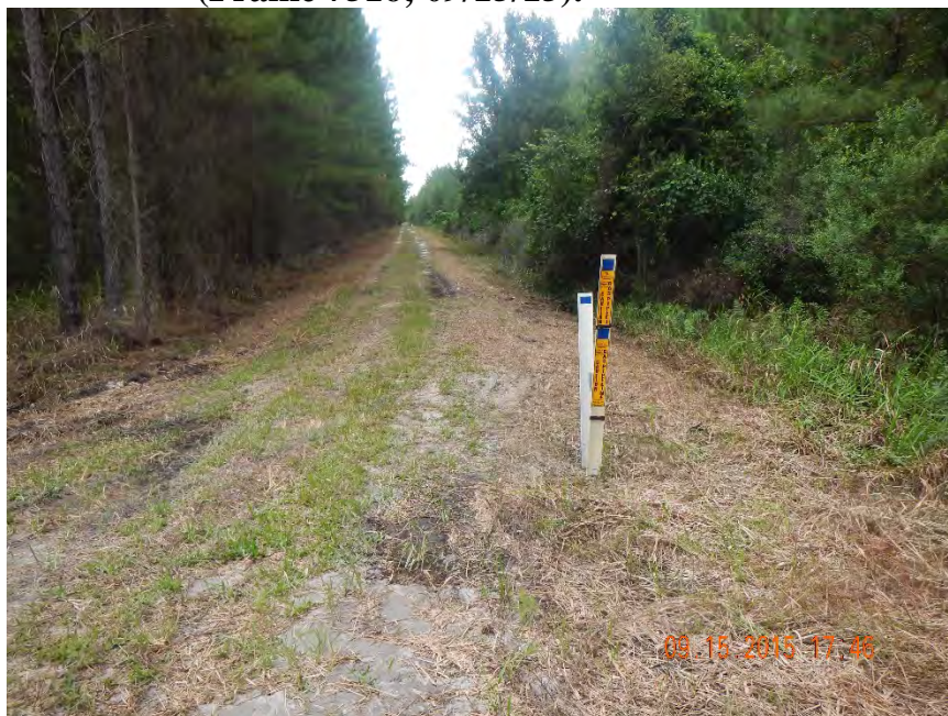
Photo 383. View to north of gas line as seen from Physical Feature: Culvert at GPS location 7404 (Frame 7517; 09/15/15).