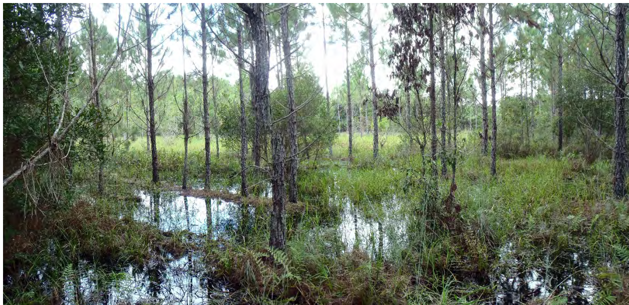
Photo 332. View of Wetland: Marsh as seen looking south from GPS location 6670 (Frames 2120-2121; 09/10/15).