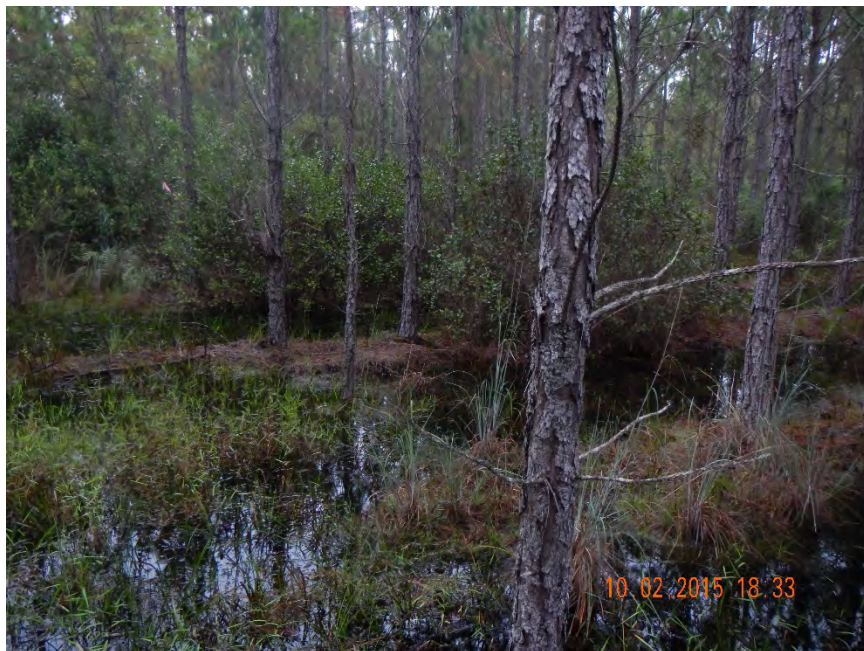
Photo 498. View of Wetland: Planted Pine-Marsh as seen looking north from GPS location 8704 (Frame 7723; 10/02/15).