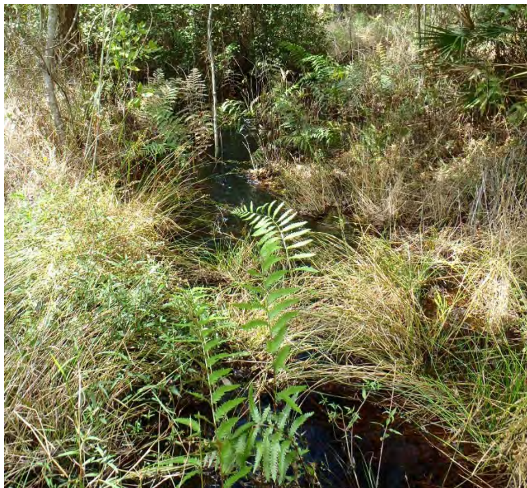
Photo 340. View of Wetland: Natural Flow-way as seen looking northwest from GPS location 6858 (Frame 2140; 09/11/15).