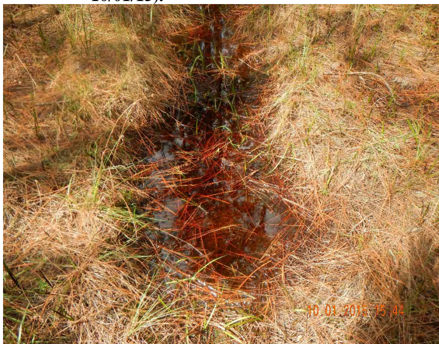
Photo 459. View of surface water in Hydric: Planted Pine Flatwoods at GPS location 8256 (Frame 7677; 10/01/15).