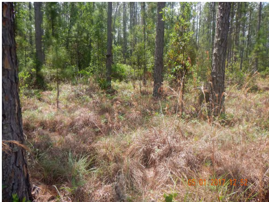
Photo 570. View of Hydric Planted Pine Flatwoods community at GPS location 10699 (Frame 1563; 05/01/17).