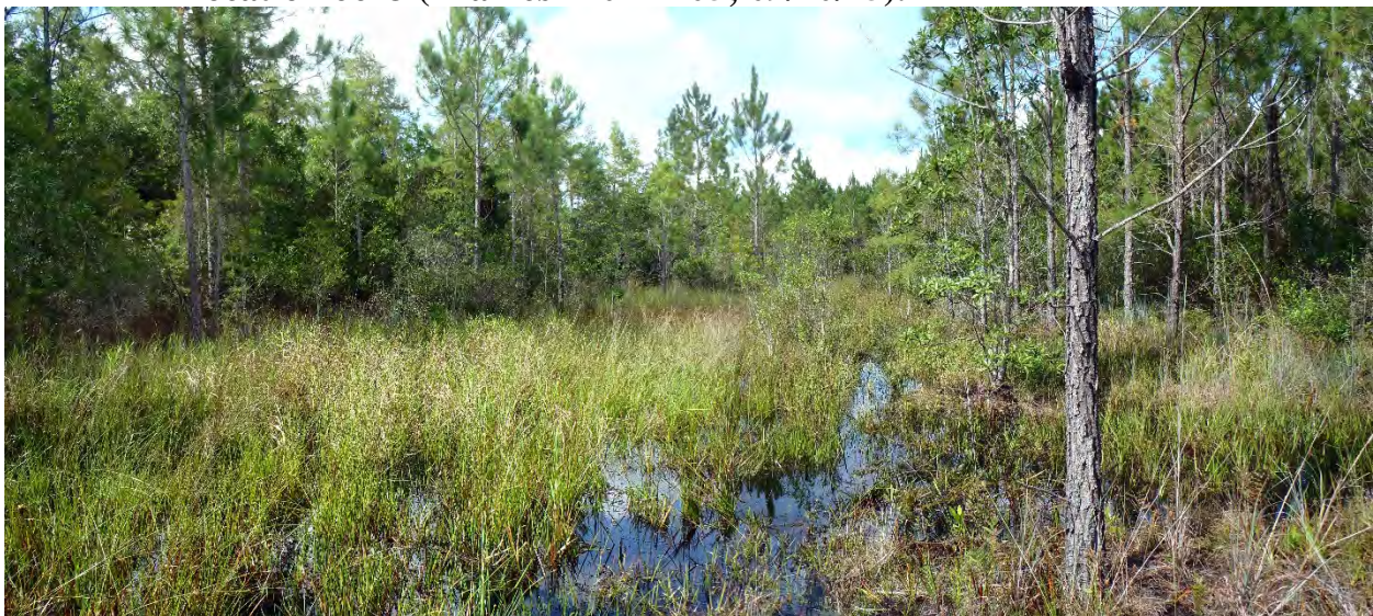
Photo 323. View of Wetland: Marsh as seen looking north from GPS location 6630 (Frames 2106-2107; 09/10/15).