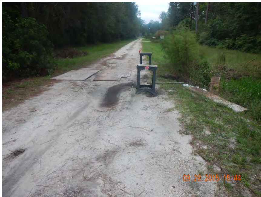
Photo 434. View of eroded Physical Feature: Culvert as seen looking east from GPS locations 8099-8100 (Frame 7646; 09/29/15).