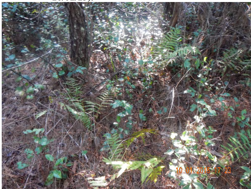
Photo 479. Lyonia lucida and Woodwardia virginiana ground cover occurring at GPS location 8416 (Frame 7698; 10/01/15).