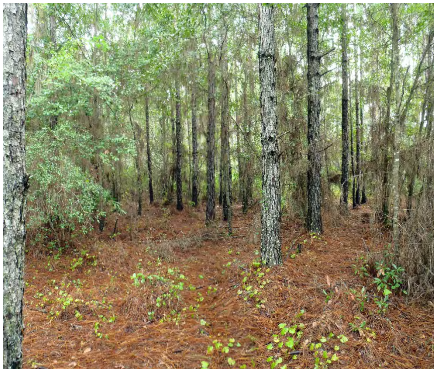
Photo 290. View of Mesic: Planted Pine-Mesic Pine Flatwoods as seen looking east from GPS location 5959 (Frames 2029-2030; 09/08/15).