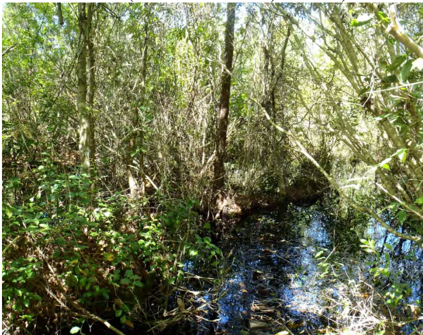
Photo 337. View of Wetland: Mixed Shrubs & Vines as seen looking north from GPS location 6794 (Frames 2134-2135; 09/11/15).