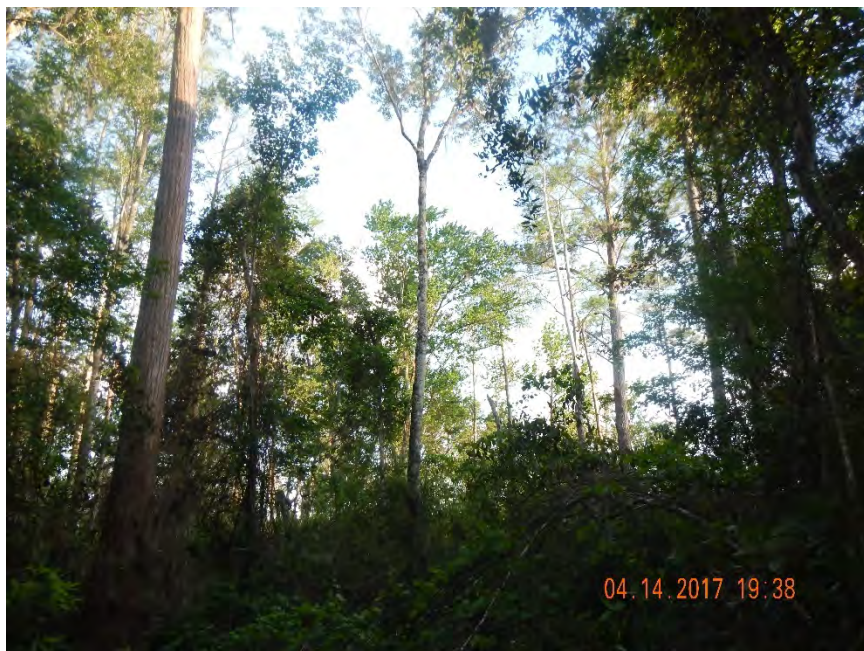
Photo 552. View of very disturbed historical cypress habitat with minimal pine and cypress canopy and very dense shrubs and briers as seen at GPS location 10396 (Frame 1468; 04/14/17).