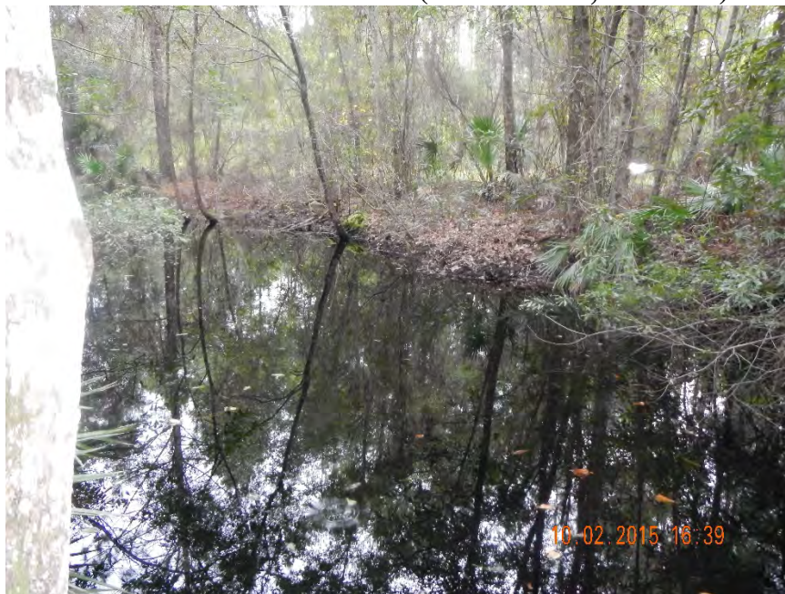
Photo 485. View of excavated pond occurring at GPS location 8574 (Frame 7708; 10/02/15).