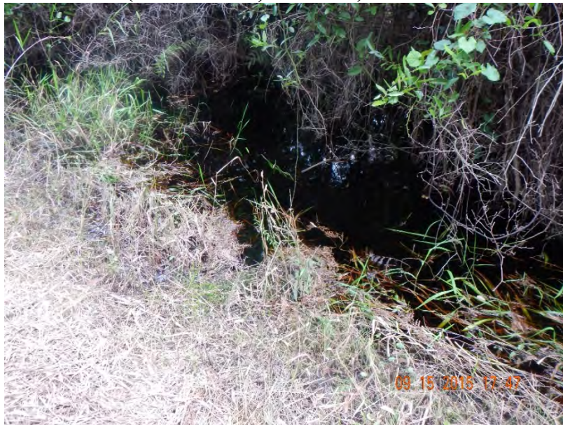
Photo 385. View of east area at east end (downstream) of Physical Feature: Culvert located at GPS location 7405. Water flows here from GRU property, north into ditch along gas line, then east into a large wetland area (Frame 7519; 09/15/15).