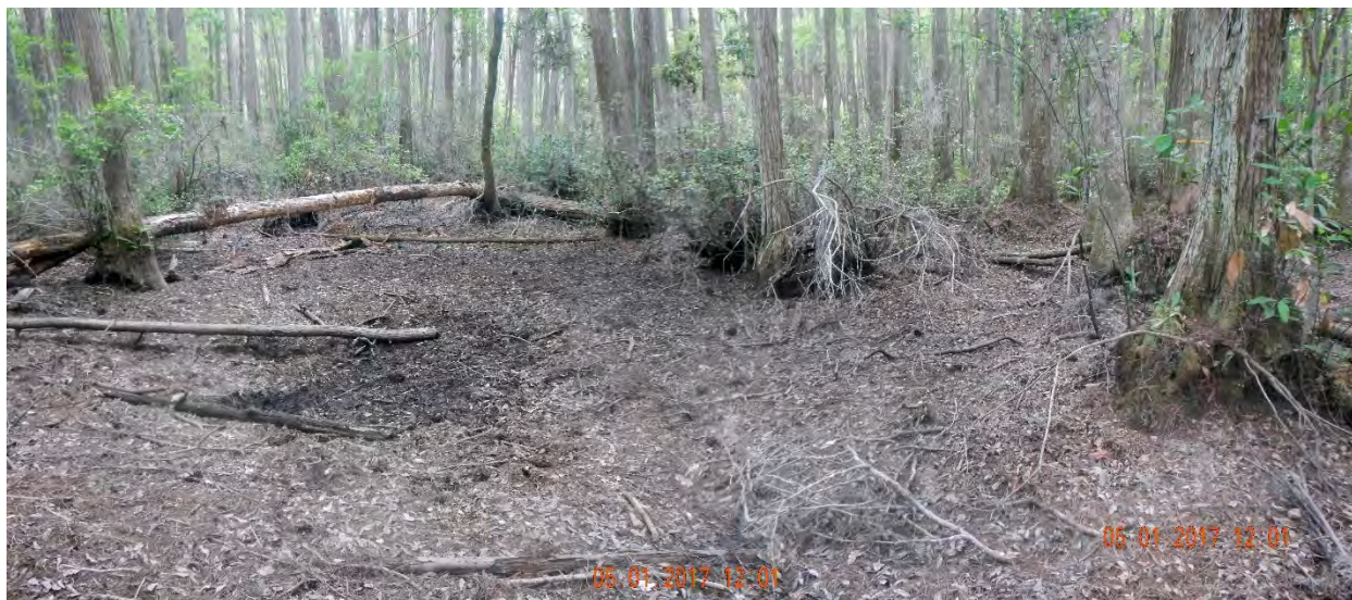
Photo 565. Panoramic view of deep water area within central area of Cypress Wetland as seen at GPS location 10657 (Frames 1557–1558; 05/01/17).