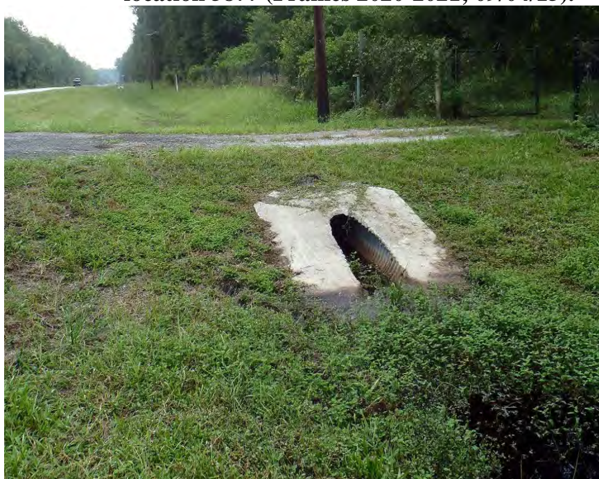
Photo 285. View of Physical Feature: Culvert as seen looking east from GPS location 5885 (Frame 2022; 09/04/15).