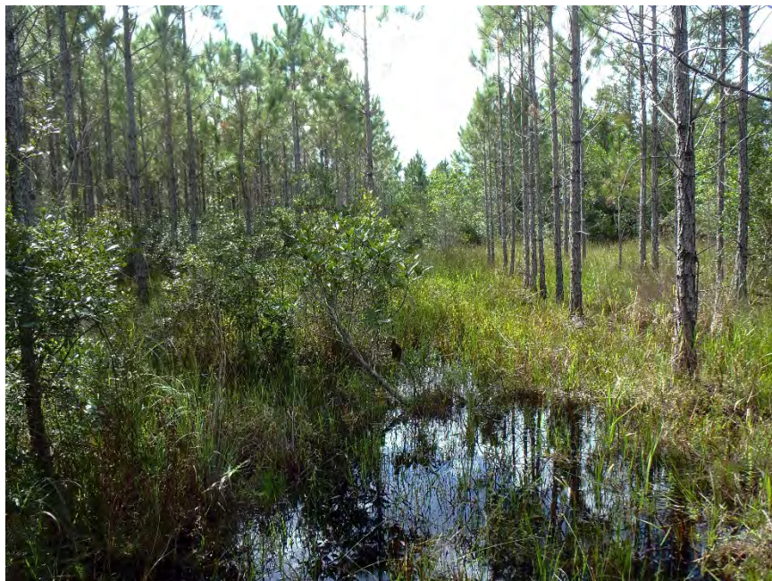
Photo 328. View of Wetland: Planted Pine-Marsh as seen looking west from GPS location 6634 (Frame 2113; 09/10/15).