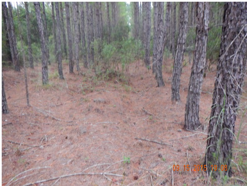
Photo 404. View of Mesic: Planted Pine-Mesic Pine Flatwoods as seen looking north from GPS location 7526 (Frame 7540; 09/15/15).