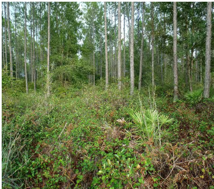
Photo 430. View of Mesic: Planted Pine-Mesic Pine Flatwoods as seen looking east from GPS location 8026 (Frames 2213-2214; 09/18/15).