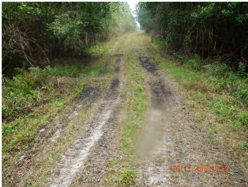
Photo 372. View to south of gas line through Wetland: Cypress-Mixed Hardwoods-Bays as seen at culvert location at GPS location 7360 (Frame 7503; 09/15/15).