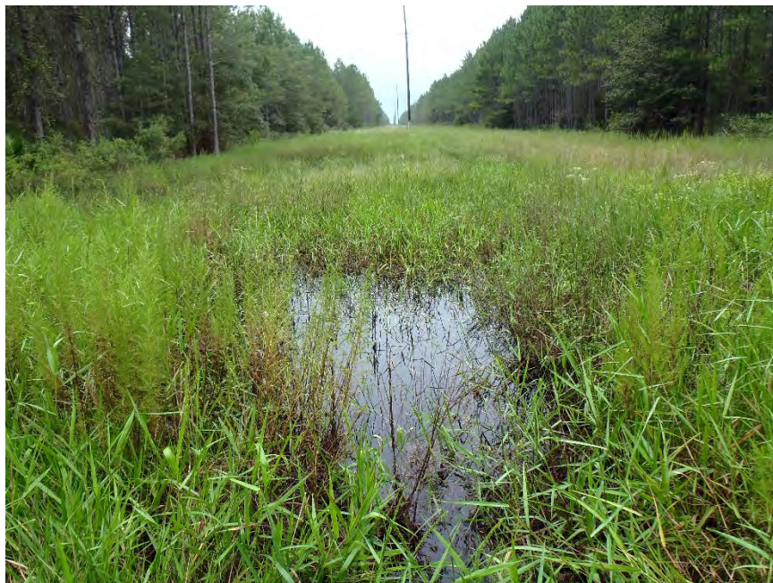
Photo 412. View of wetland marsh located south of power line access road as seen looking west from culvert located at GPS location 7756 (Frame 2186; 09/18/15).