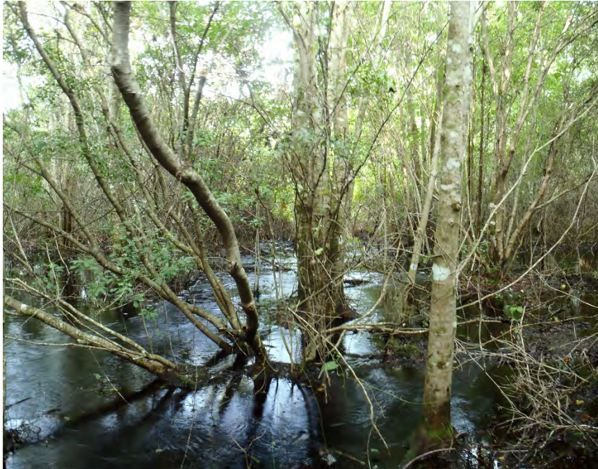
Photo 300. View of Wetland: Natural Flow-way as seen looking east from GPS location 6199 (Frames 2056-2057; 09/08/15).