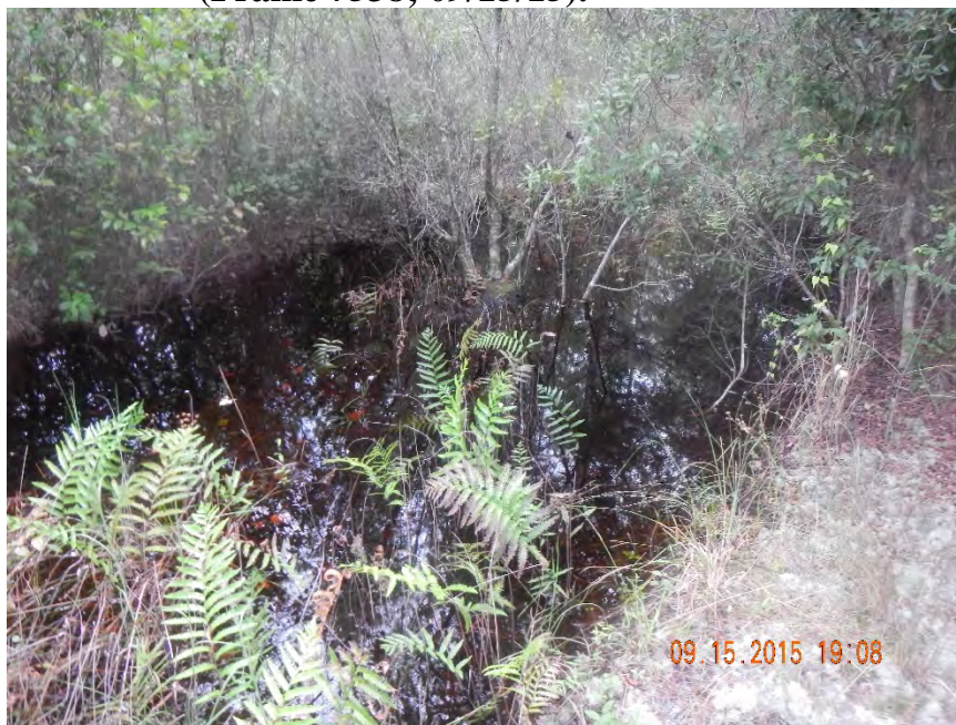
Photo 403. View of Surface Water: Excavated Ditch within Upland-Roadside Ditch within the Mesic: Planted Pine-Mesic Pine Flatwoods community at GPS location 7523 (Frame 7539; 09/15/15).