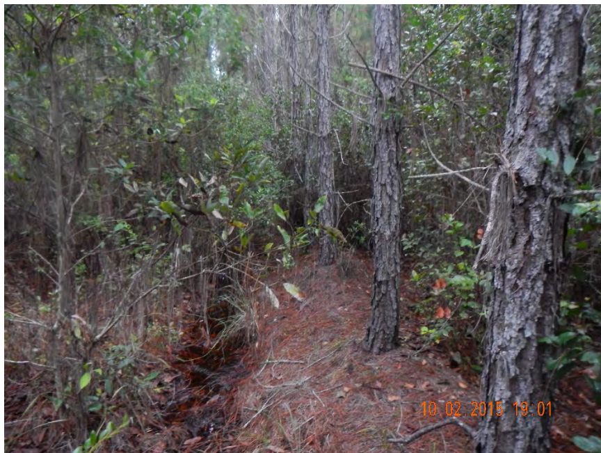
Photo 504. View of Hydric: Planted Pine Flatwoods as seen looking west from GPS location 8744 (Frame 7730; 10/02/15).