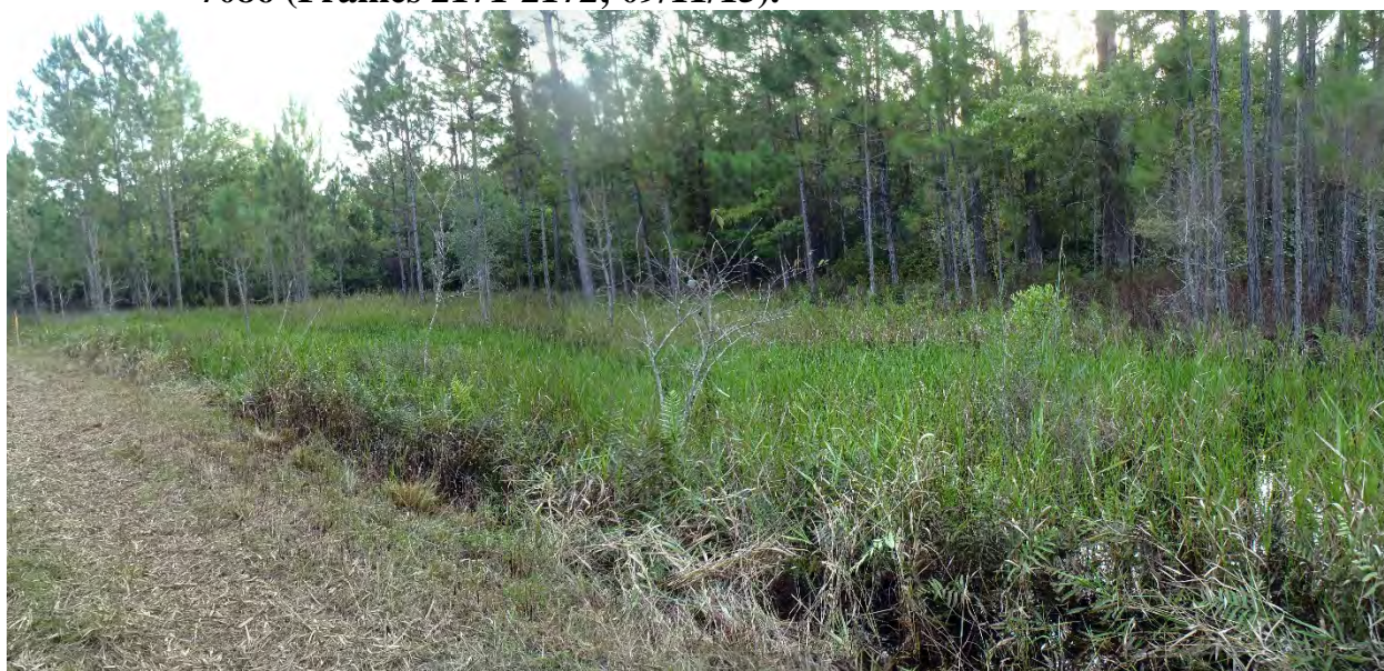
Photo 359. View of Wetland: Marsh as seen looking west from GPS location 7093 (Frames 2173-2174; 09/11/15).