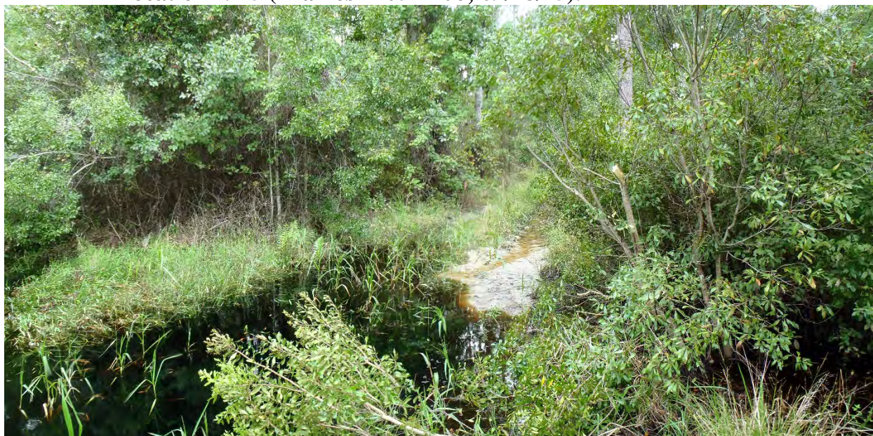
Photo 427. View of Wetland: Natural Flow-way as seen looking west from GPS location 7945 (Frames 2207-2208; 09/18/15).