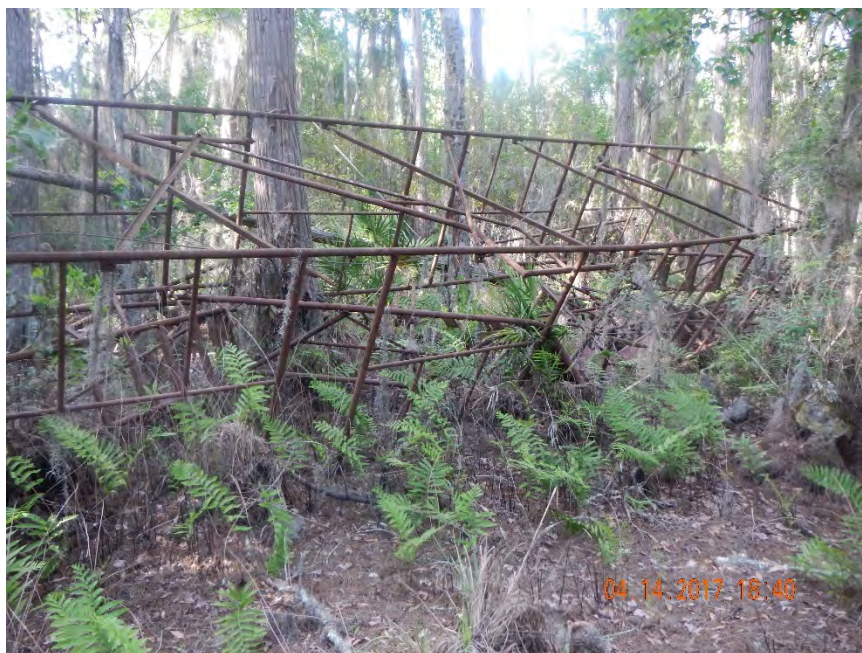
Photo 548. Tower.