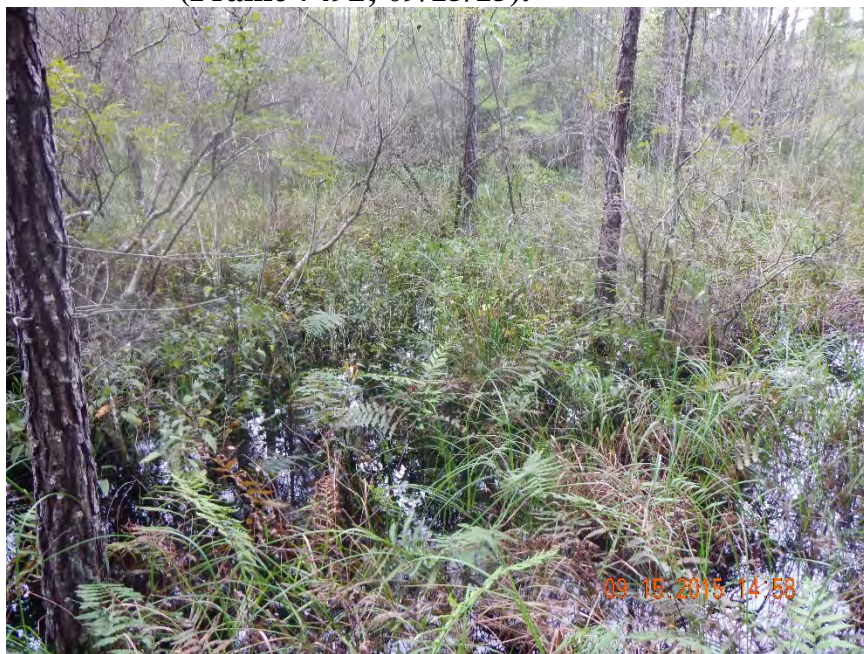
Photo 363. View of Wetland: Cypress-Mixed Hardwoods-Bays as seen looking west from GPS location 7304 (Frame 7494; 09/15/15).