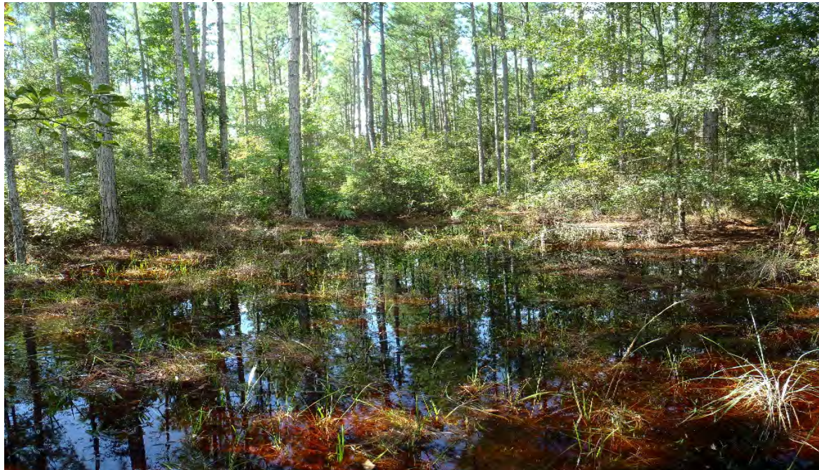
Photo 305. View of Wetlands: Mixed Hardwood Swamp-Bays-Fetterbush as seen looking southwest from GPS location 6272 (Frames 2066-2067; 09/09/15).