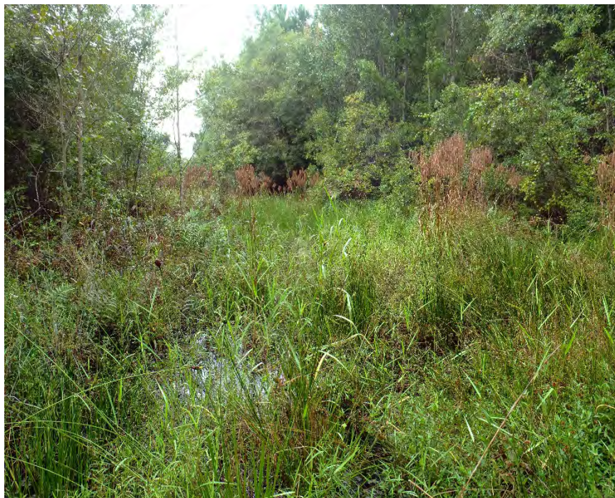
Photo 420. View of Wetland: Marsh as seen looking southwest from GPS location 7854 (Frames 2193-2194; 09/18/15).