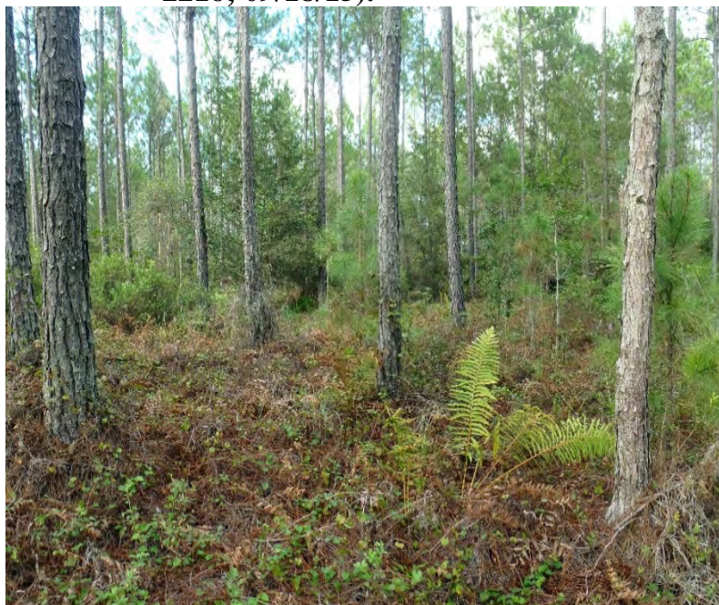
Photo 433. View of Mesic: Planted Pine-Mesic Pine Flatwoods as seen looking northeast from GPS 8039 (Frames 2219-2220; 09/18/15).