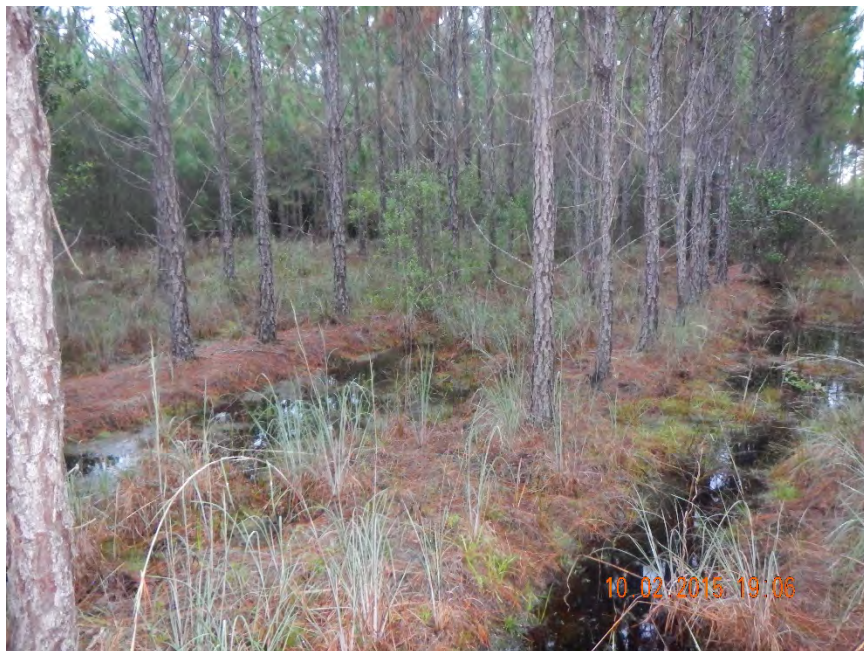
Photo 506. View of Hydric: Planted Pine Flatwoods as seen looking northwest from GPS location 8753 (Frame 7732; 10/02/15).