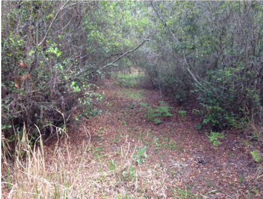
Photo 555. View of excavated ditch located at GPS location 10407 (Frame 592; 04/18/17).