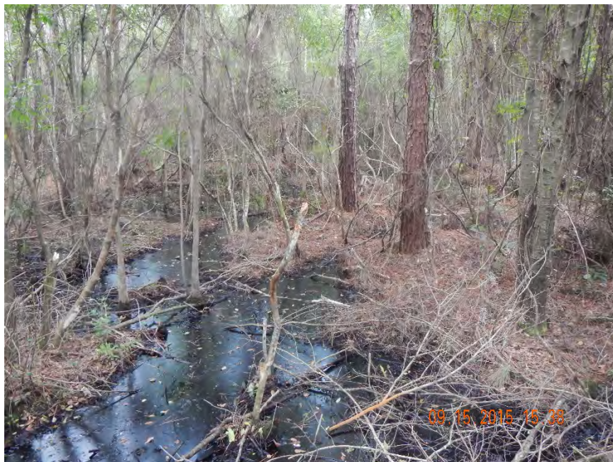
Photo 366. View of Wetland: Mixed Shrubs & Vines as seen looking southeast from GPS location 7337 (Frame 7497; 09/15/15).