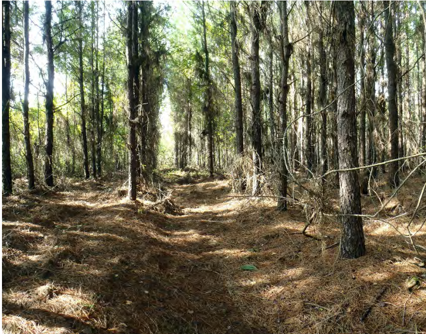
Photo 298. View of Mesic: Planted Pine-Mesic Pine Flatwoods as seen looking northeast from GPS location 6118 (Frames 2052-2053; 09/08/15).