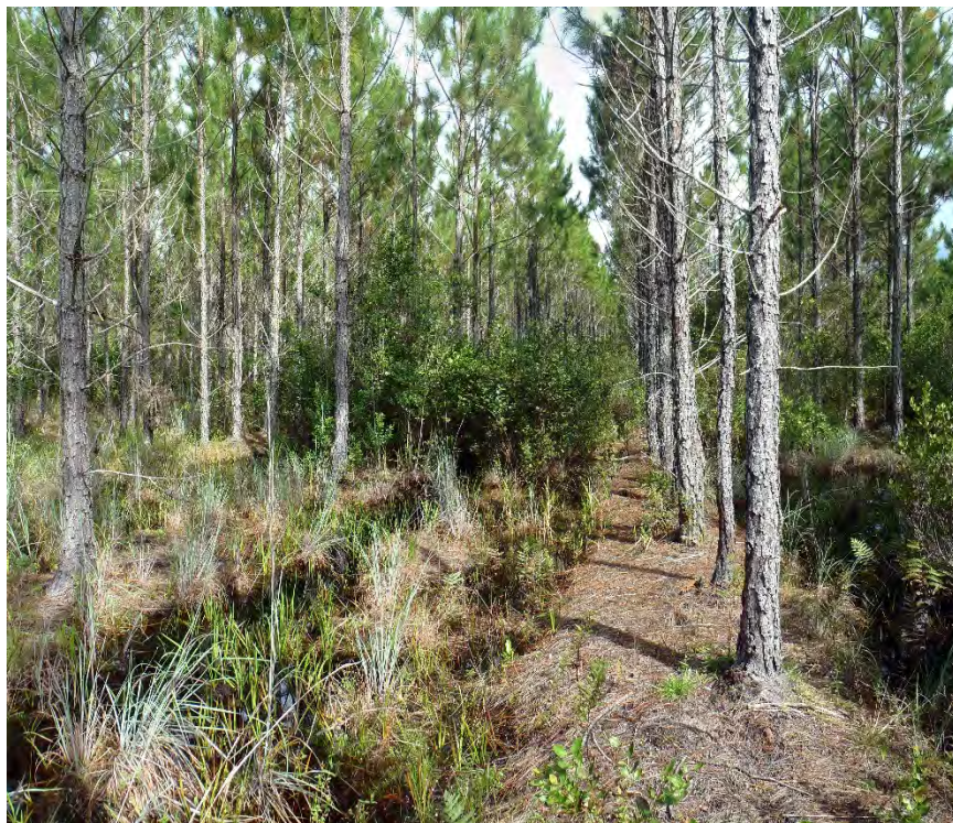
Photo 324. View of Wetland: Marsh as seen looking east from GPS location 6630 (Frames 2108-2109; 09/10/15).