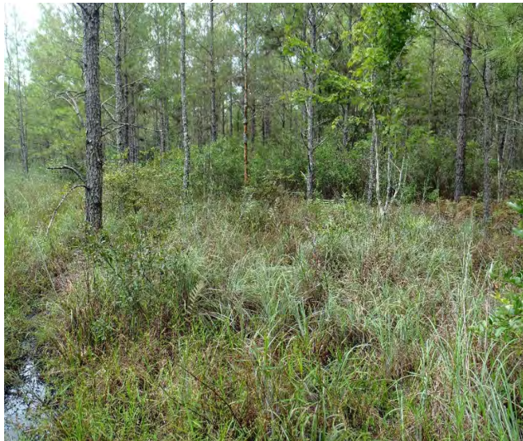
Photo 315. View of Wetland: Planted Pine-Mixed Hardwoods as seen looking west from GPS location 6545 (Frames 2090-2091; 09/09/15).