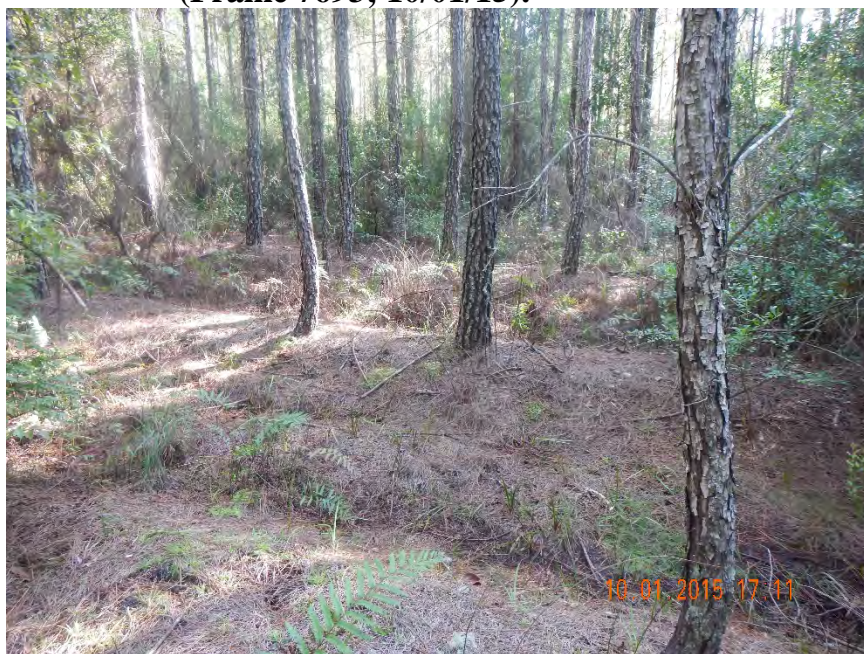
Photo 475. View of Hydric: Planted Pine Flatwoods as seen at GPS location 8398 (Frame 7694; 10/01/15).