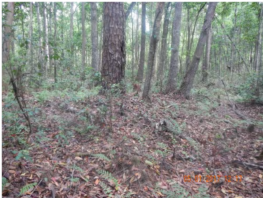
Photo 566. View of Cypress-Mixed Hardwood-Bay Swamp as seen at GPS location 10655 (Frame 1559; 05/01/17).