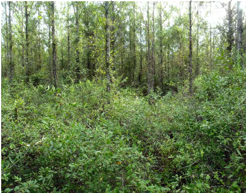
Photo 299. View of Mesic: Planted Pine-Mesic Pine Flatwoods as seen looking west from GPS location 6182 (Frames 2054-2055; 09/08/15).