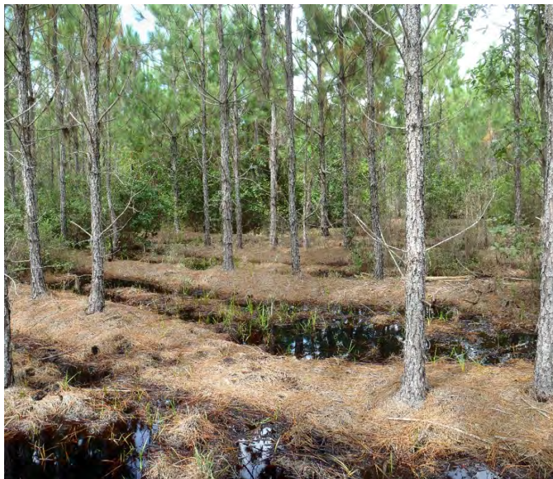
Photo 320. View of Wetland: Planted Pine-Marsh as seen looking north from GPS location 6574 (Frames 2100-2101; 09/10/15).