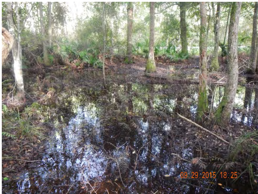
Photo 452. View of Wetland: Mixed Hardwood Swamp as seen looking east from GPS location 8215 (Frame 7668; 09/29/15).