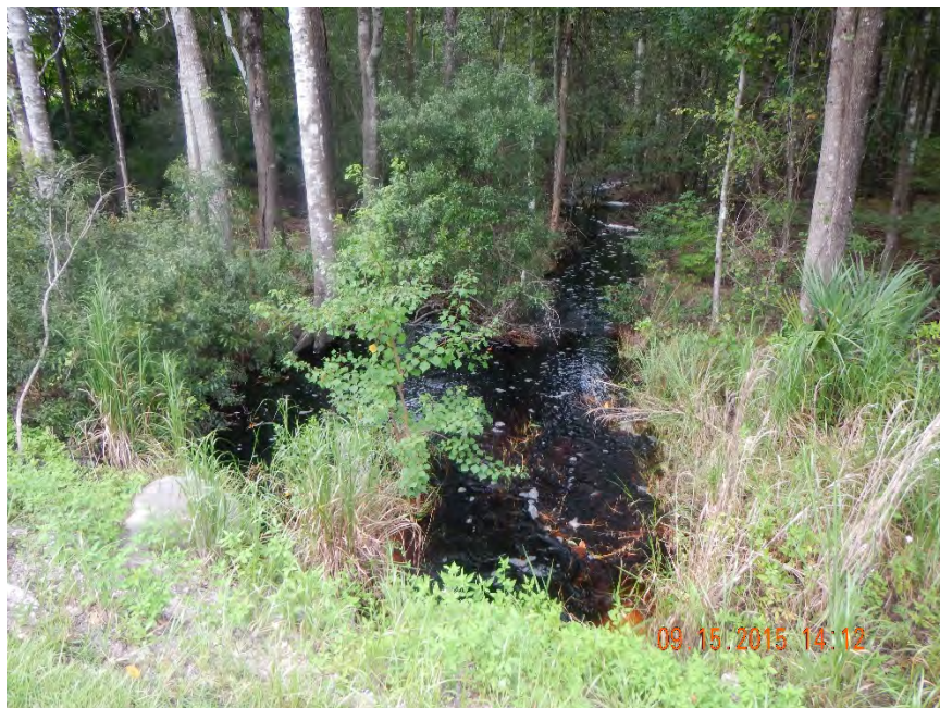
Photo 362. View of downstream area of Rocky Creek south of culverts located at GPS location 7285 (Frame 7492; 09/15/15).