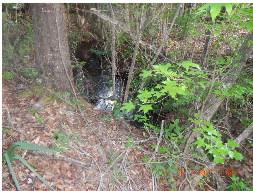
Photo 537. View of ditch south of drainage divide as seen looking south from GPS location 10304 (Frame 1452; 04/14/17).