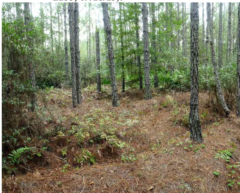
Photo 417. View of Mesic: Planted Pine-Mesic Pine Flatwoods as seen looking southwest from GPS location 7823 (Frames 2189-2190; 09/18/15).