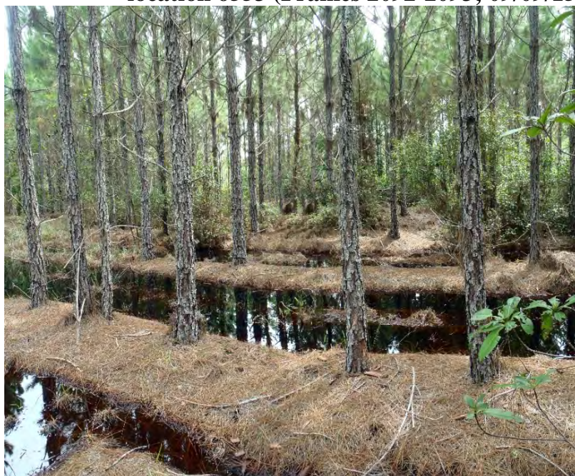
Photo 317. View of Hydric: Planted Pine Flatwoods as seen looking south from GPS location 6570 (Frames 2094-2095; 09/10/15).