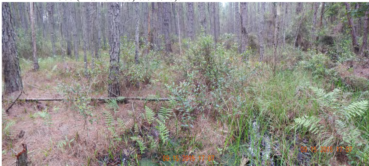
Photo 377. View of Wetland: Planted Pine-Marsh as seen looking west from GPS location 7372 (Frames 7509-7510; 09/15/15).