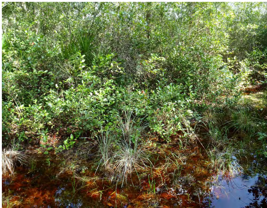
Photo 304. View of Wetlands: Mixed Hardwood Swamp-Bays-Fetterbush as seen looking north from GPS location 6272 (Frames 2064-2065; 09/09/15).