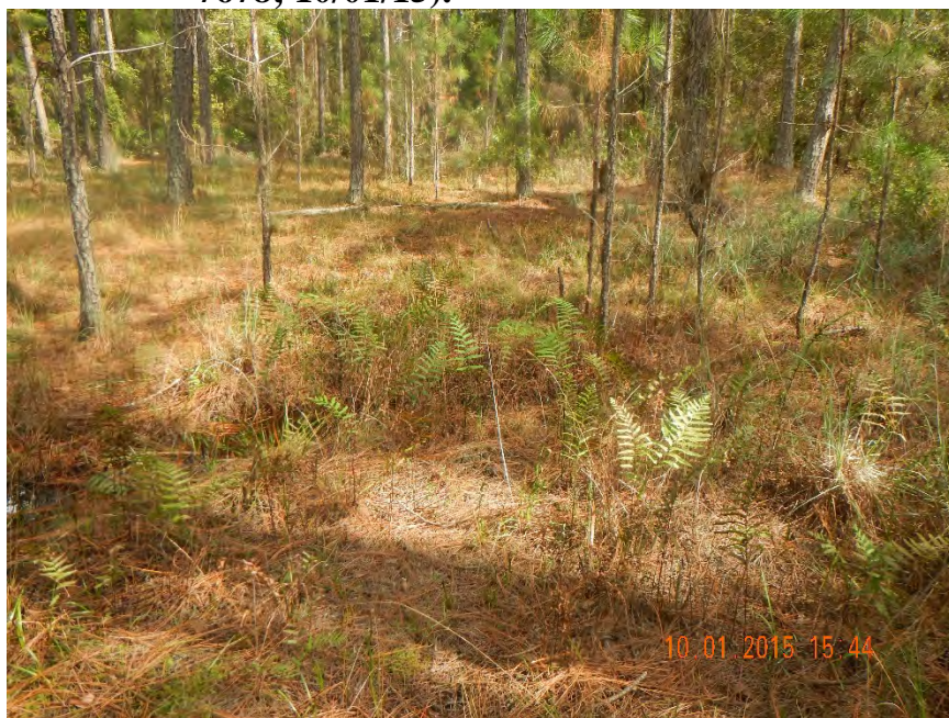
Photo 461. View of Hydric: Planted Pine Flatwoods at GPS location 8256 (Frame 7679; 10/01/15).