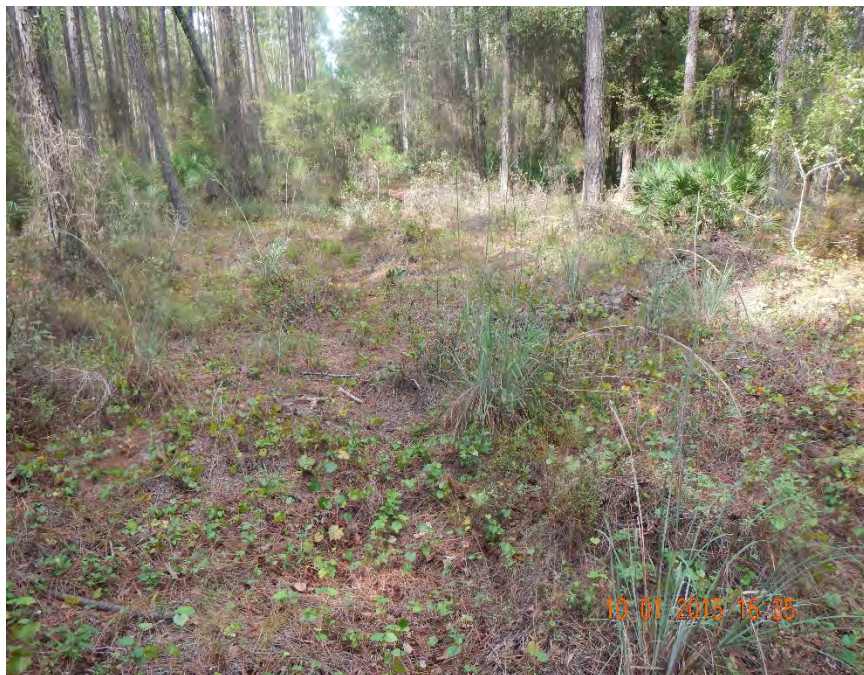
Photo 468. View of Mesic: Planted Pine-Mesic Pine Flatwoods as seen looking north to southeast from GPS location 8352 (Frame 7686; 08/31/15).