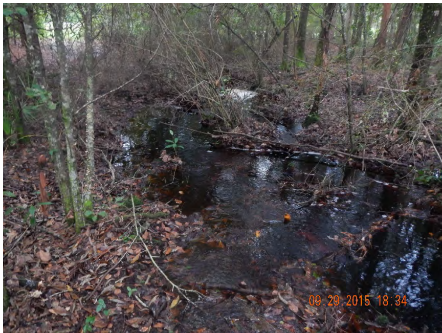
Photo 454. View of Wetland: Natural Flow-way as seen looking east (downstream) toward SR 121 from GPS location 8234 (Frame 7670; 09/29/15).