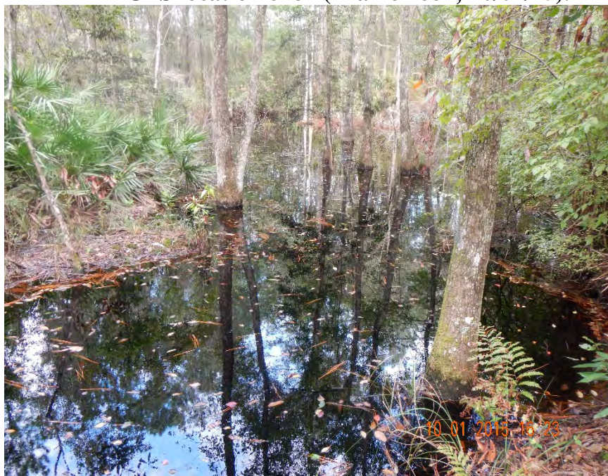
Photo 465. View of Wetland: Mixed Hardwood Swamp within excavated wetland at GPS location 8342 (Frame 7683; 10/01/15).