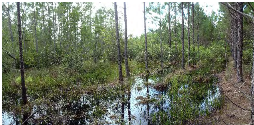
Photo 318. View of Wetland: Planted Pine-Marsh as seen looking west from GPS location 6574 (Frames 2096-2097; 09/10/15).