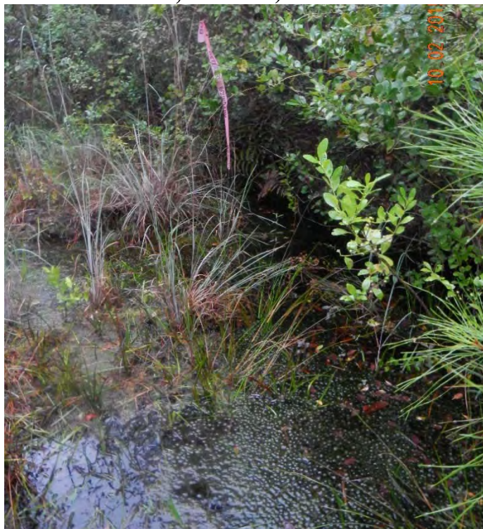
Photo 501. View of boundary of Hydric: Planted Pine Flatwoods and Wetland: Planted Pine-Marsh as seen looking north from GPS 8707 (Frame 7726; 10/02/15).