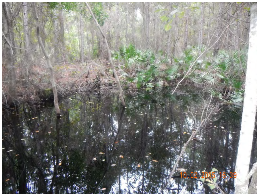
Photo 486. View of excavated pond occurring at GPS location 8574 (Frame 7709; 10/02/15).