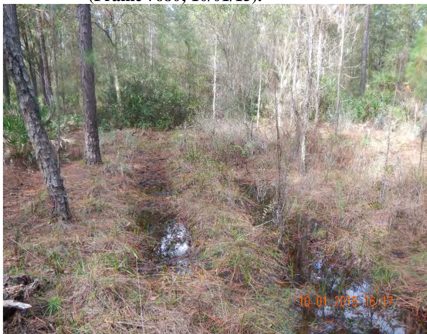
Photo 463. View of Hydric: Planted Pine Flatwoods at GPS location 8284 (Frame 7681; 10/01/15).