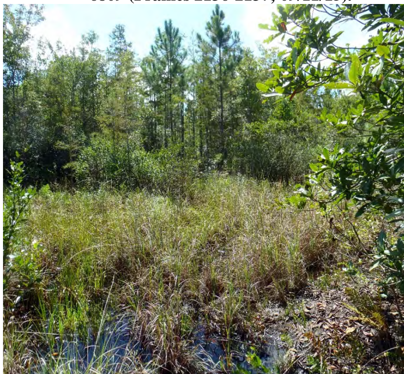
Photo 339. View of Wetland: Cypress-Mixed Hardwoods-Bays as seen looking west from GPS location 6844 (Frames 2138-2139; 09/11/15).