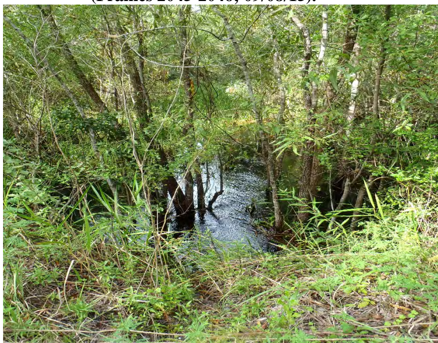
Photo 295. View of Physical Feature: Culvert as seen looking north from GPS location 6070 (Frame 2047; 09/08/15).