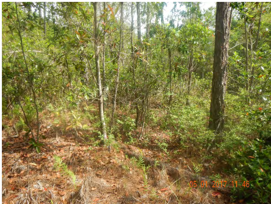
Photo 564. View of Hydric Planted Pine and Bay-dominated Flatwoods as seen at GPS location 10614 (Frame 1556; 05/01/17).