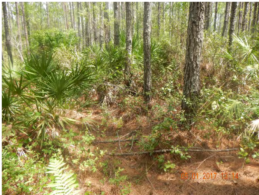
Photo 572. View of Mesic Plant Pine Flatwoods community as seen at GPS location 10737 (Frame 1566; 05/01/17).