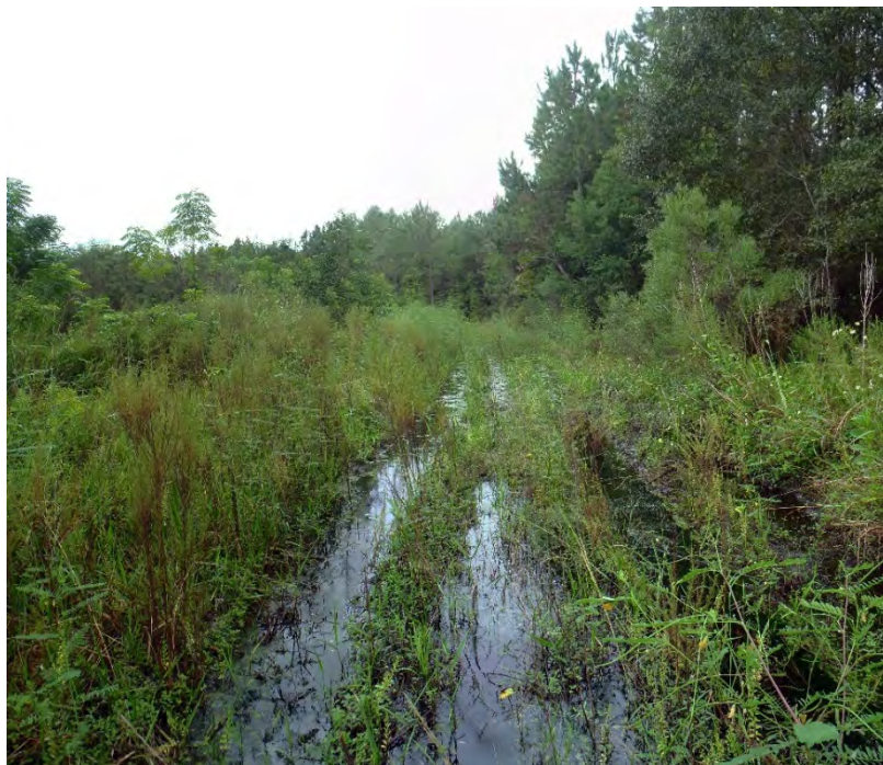
Photo 422. View of Wetland: Marsh as seen looking south from GPS location 7862 (Frames 2197-2198; 09/18/15).