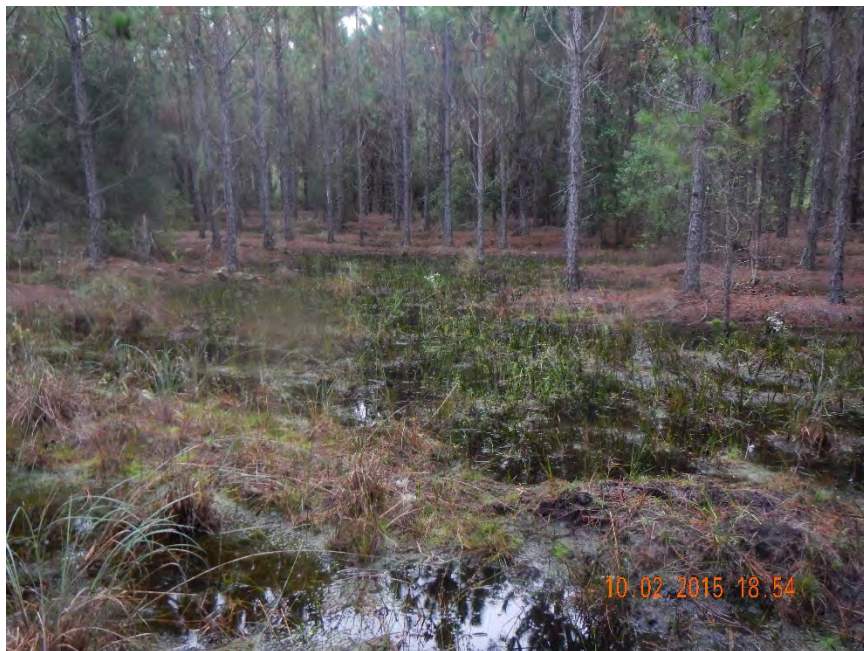
Photo 502. View of Wetland: Planted Pine-Marsh as seen looking north from GPS location 8734 (Frame 7728; 10/02/15).