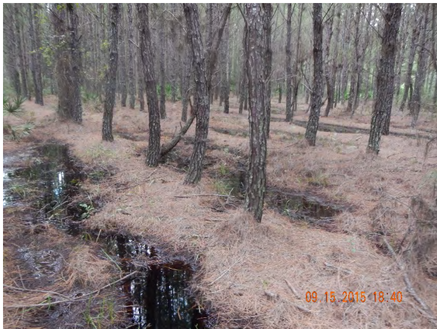
Photo 398. View of Hydric: Planted Pine Flatwoods as seen looking north from GPS location 7470 (Frame 7534; 09/15/15).