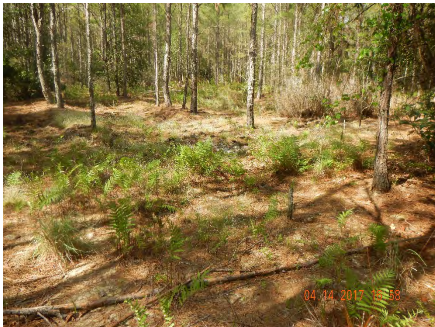
Photo 530. View of Hydric Planted Pine Flatwoods community as seen at GPS location 10242 (Frame 1441; 04/14/17).