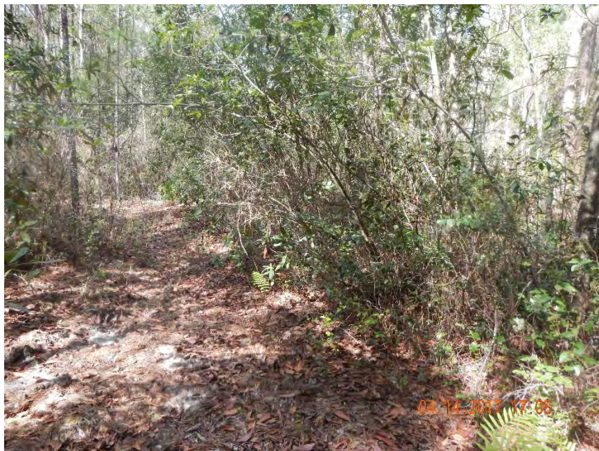
Photo 532. View of dense evergreen vegetation at boundary of pine-dominated wetland and Hydric Plant Pine Flatwoods community at GPS location 10251 (Frame 1443; 04/14/17).