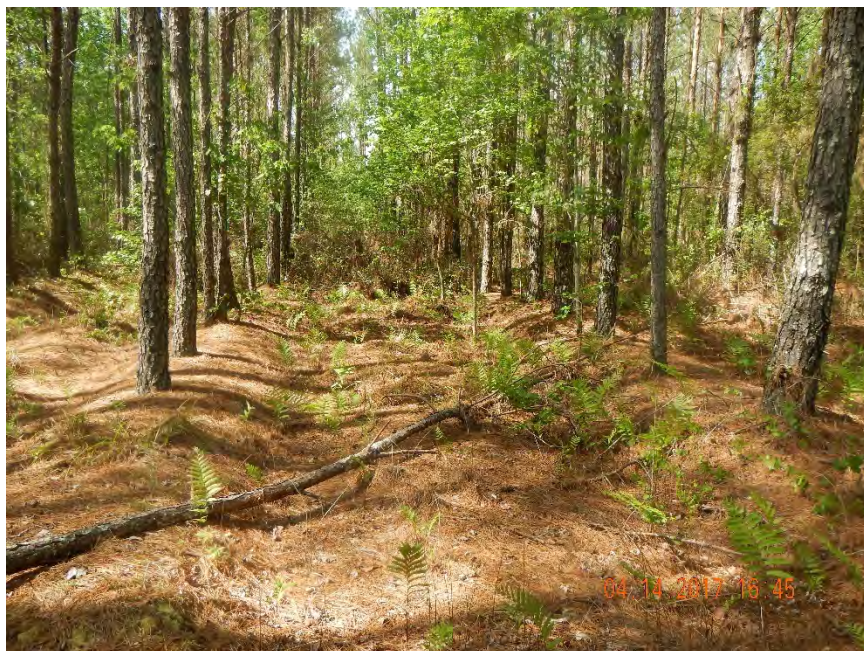
Photo 527. View of Transitional Planted Loblolly Pine Flatwoods community as seen at GPS location 10207 (Frame 1437; 04/14/17).