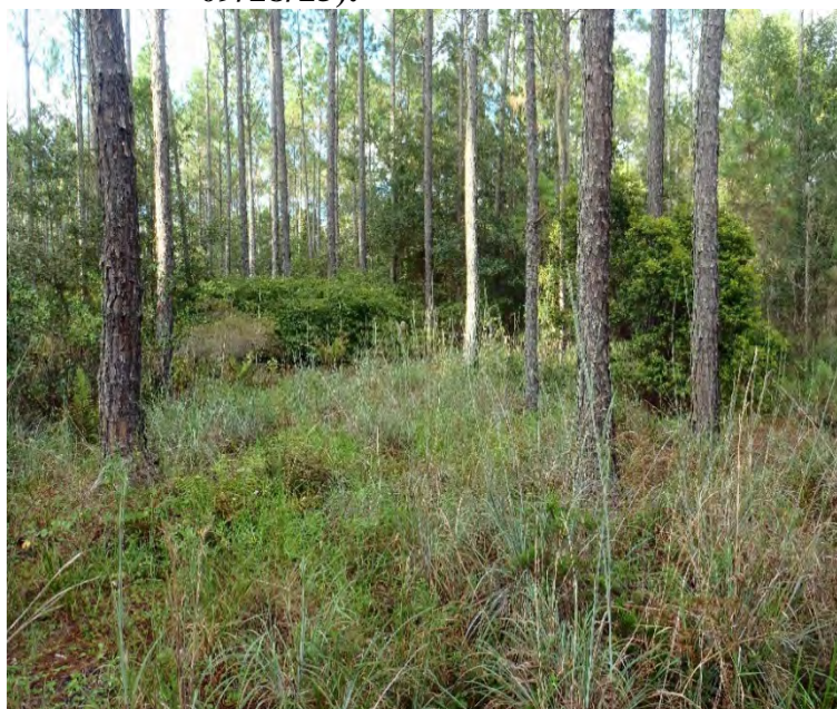
Photo 431. View of Hydric: Planted Pine Flatwoods as seen looking northeast from GPS location 8035 (Frames 2217-2218; 09/18/15).