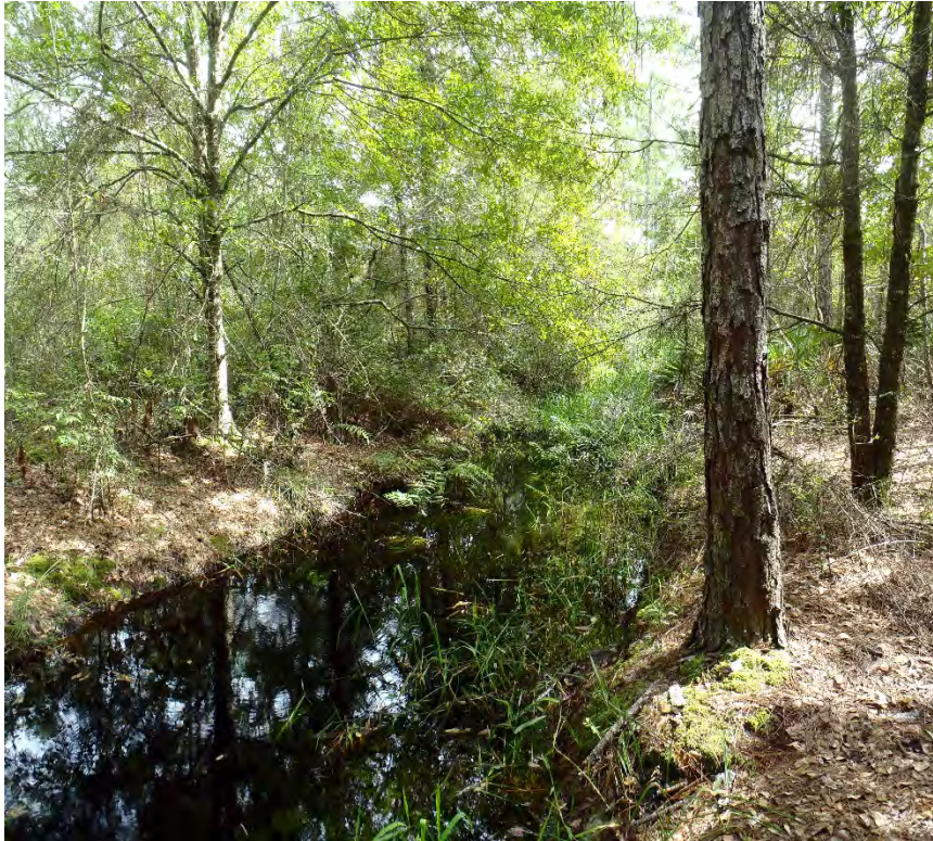
Photo 322. View of Surface Water: Excavated Creek in Wetland as seen looking south from GPS location 6613 (Frames 2104-2105; 09/10/15).