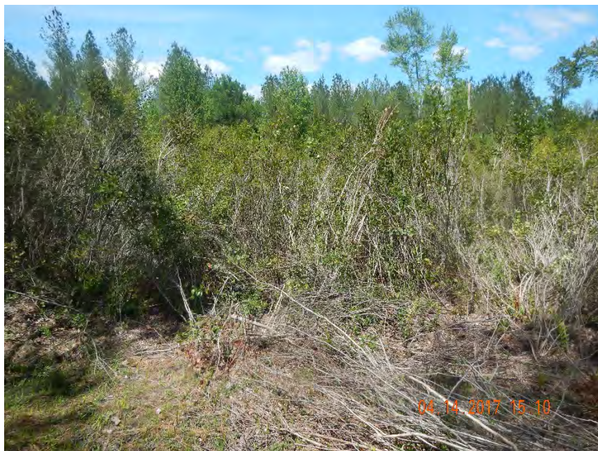
Photo 513. View of Transitional Flatwoods community as seen at GPS location 10131 (Frame 1418; 04/14/17).