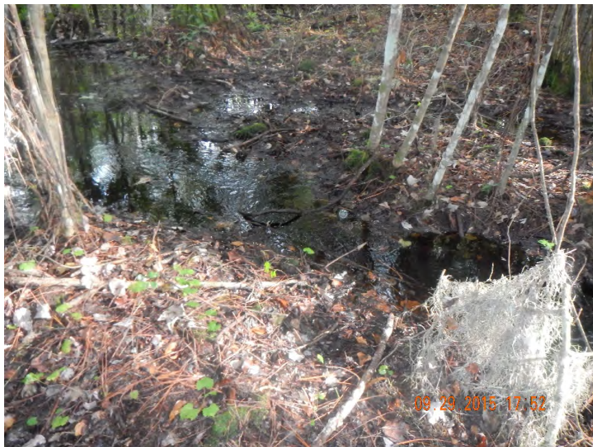
Photo 448. View of Wetland: Natural Flow-way that occurs at GPS locations 8166–8173. View is at GPS location 8168 (Frame 7663; 09/29/15).