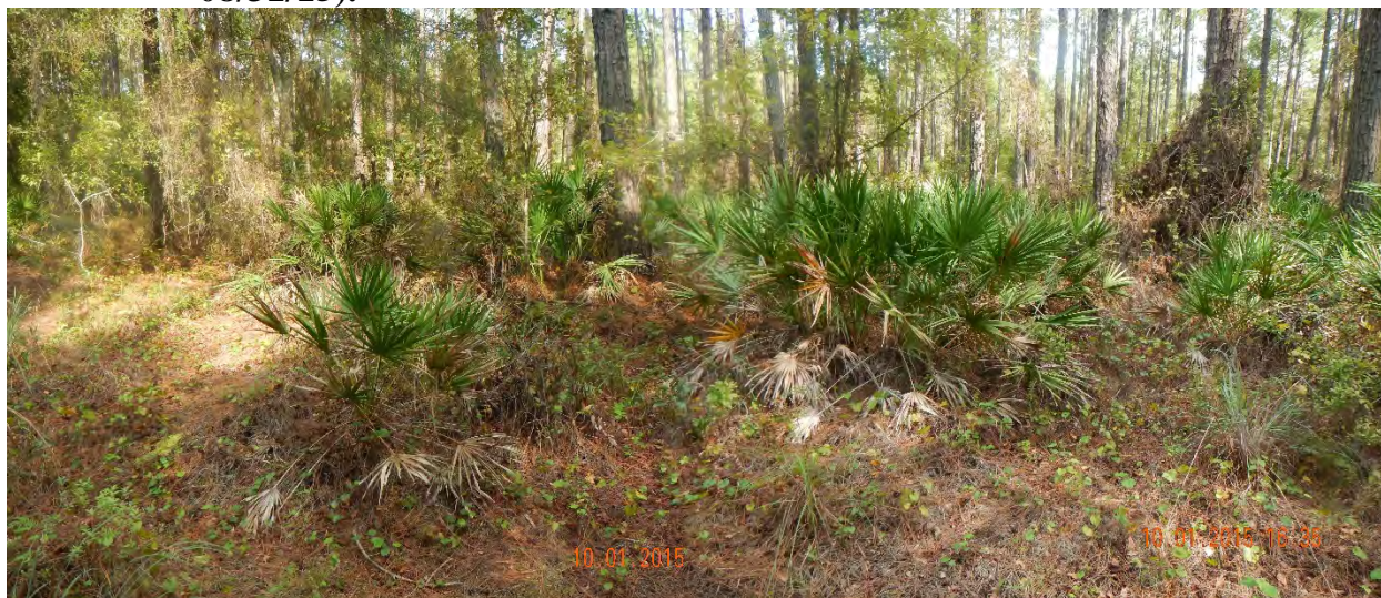
Photo 469. View of Mesic: Planted Pine-Mesic Pine Flatwoods as seen looking north to southeast from GPS location 8352 (Frames 7687-7688; 10/01/15).