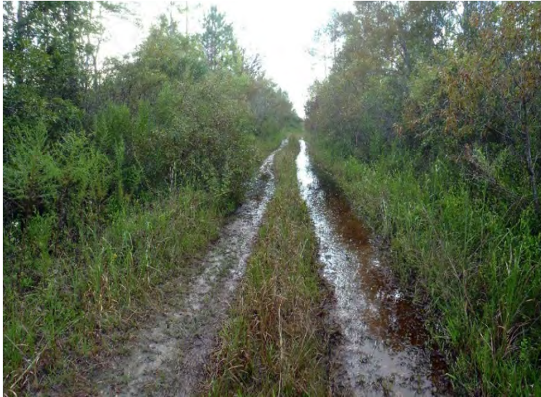
Photo 334. View of Wetland: Natural Flow-way occurring across the top of the improved forest road as seen looking northwest from GPS location 6758 (Frames 2125-2126; 09/10/15).