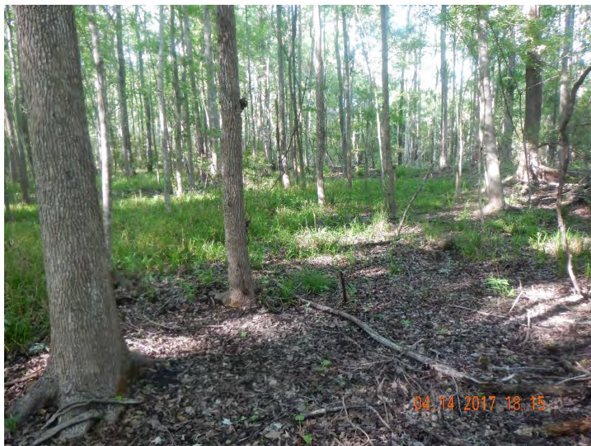
Photo 539. View of sweetgum-red maple ( Liquidambar styraciflua - Acer rubrum ) dominated Hydric Hammock as seen at GPS location 10312 (Frame 1454; 04/14/17).