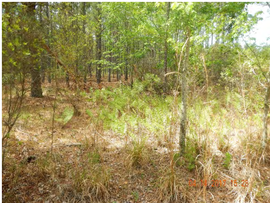
Photo 516. View of Hydric Pine Flatwoods community as seen at GPS location 10161 (Frame 1421; 04/14/17).