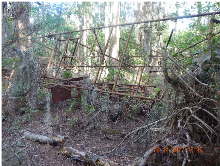
Photo 543. Experimental tower.