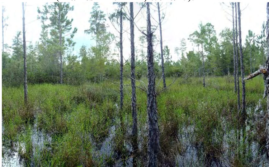
Photo 333. View of Wetland: Cypress-Mixed Hardwoods-Bays as seen looking west from GPS location 6723 (Frames 2122-2123; 09/10/15).