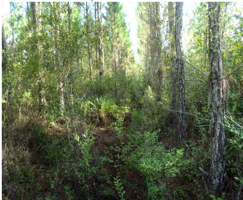
Photo 353. View of Mesic: Planted Pine-Mesic Pine Flatwoods as seen looking south from GPS location 7028 (Frames 2161-2162; 09/11/15).