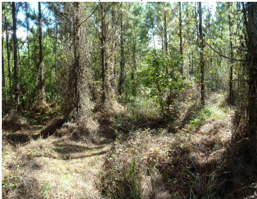
Photo 347. View of Mesic: Planted Pine-Mesic Pine Flatwoods as seen looking south from GPS location 6911 (Frames 2149-2150; 09/11/15).