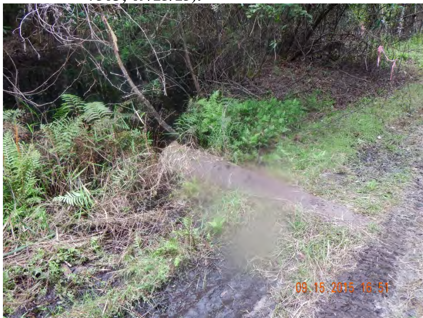
Photo 373. View of Physical Feature: Culvert as seen looking at east end (downstream) of culvert at GPS location 7360 (Frame 7504; 09/15/15).