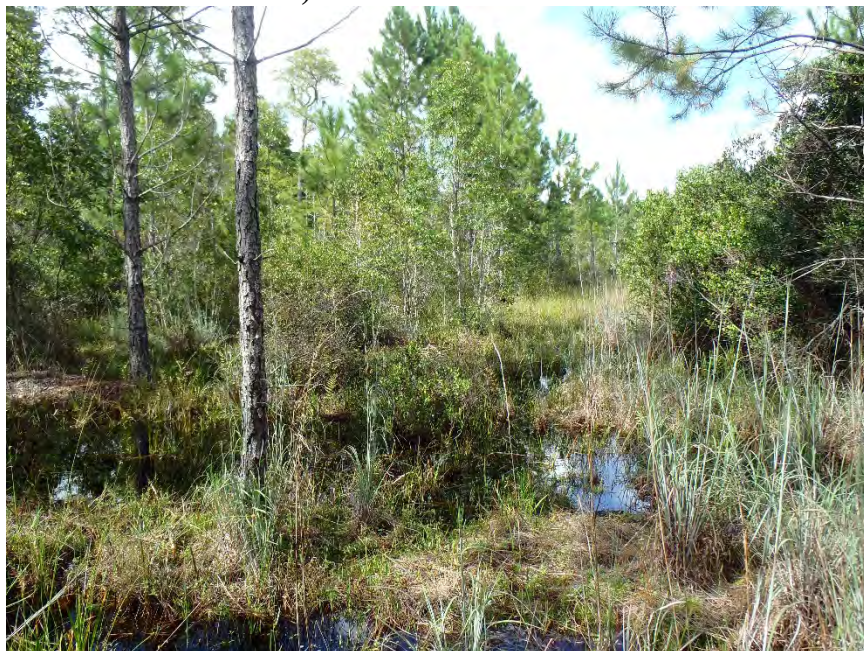
Photo 325. View of Wetland: Planted Pine-Marsh as seen looking north from GPS location 6634 (Frame 2110; 09/10/15).