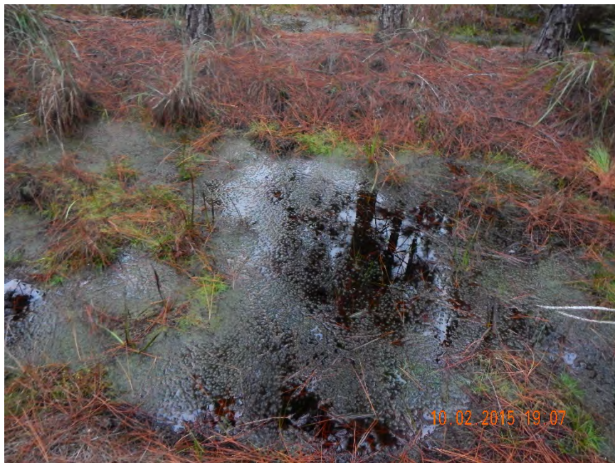
Photo 510. View of typical Hydric: Planted Pine Flatwoods groundcover and surface water as seen at GPS location 8757 (Frame 7736; 10/02/15).