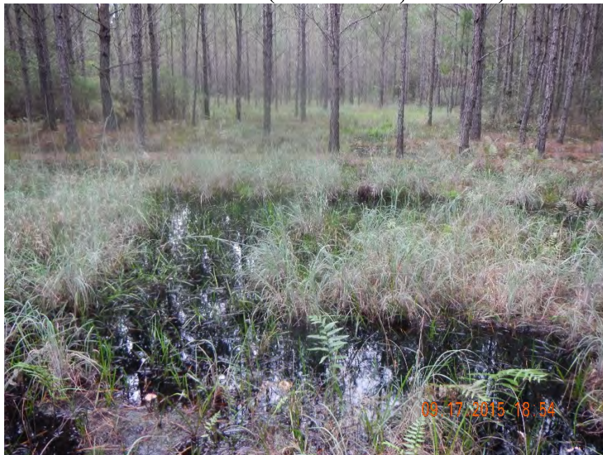
Photo 405. View of Wetland: Planted Pine-Marsh as seen at GPS location 7648 (Frame 7624; 09/17/15).