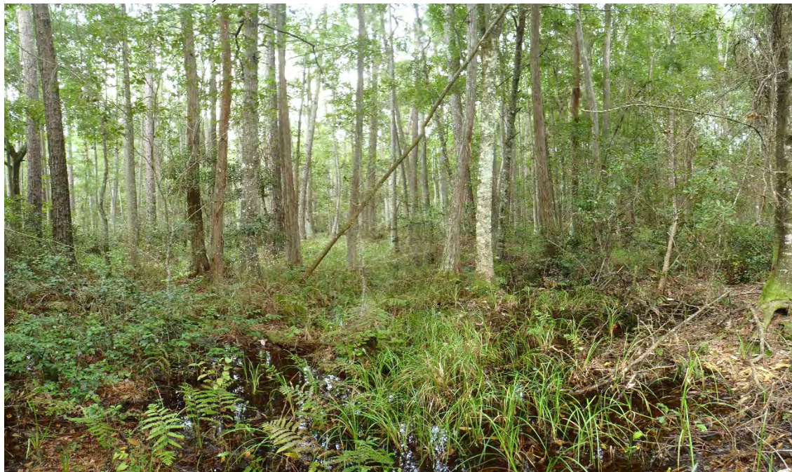
Photo 283. View of Wetland: Mixed Hardwood Swamp as seen looking east from GPS location 5854 (Frames 2016-2017; 09/04/15).