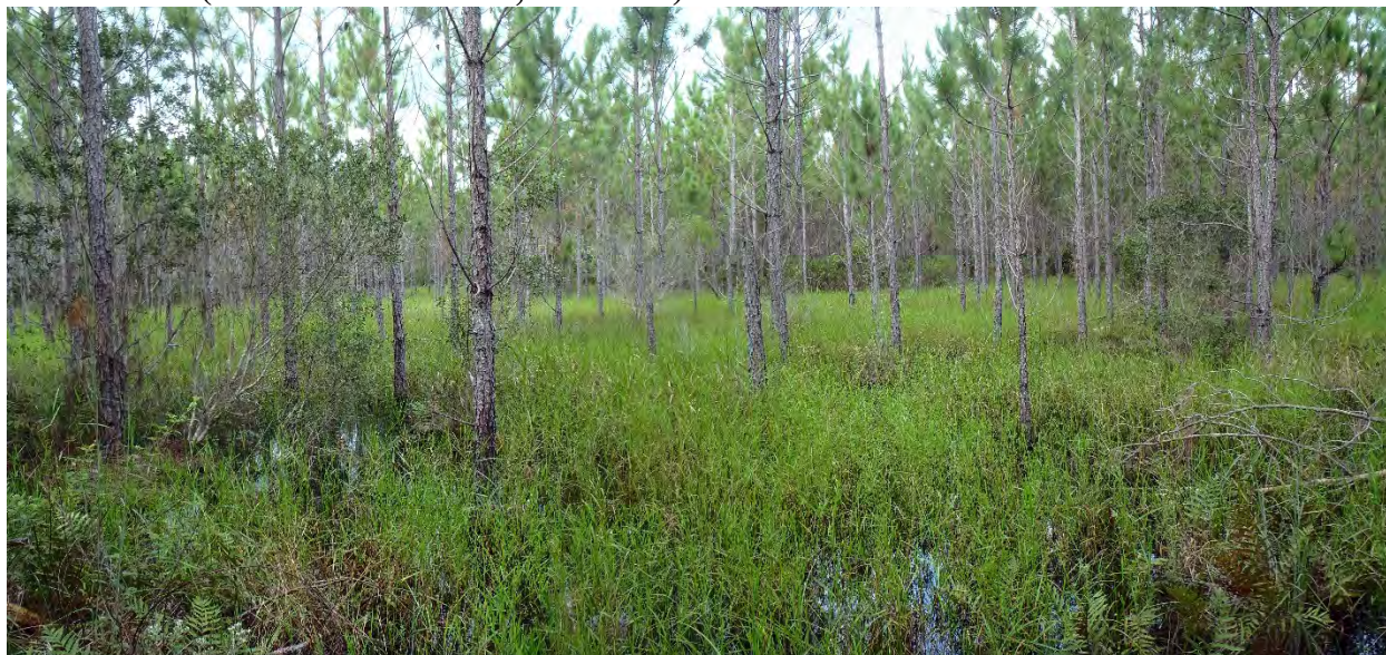
Photo 331. View of Wetland: Marsh as seen looking north from GPS location 6670 (Frames 2118-2119; 09/10/15).