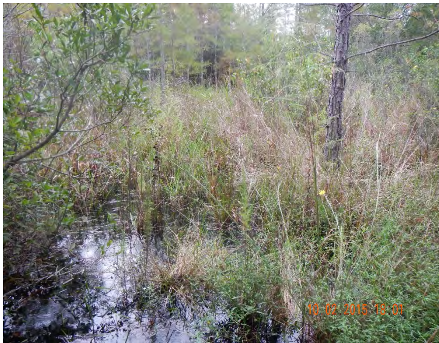
Photo 490. View of Wetland: Cypress-Mixed Hardwoods-Bays as seen looking north from GPS location 8682 (Frame 7714; 10/02/15).