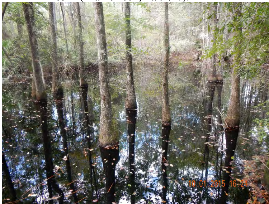
Photo 467. View of Wetland: Mixed Hardwood Swamp within excavated wetland at GPS location 8342 (Frame 7685; 10/01/15).