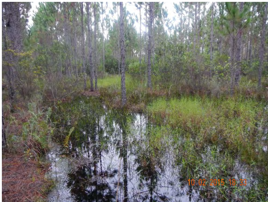
Photo 496. View of Wetland: Planted Pine-Marsh as seen looking southeast from GPS location 8699 (Frame 7721; 10/02/15).