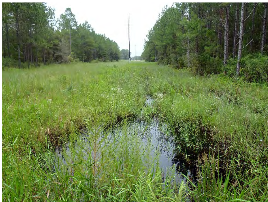
Photo 411. View of wetland marsh on south side of power line easement as seen looking east from Physical Structure: Culvert located at GPS location 7756 (Frame 2185; 09/18/15).