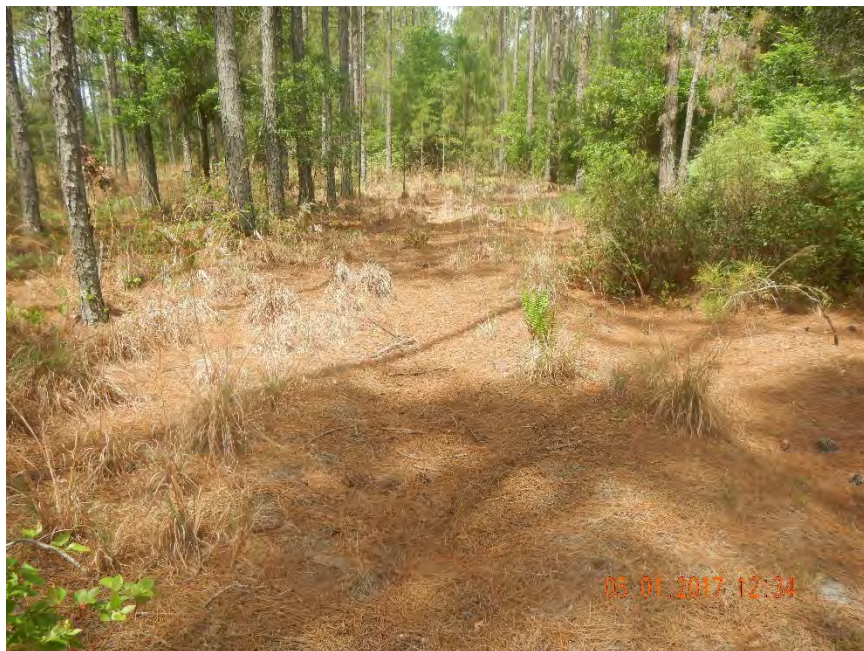
Photo 568. View of Hydric Planted Pine Flatwood habitat as seen at GPS location 10674 (Frame 1561; 05/01/17).