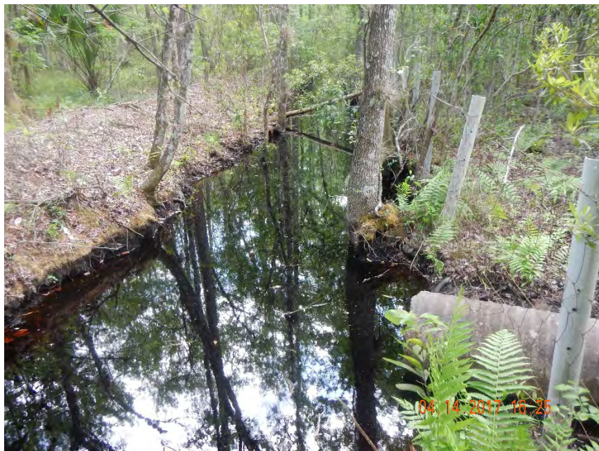
Photo 522. View of culvert located in old ditch that intercepts deeper, more recent excavation at GPS location 10184 (Frame 1431; 04/14/17).