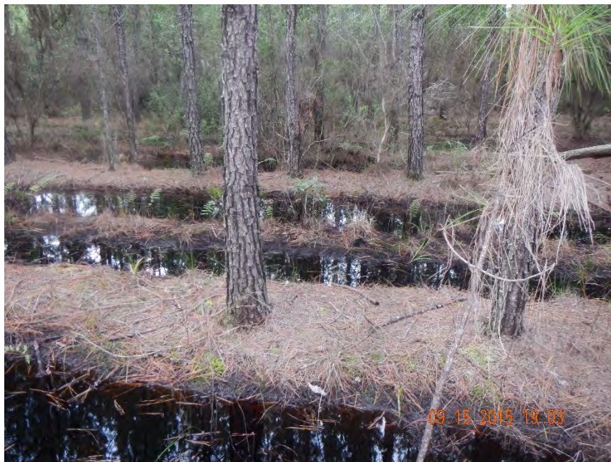
Photo 402. View of Hydric: Planted Pine Flatwoods as seen looking east from GPS location 7510 (Frame 7538; 09/15/15).