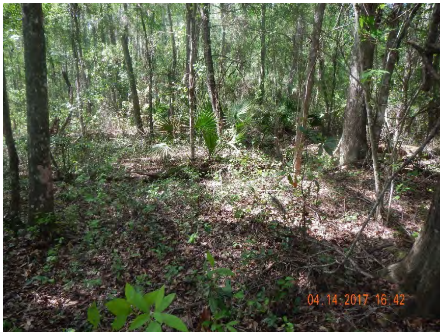
Photo 526. View of Hydric Hammock-Mixed Hardwood wetland as seen at GPS location 10204 (Frame 1436; 04/14/17).