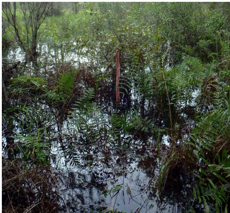
Photo 288. View of Physical Feature Boundary: Wetland Delineation Flagging within the Wetland: Planted Pine-Marsh as seen looking west from GPS location 5955 (Frame 2026; 09/08/15).