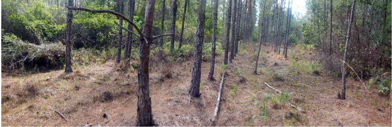
Photo 534. Panoramic view of boundary of dense shrub-covered, logged Bay wetland and adjacent Hydric Planted Pine Flatwoods community as seen at GPS location 10271 (Frames 1445-1447; 04/14/17).