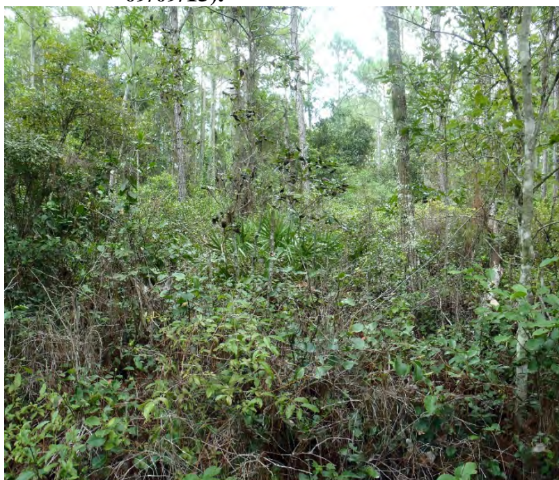
Photo 311. View of Wetlands: Mixed Hardwood Swamp-Bays-Fetterbush as seen looking east from GPS location 6394 (Frames 2082-2083; 09/09/15).