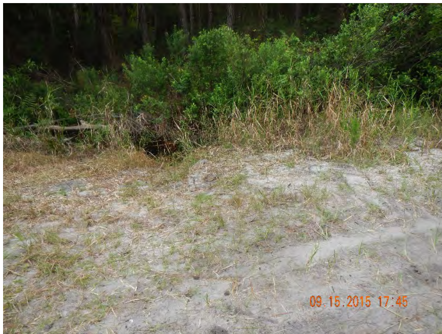
Photo 382. View of north end of Physical Feature: Culvert that runs north from GPS location 7403 to 7404 and routes water in this direction (Frame 7516; 09/15/15).