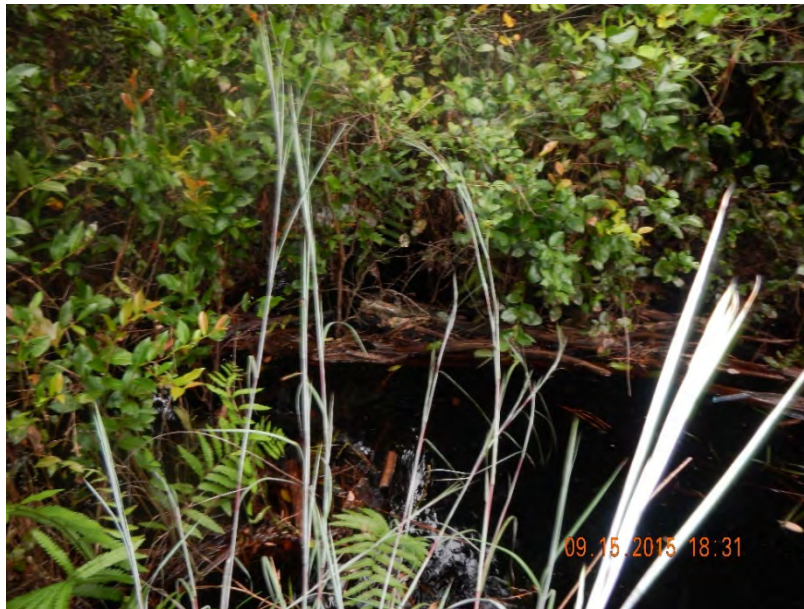
Photo 394. View of Surface Water: Excavated Ditch within Upland within a Transitional: Planted Pine Flatwoods as seen looking north (downstream) from GPS location 7456 Frame 7530 (09/15/15).