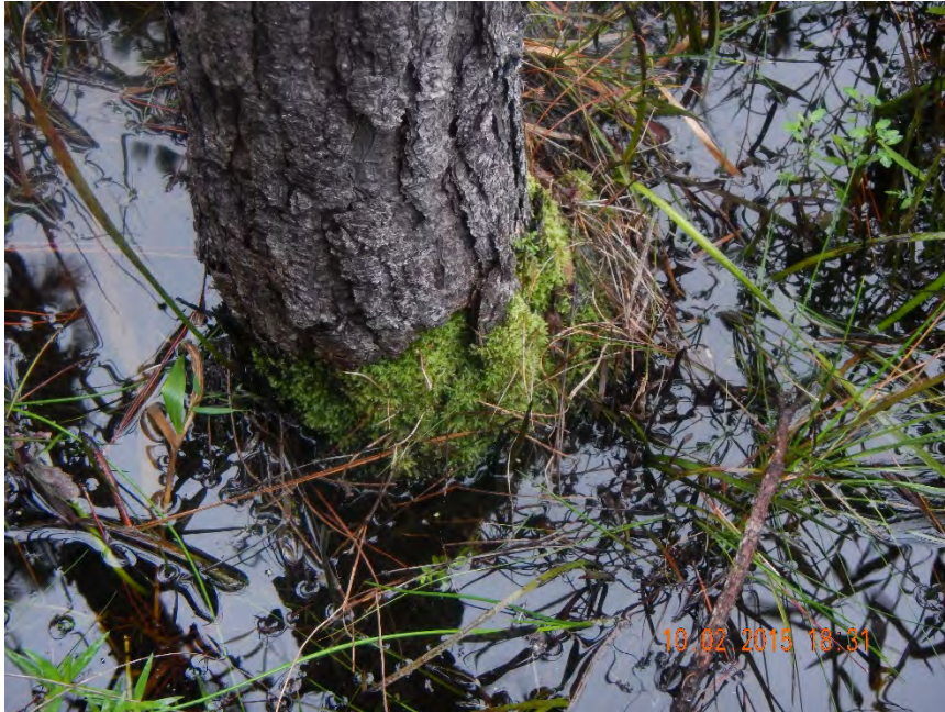
Photo 494. View of moss line on Pinus elliotii at GPS location 8685 (Frame 7718; 10/02/15).