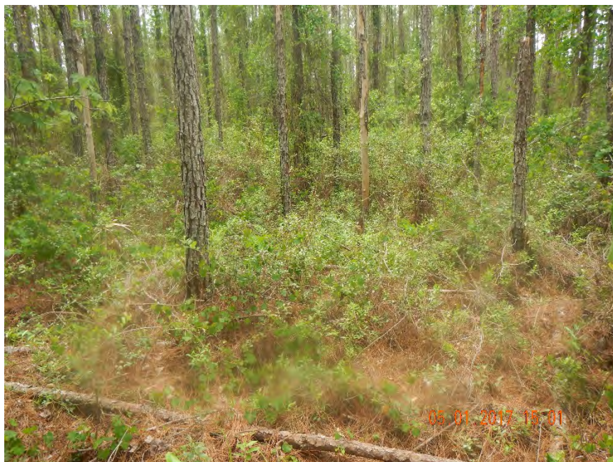
Photo 573. View of Mesic Plant Pine Flatwoods community as seen at GPS location 10741 (Frame 1567; 05/01/17).