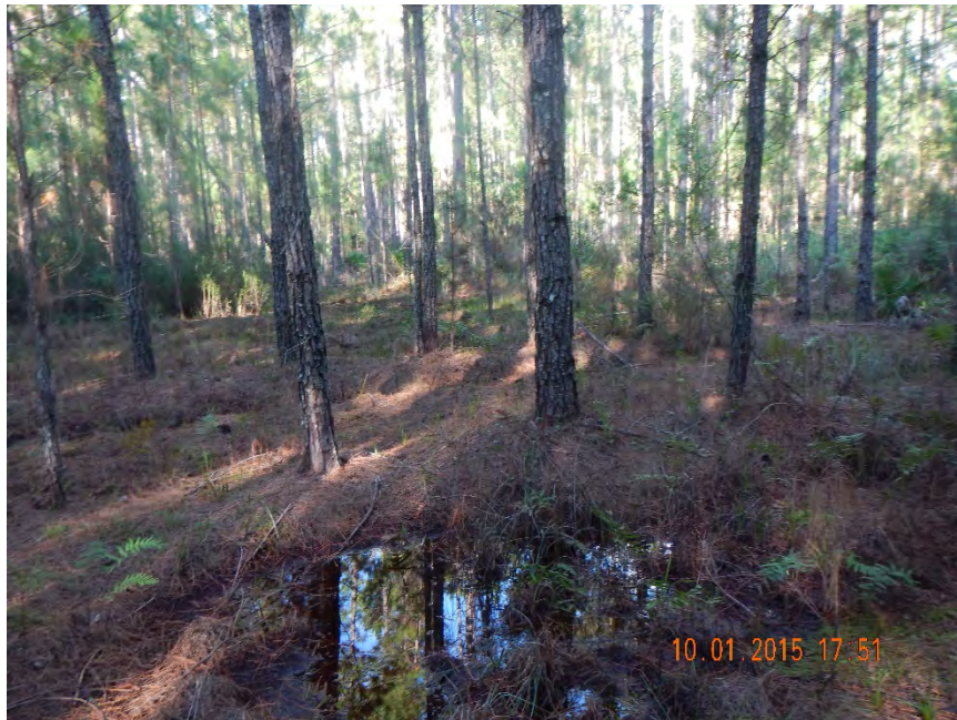
Photo 484. View of Hydric: Planted Pine Flatwoods at GPS location 8456 (Frame 7703; 10/01/15).