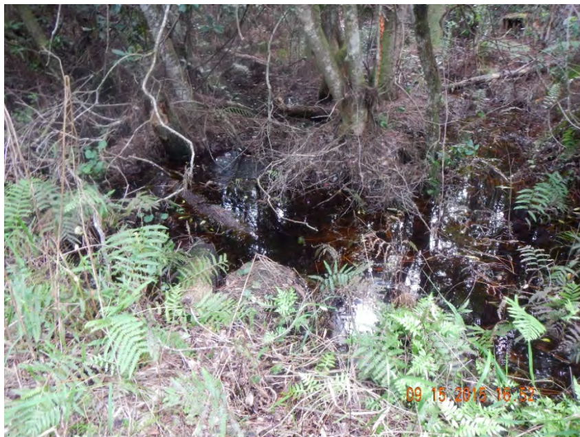
Photo 374. View of Wetland: Cypress-Mixed Hardwoods-Bays from Physical Feature: Culvert as seen looking at west end (upstream) of culvert at GPS location 7360 (Frame 7506; 09/15/15).