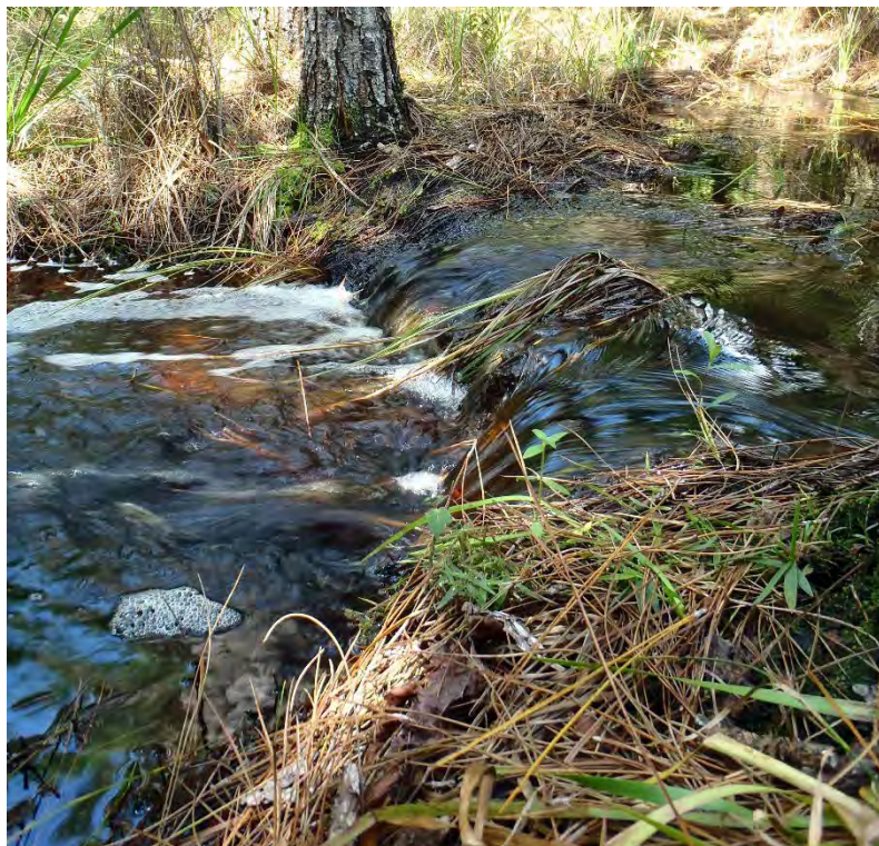
Photo 342. View of Wetland: Natural Flow-way at GPS location 6862 (Frame 2142; 09/11/15).