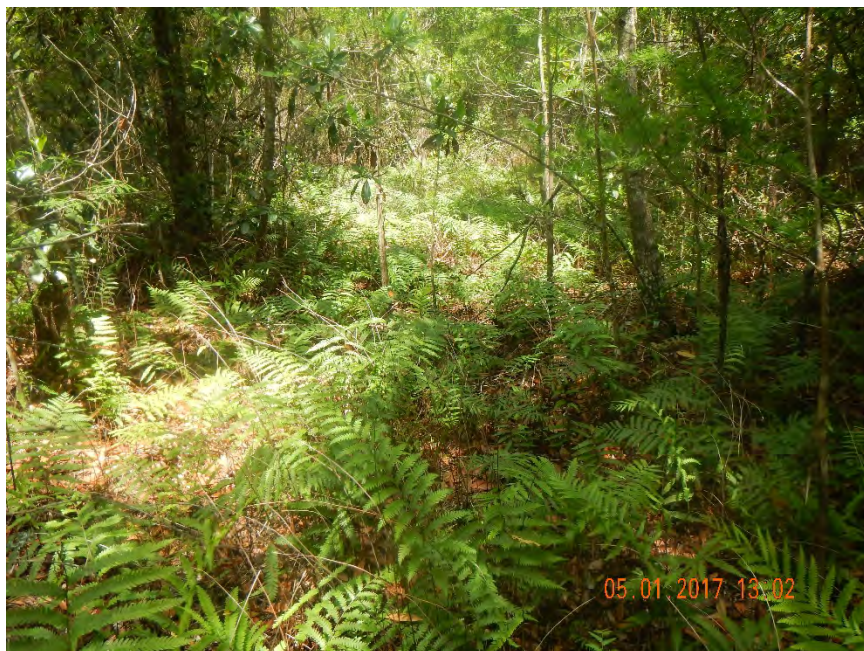
Photo 571. View of Hydric Planted Pine Flatwoods community at GPS location 10699 (Frame 1564; 05/01/17).