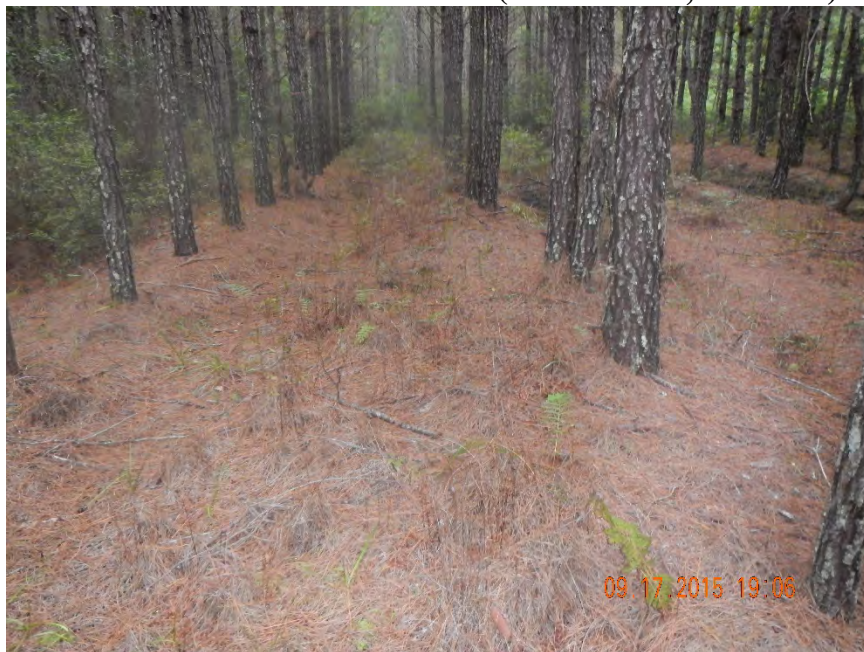
Photo 407. View of Hydric: Planted Pine Flatwoods as seen at GPS location 7663 (Frame 7626; 09/17/15).