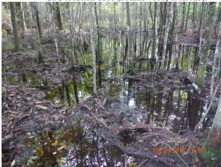
Photo 451. View of Wetland: Natural Flow-way that occurs at GPS locations 8166–8173. View is at GPS location 8168 (Frame 7667; 09/29/15).