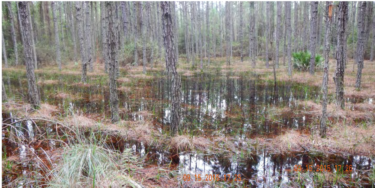
Photo 380. View of Wetland: Planted Pine-Marsh as seen looking west from GPS location 7387 (Frames 7513-7314; 09/15/15).