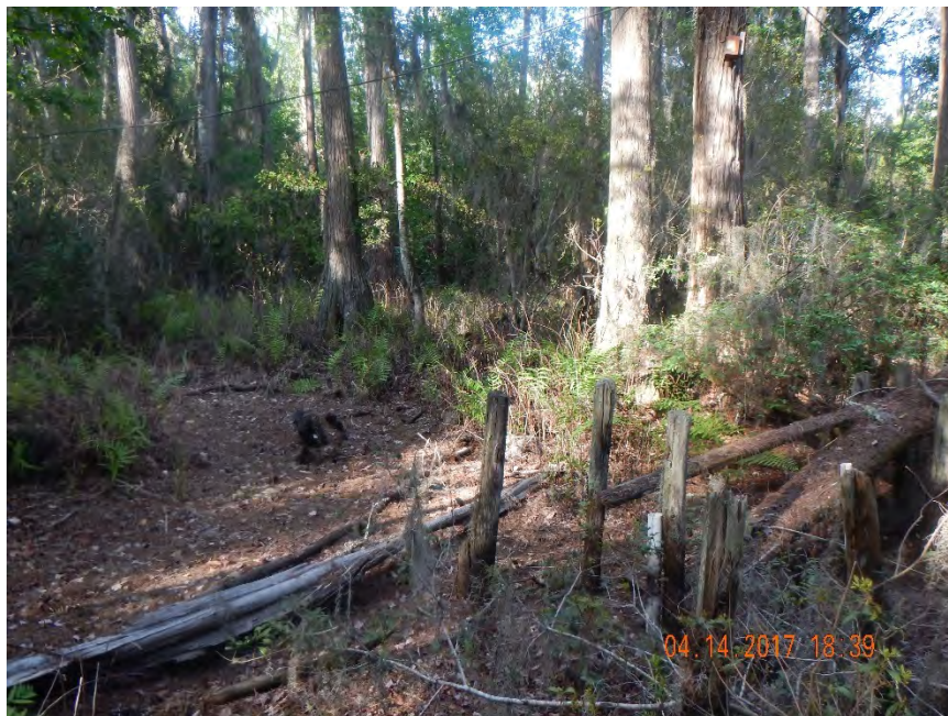
Photo 545. Boardwalk.