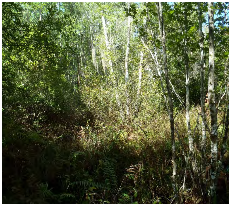
Photo 348. View of Wetland: Cypress-Mixed Hardwoods-Bays as seen looking north from GPS location 6922 (Frames 2151-2152; 09/11/15).