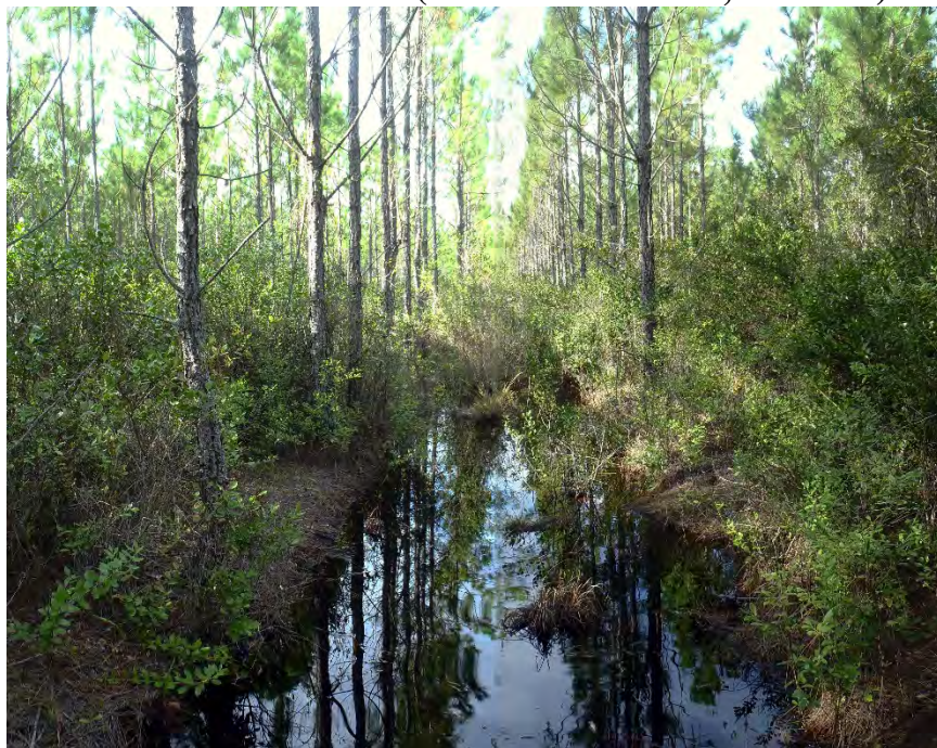
Photo 351. View of Transitional: Planted Pine Flatwoods as seen looking north from GPS location 7007 (Frames 2157-2158; 09/11/15).