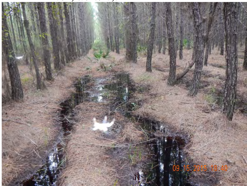
Photo 397. View of Hydric: Planted Pine Flatwoods as seen looking south from GPS location 7470 (Frame 7533; 09/15/15).