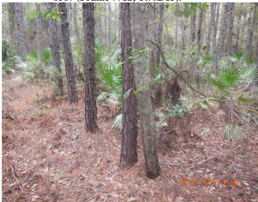
Photo 489. View of Planted Pine-Mesic Pine Flatwoods as seen looking south from GPS location 8587 (Frame 7713; 10/02/15).