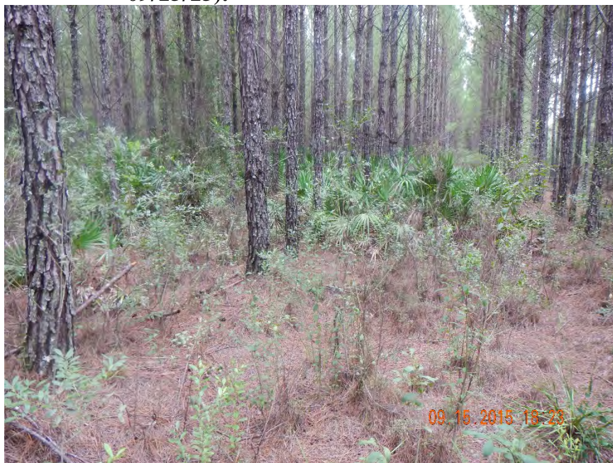
Photo 391. View of upland as seen looking south from Mesic: Planted Pine-Mesic Pine Flatwoods located at GPS location 7441 (Frame 7526; 09/15/15).