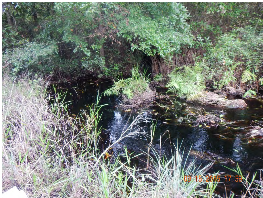
Photo 386. View of flow-way at east end of Physical Feature: Culvert located in gas line right-of-way at GPS location 7421 (Frame 7520; 09/15/15).