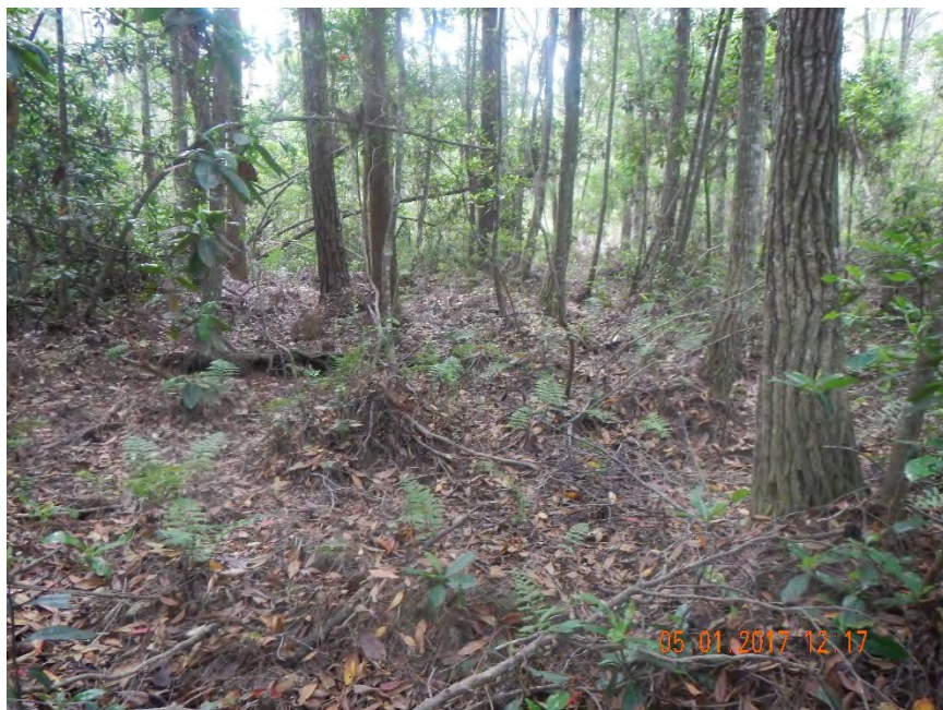
Photo 567. View of Cypress-Mixed Hardwood-Bay Swamp as seen at GPS location 10655 (Frame 1560; 05/01/17).