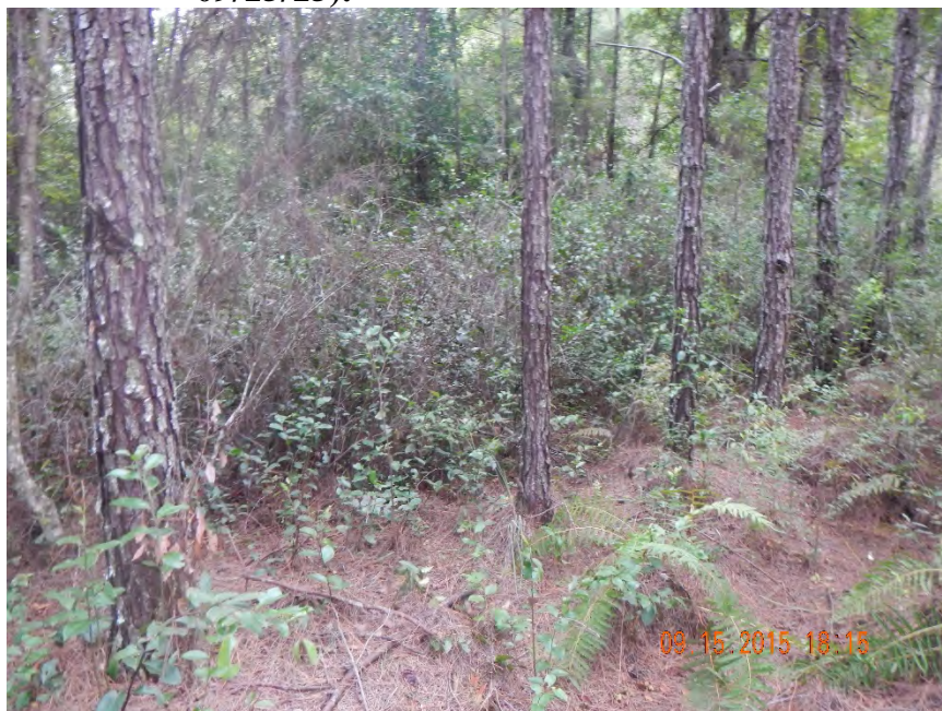
Photo 389. View of Wetland: Planted Pine Flatwoods as seen looking east from the jurisdictional boundary at GPS location 7430 (Frame 7524; 09/15/15).