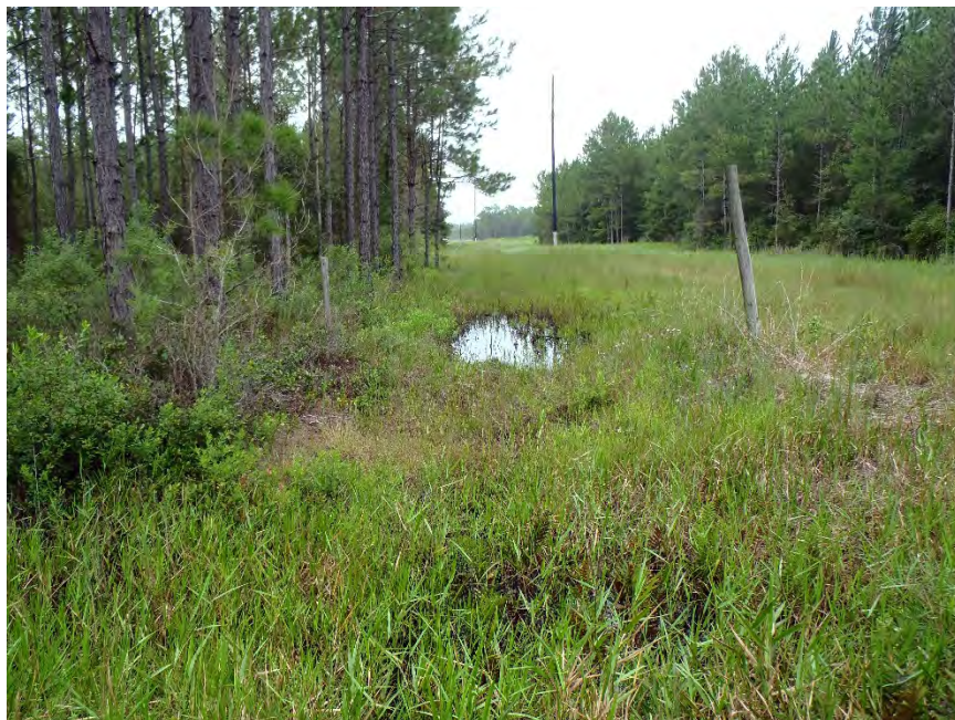
Photo 414. View of wetland marsh on north side of power line access road as seen looking east from culvert at GPS location 7765 (Frame 2181; 09/18/15).