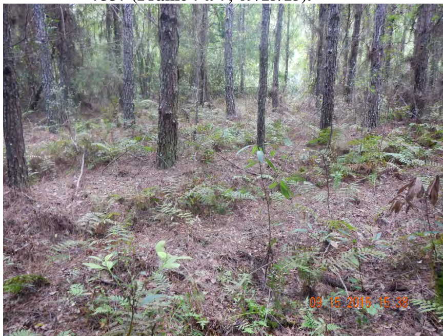
Photo 367. View of Mesic: Planted Pine-Mesic Pine Flatwoods as seen looking northwest from the jurisdiction line located south of GPS location 7338 (Frame 7498; 09/15/15).