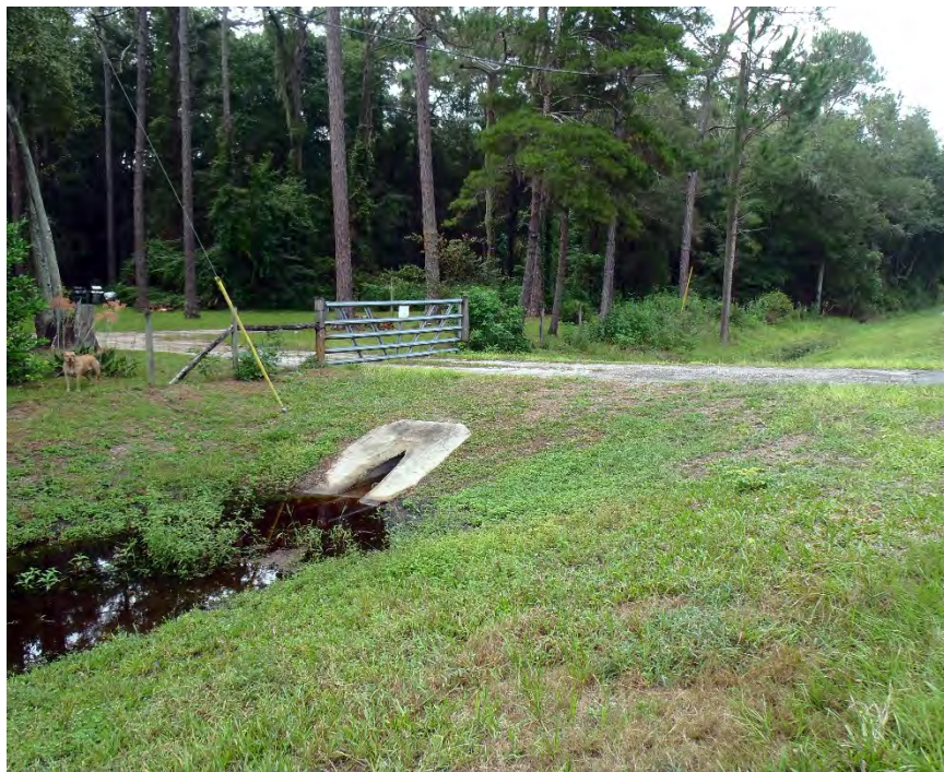
Photo 286. View of Physical Feature: Culvert as seen looking southeast from GPS location 5886 (Frame 2023; 09/04/15).