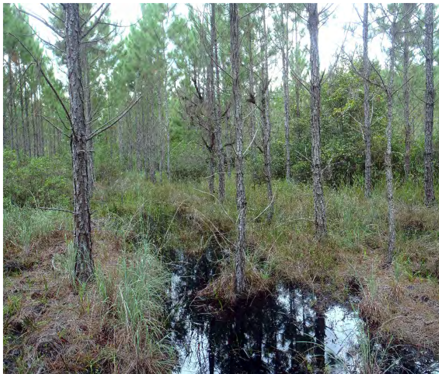
Photo 330. View of Wetland: Planted Pine-Marsh as seen looking southeast from GPS location 6657 (Frames 2116-2117; 09/10/15).