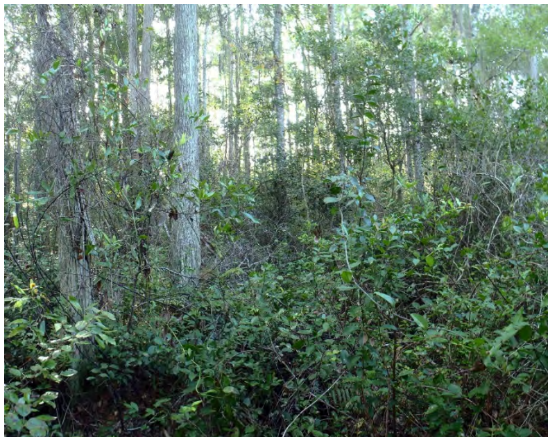
Photo 354. View of Wetland: Cypress-Mixed Hardwoods-Bays as seen looking northwest from GPS location 7034 (Frames 2163-2164; 09/11/15).