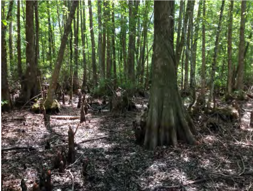
Photo 560. View of Mixed Hardwood Swamp as seen at GPS location 10482 (Frame 605; 04/18/17).