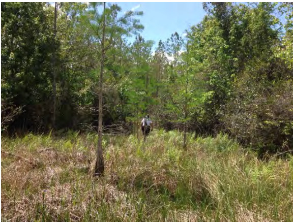
Photo 557. Views of logged Cypress-Mixed Hardwood-Bay Swamp community showing marsh creation within larger skidder tracts and dense shrub understory regeneration in areas where surface was not disturbed (GPS locations 10445–10447; 04/18/17).