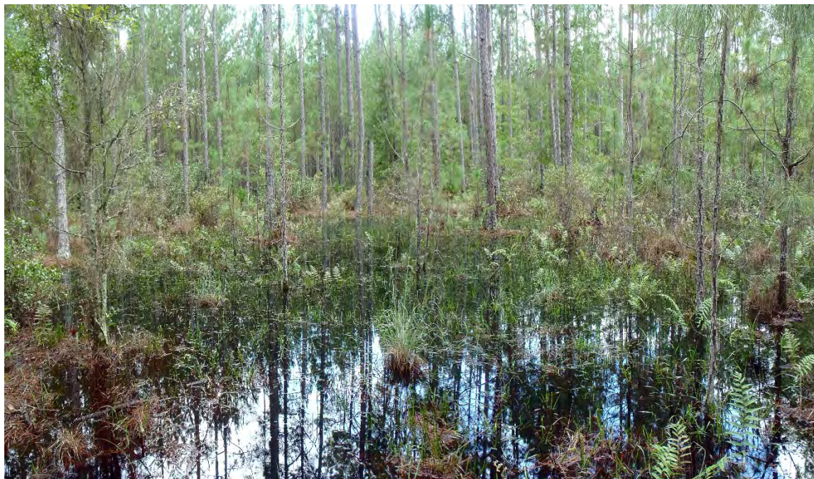
Photo 310. View of Wetlands: Mixed Hardwood Swamp-Bays-Fetterbush as seen looking west from GPS location 6394 (Frames 2080-2081; 09/09/15).