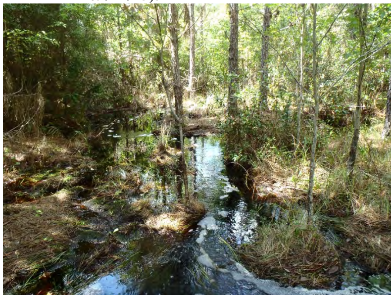
Photo 343. View of Wetland: Natural Flow-way as seen looking downstream (northwest) from GPS location 6862 (Frame 2143; 09/11/15).