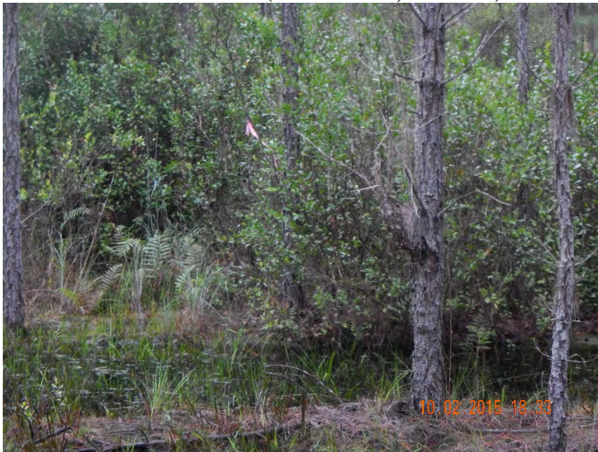
Photo 495. View of Wetland: Planted Pine-Marsh as seen looking north from GPS location 8699 (Frame 7719; 10/02/15).