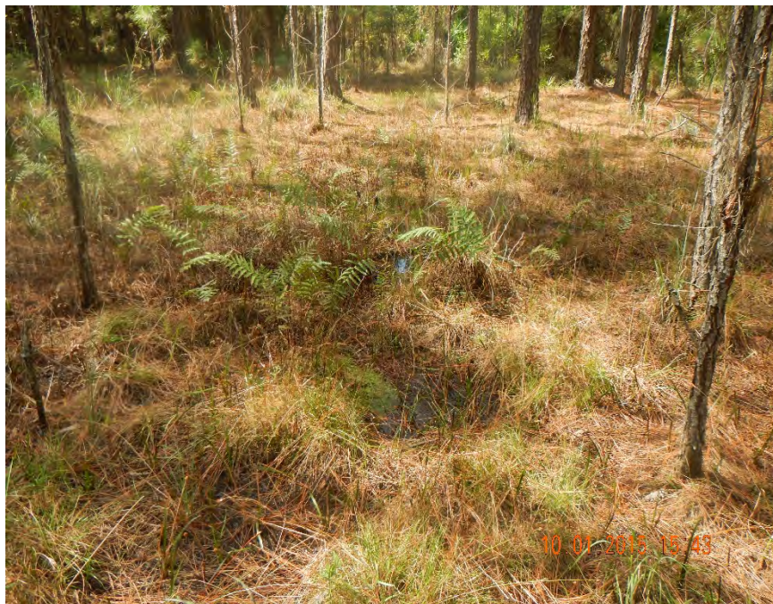
Photo 458. View of Hydric: Planted Pine Flatwoods in area of GPS location 8256 (Frame 7676; 10/01/15).