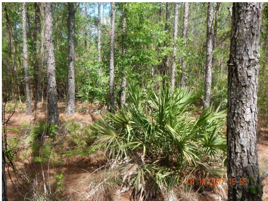
Photo 517. View of boundary of Mesic and Hydric Plant Pine Flatwoods communities as seen at GPS location 10164 (Frame 1422; 04/14/17).