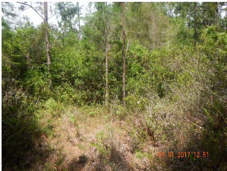
Photo 569. View of logged wetland area showing regeneration of dense shrub cover at GPS location 10699 (Frame 1562; 05/01/17).