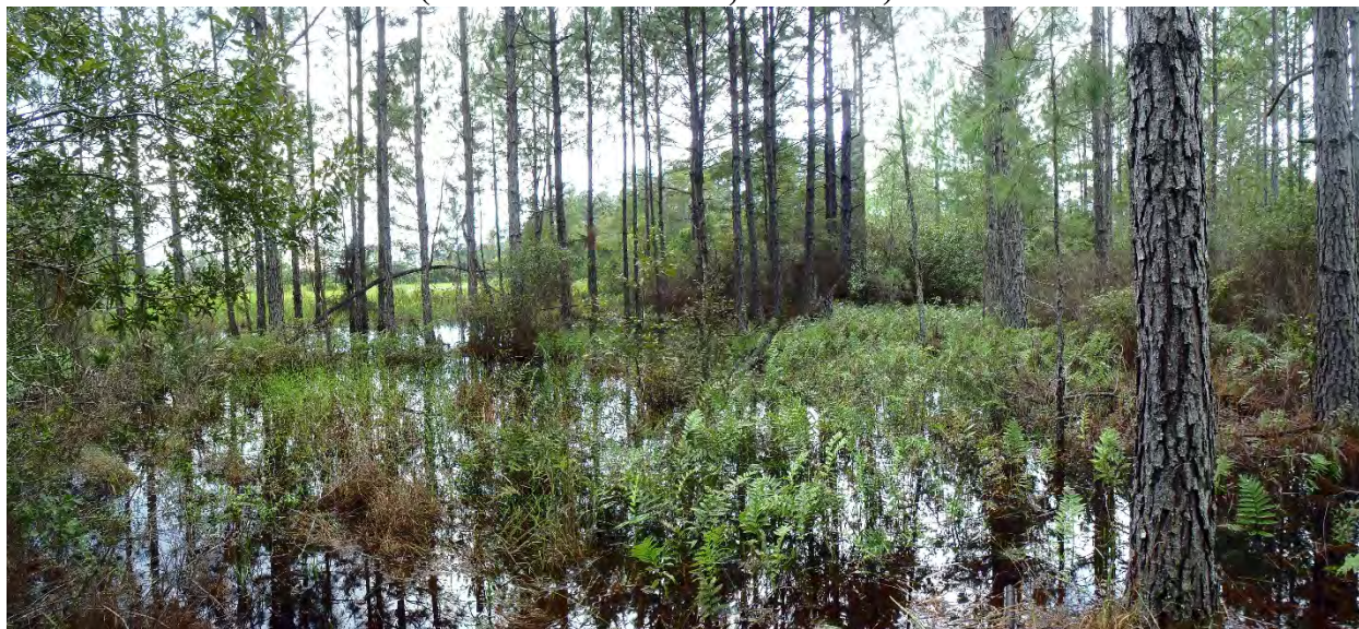
Photo 291. View of Wetland: Planted Pine-Marsh as seen looking south-southwest from GPS location 5964 (Frames 2031-2032; 09/08/15).