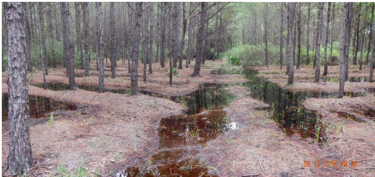
Photo 392. View of Hydric: Planted Pine Flatwoods as seen looking west from GPS location 7449 (Frames 7527-7528; 09/15/15).