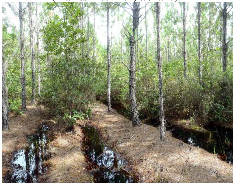
Photo 321. View of Transitional: Planted Pine Flatwoods as seen looking southeast from GPS location 6591 (Frames 2102-2103; 09/10/15).