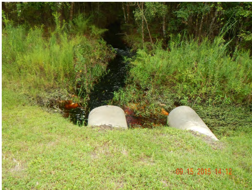
Photo 360. View to south (upstream) of culverts located in Rocky Creek at GPS location 9841 (Frame 7490; 09/15/15).