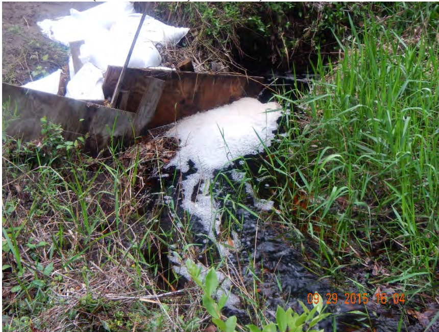
Photo 437. View of flow at Physical Feature: Culvert at GPS location 8099. View is to north on south side of road. Flow has eroded south side of road (Frame 7652; 09/29/15).