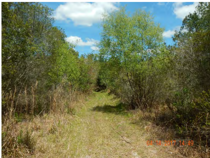
Photo 511. View to north of road through wetland shrubs as seen at GPS location 10120 (Frame 1415; 04/14/17).