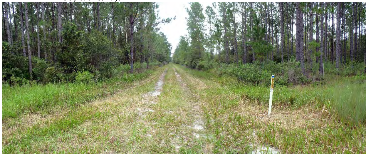
Photo 413. View of gas line easement as seen looking north from culvert located at GPS location 7765 (Frames 2179-2180; 09/18/15).