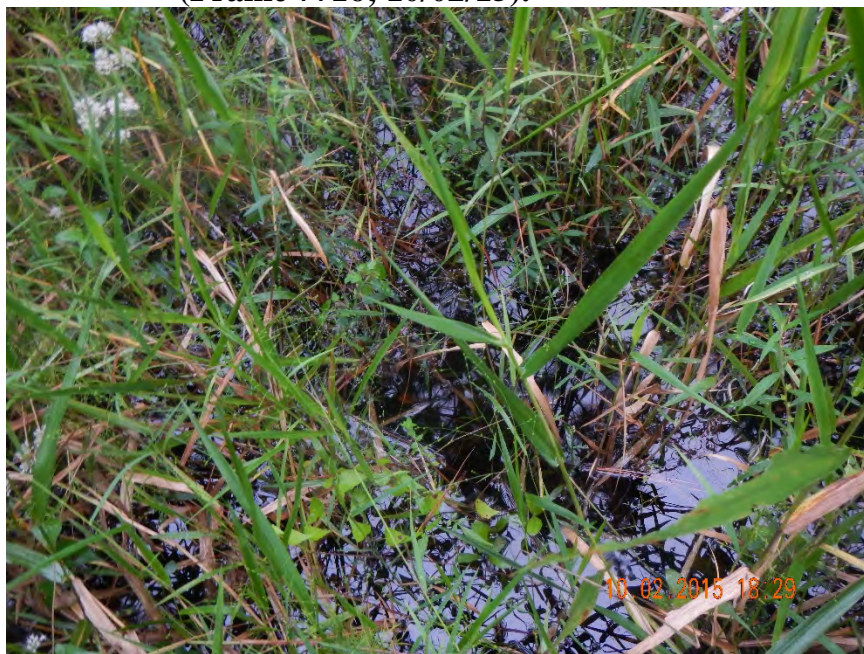
Photo 493. View of dense Panicum hemitomon in groundcover at GPS location 8685 (Frame 7717; 10/02/15).