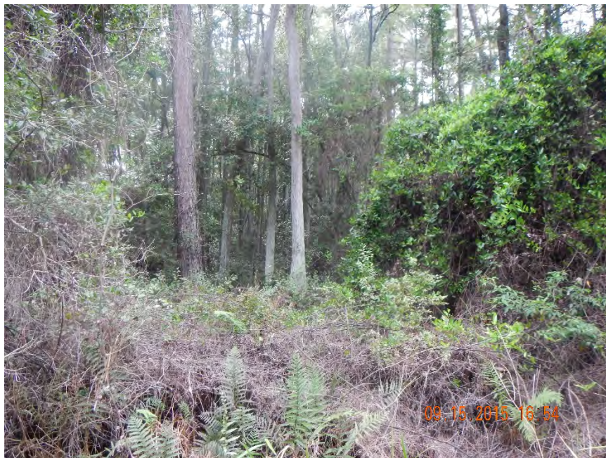
Photo 376. View of cypress, pine, and disturbed vines and shrubs area of the Wetland: Cypress-Mixed Hardwoods-Bays community located west of Physical Feature: Culvert at GPS location 7360 (Frame 7508; 09/15/15).