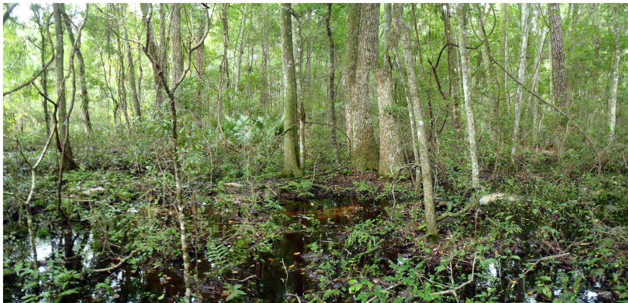
Photo 416. View of natural flow-way area within Wetland: Mixed Hardwood Swamp as seen looking southeast from GPS location 7804 (Frames 2187-2188; 09/18/15).