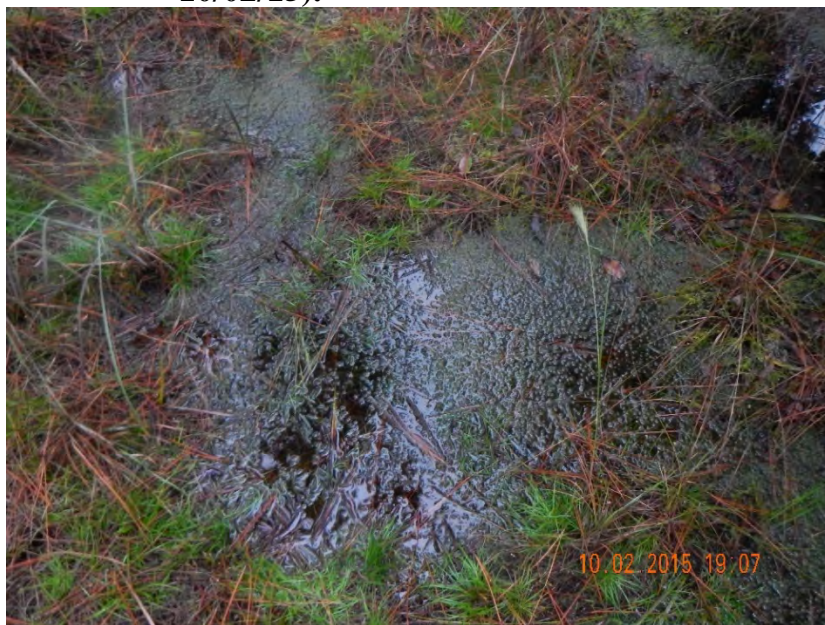
Photo 509. View of typical Hydric: Planted Pine Flatwoods groundcover and surface water as seen at GPS location 8757 (Frame 7735; 10/02/15).