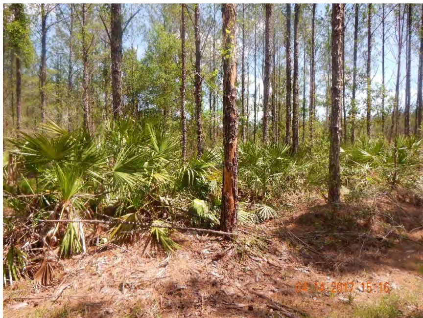
Photo 515. View of Mesic Planted Pine Flatwoods community as seen at GPS location 10139 (04/14/17).