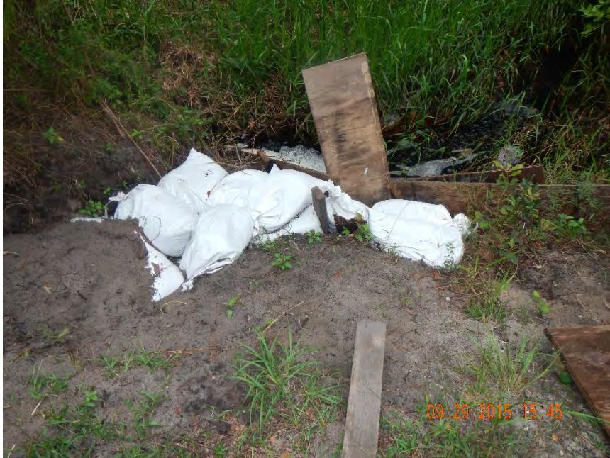
Photo 436. View of eroded Physical Feature: Culvert as seen looking south from GPS location 8099 (Frame 7648; 09/29/15).