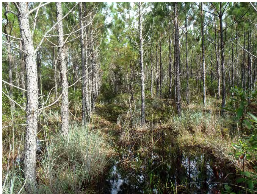
Photo 326. View of Wetland: Planted Pine-Marsh as seen looking east from GPS location 6634 (Frame 2111; 09/10/15).