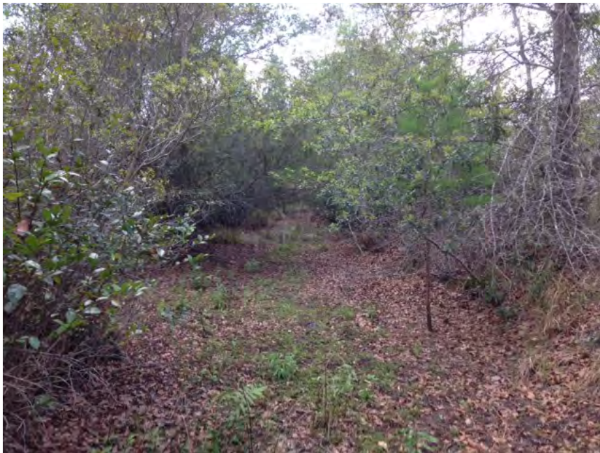
Photo 556. View of excavated ditch located at GPS location 10407 (Frame 593; 04/18/17).