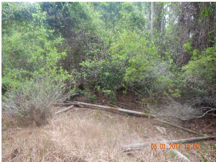
Photo 575. View of logged Cypress and Mixed Hardwood Wetland located at GPS location 10766 (Frame 1569; 05/01/17).