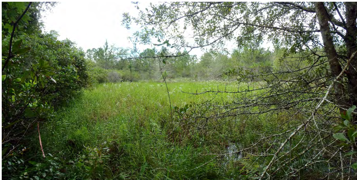
Photo 292. View of Wetland: Planted Pine-Marsh as seen looking northwest from GPS location 5973 (Frames 2037-2038; 09/08/15).