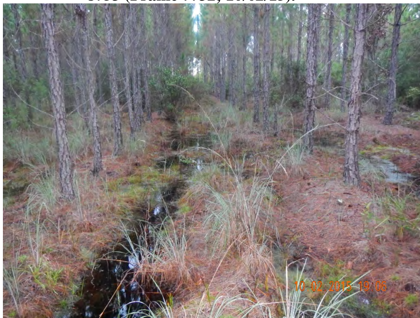
Photo 507. View of Hydric: Planted Pine Flatwoods as seen looking southeast from GPS location 8753 (Frame 7733; 10/02/15).