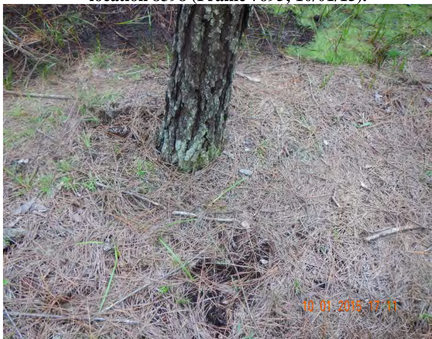
Photo 477. Buttressed slash pine and moss with the Hydric: Planted Pine Flatwoods as seen at GPS location 8398 (Frame 7696; 10/01/15).