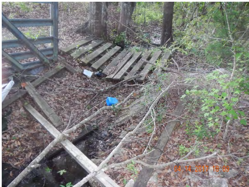
Photo 536. View of collapsed culvert and roadway at offsite drainage divide as seen looking west from GPS location 10304 (Frame 1451; 04/14/17).