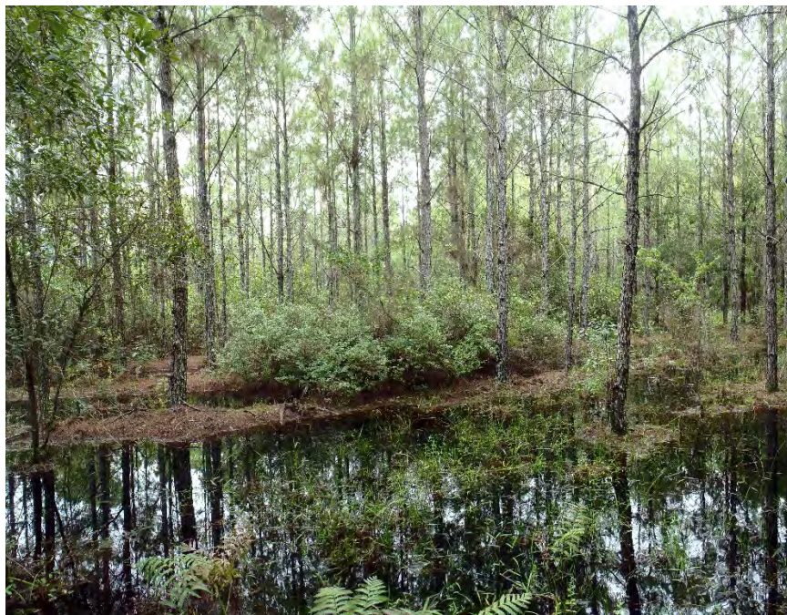
Photo 294. View of Wetland: Planted Pine-Marsh as seen looking southwest from GPS location 6015 (Frames 2045-2046; 09/08/15).