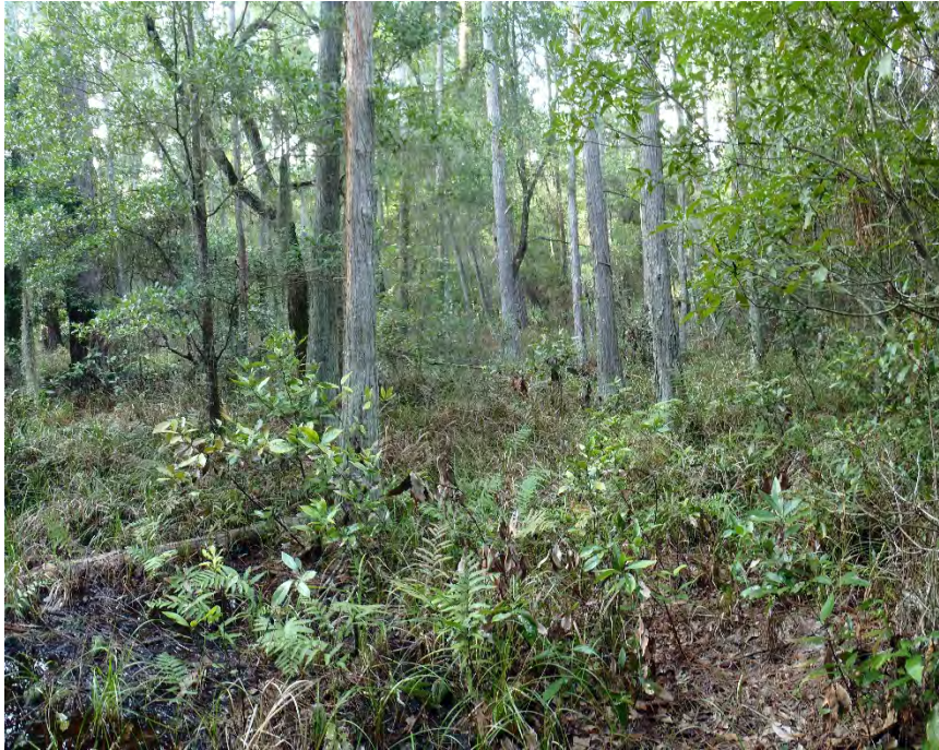
Photo 356. View of Mesic: Planted Pine-Mesic Pine Flatwoods as seen looking northwest from GPS location 7047 (Frames 2167-2168; 09/11/15).