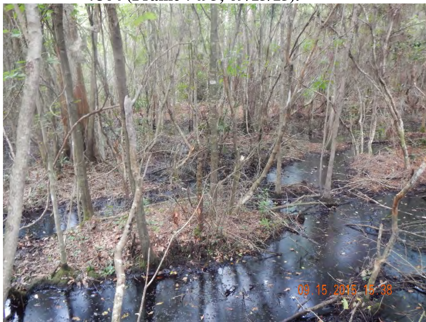
Photo 365. View of Wetland: Mixed Shrubs & Vines as seen looking east from GPS location 7337 (Frame 7496; 09/15/15).