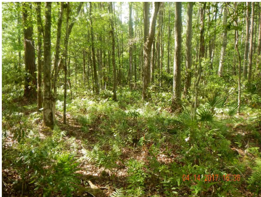
Photo 524. View of Cypress-Mixed Hardwood-Bay Swamp as seen looking east at GPS location 10196 (Frame 1434; 04/14/17).