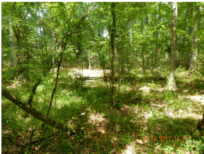
Photo 563. View of ironwood ( Carpinus caroliniana ) dominated Hydric Hammock habitat as seen at GPS location 10490 (Frame 1487; 04/18/17).