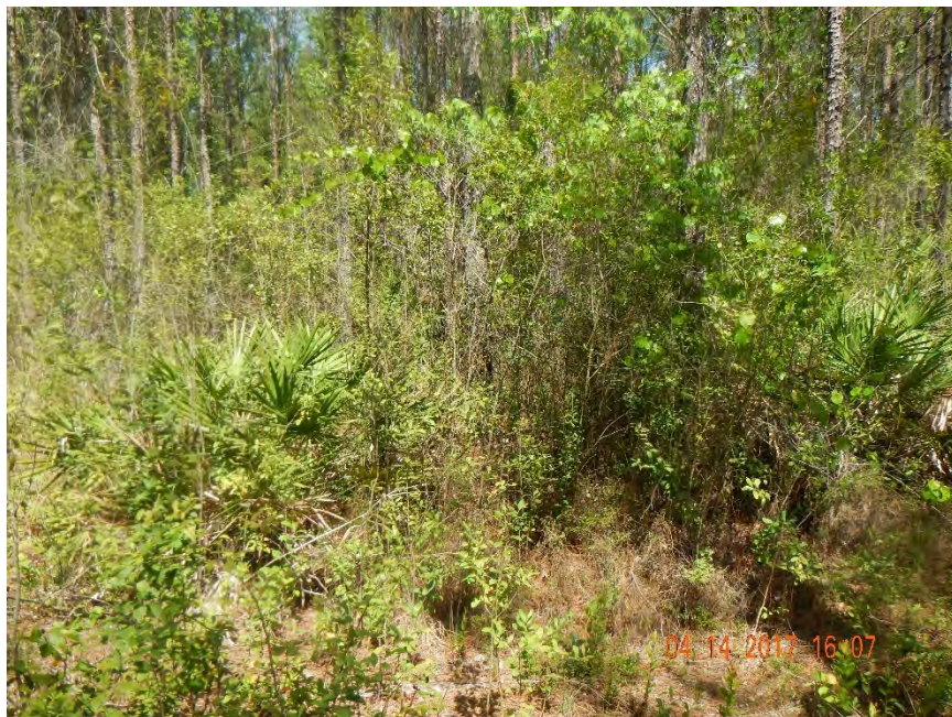
Photo 518. View of Mesic Planted Pine Flatwoods community as seen at GPS location 10169 (Frame 1423; 04/14/17).