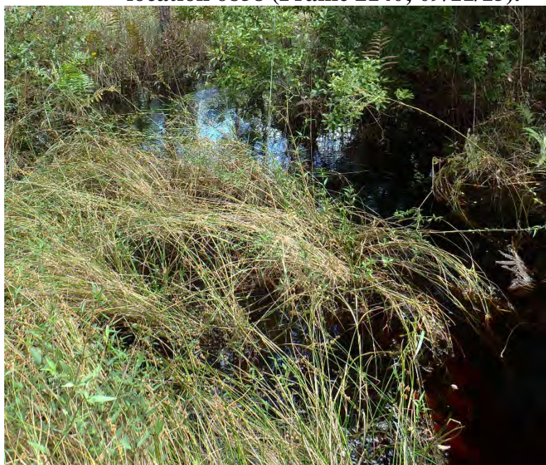
Photo 341. View of Wetland: Natural Flow-way as seen looking southeast from GPS location 6858 (Frame 2141; 09/11/15).