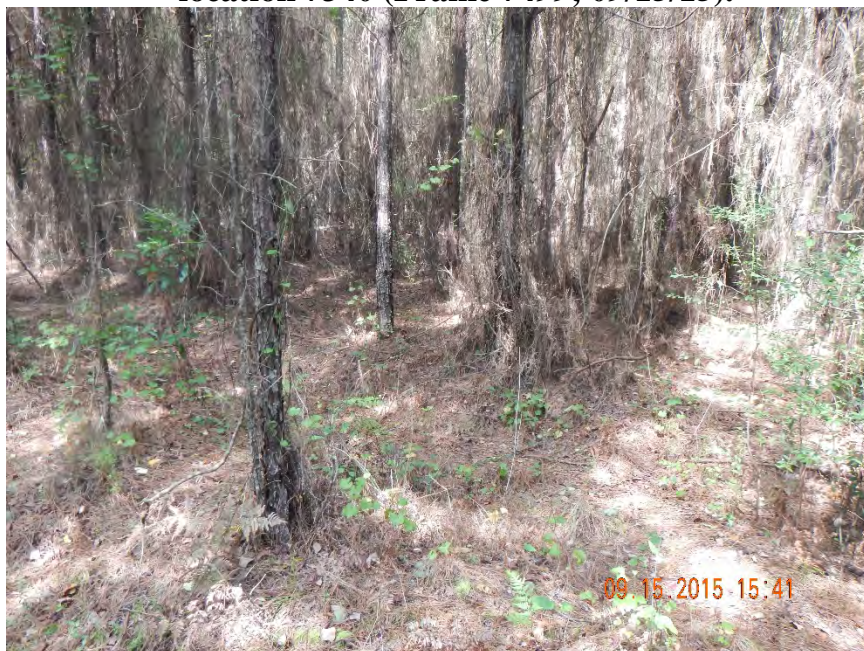
Photo 369. View of Mesic: Planted Pine-Mesic Pine Flatwoods as seen looking northeast from GPS location 7340 (Frame 7500; 09/15/15).