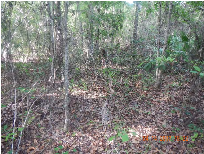
Photo 542. View of oak-dominated Hydric Hammock as seen at GPS location 10327 (Frame 1458; 04/14/17).

Photos 543 through 549 show dilapidated structures remaining in an historical disturbed cypress dome located at GPS location 10356. This dome was a study site for experimental sewage disposal in wetlands that was conducted by the Center for Wetlands at the University of Florida from 1973 to 1979. This wetland is referred to as the sewage dome in Cypress Swamps by K. C. Ewel and H. T. Odum (editors), University of Florida Presses (1984; see page 70). ERC staff visited this wetland in 1980. The wetland was one of three (3) cypress domes in the area used to study the effects of effluent from the Whitney Trailer Park on the wetland systems.