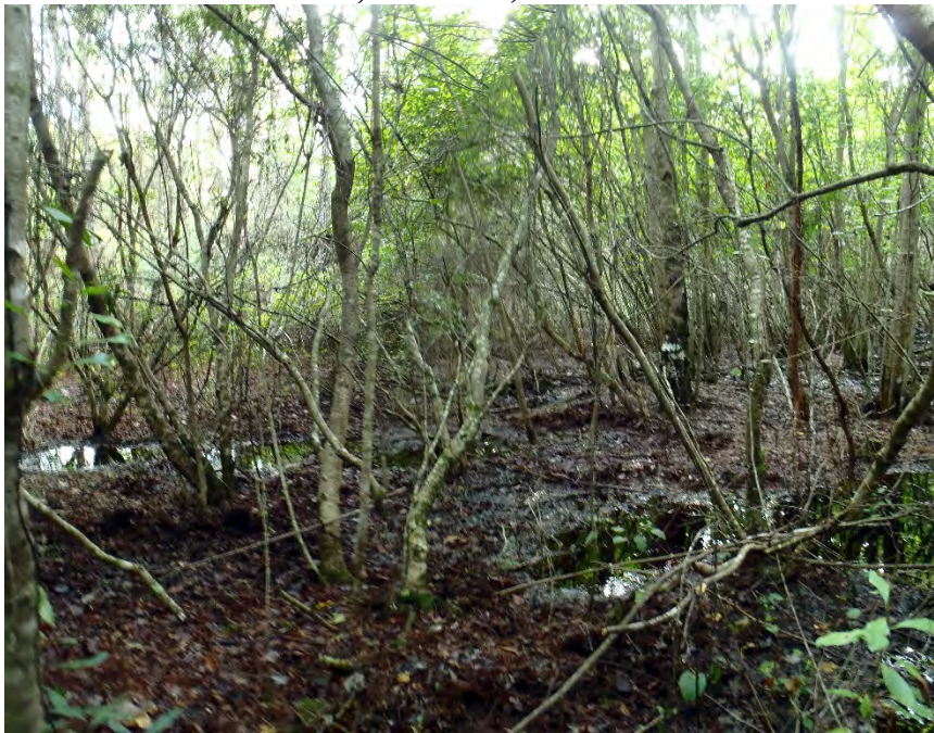
Photo 301. View of Wetland: Natural Flow-way as seen looking west from GPS location 6199 (Frames 2058-2059; 09/08/15).