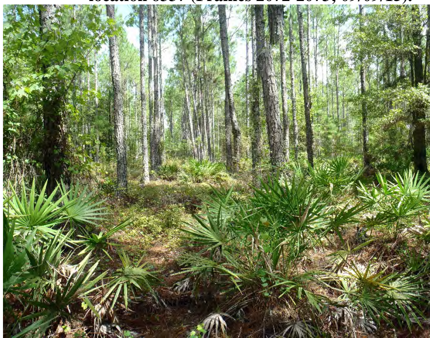
Photo 307. View of Mesic: Planted Pine-Mesic Pine Flatwoods as seen looking north from GPS location 6340 (Frames 2074-2075; 09/09/15).