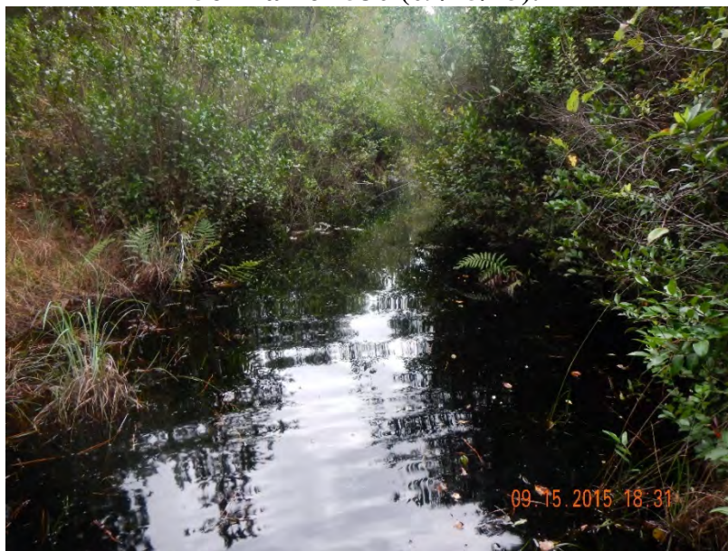
Photo 395. View of Surface Water: Excavated Ditch within Upland within a Transitional: Planted Pine Flatwoods as seen looking south (upstream) from GPS location 7456 (Frame 7531; 09/15/15).