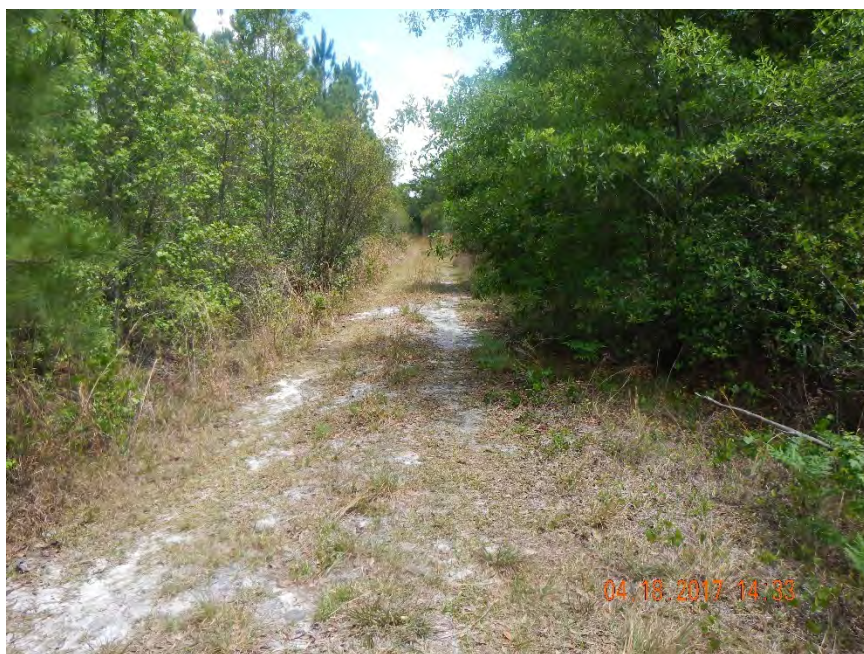
Photo 554. View of forest road located in area of GPS location 7235 (Frame 1489; 04/18/17).