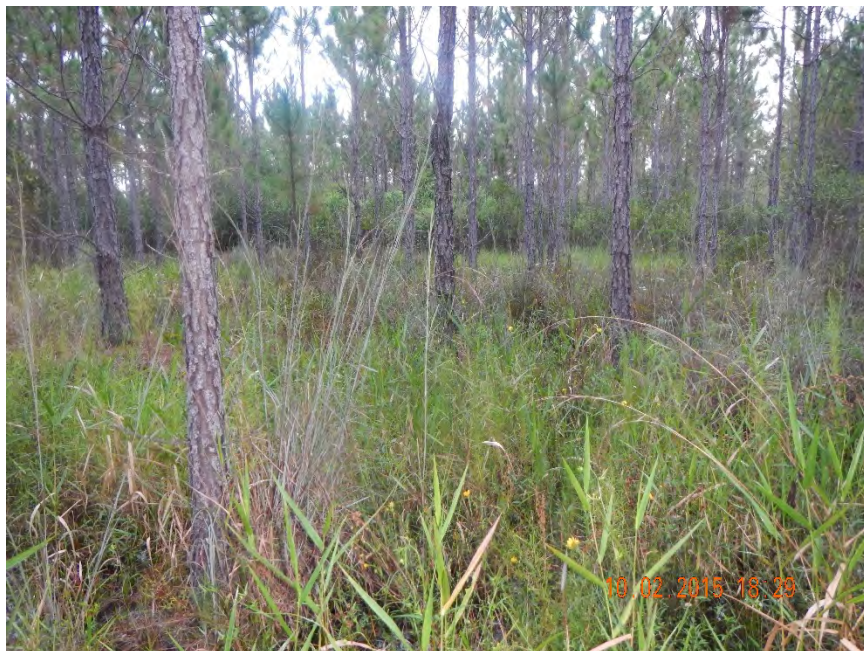
Photo 492. View of Wetland: Planted Pine-Marsh as seen looking northeast from GPS location 8685 (Frame 7716; 10/02/15).