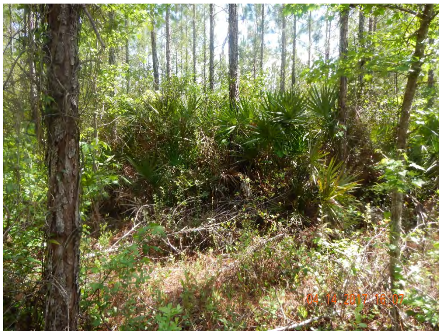
Photo 519. View of Mesic Planted Pine Flatwoods community as seen at GPS location 10169 (Frame 1424; 04/14/17).