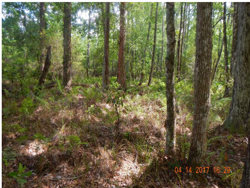
Photo 523. View of unlogged Cypress-Mixed Hardwood-Bay Swamp as seen at GPS location 10191 (Frame 1433; 04/14/17).