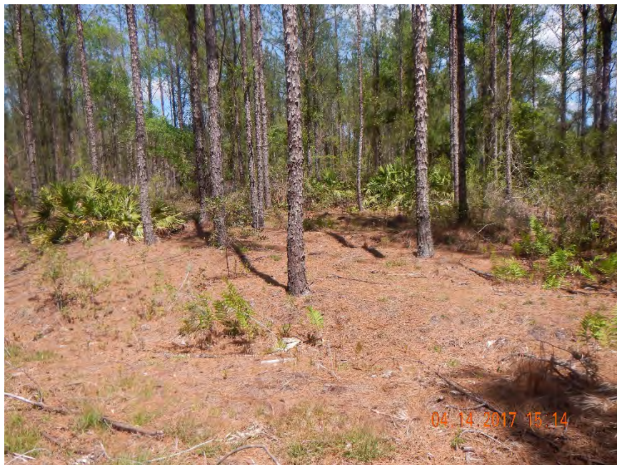
Photo 514. View of Transitional Planted Pine Flatwoods community as seen at GPS location 10136 (Frame 1419; 04/14/17).