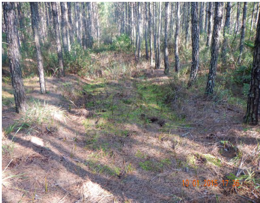
Photo 482. View of Hydric: Planted Pine Flatwoods as seen looking northwest from GPS location 8440 (Frame 7701; 10/01/15).