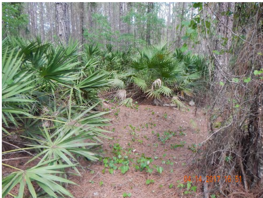
Photo 529. View of Mesic Planted Pine Flatwoods community as seen at GPS location 10220 (Frame 1440; 04/14/17).