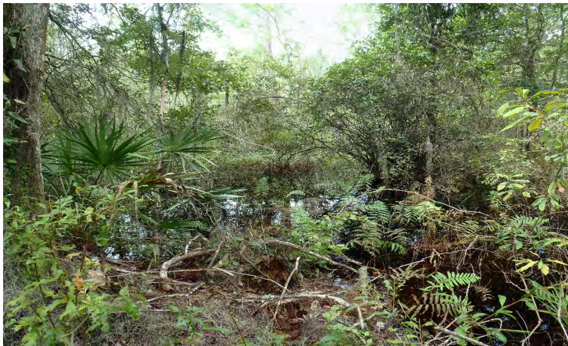
Photo 308. View of Wetland: Cypress-Mixed Hardwoods-Bays as seen looking west from GPS location 6354 (Frames 2076-2077; 09/09/15).