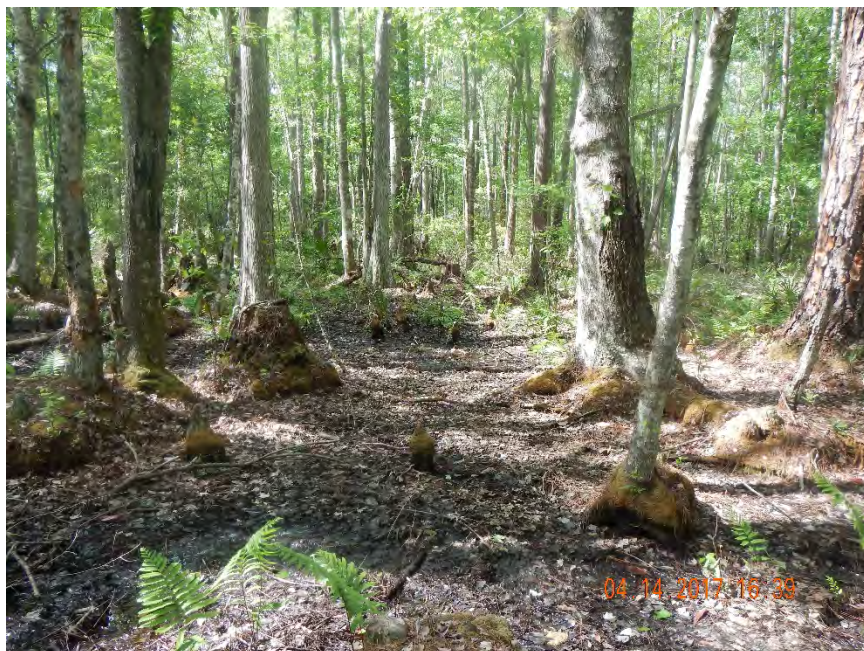
Photo 525. View of Cypress-Blackgum Swamp as seen looking northwest from GPS location 10196 (Frame 1435; 04/14/17).