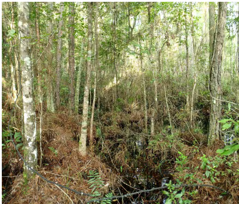
Photo 432. View of Wetland: Cypress-Mixed Hardwoods-Bays as seen looking east from GPS location 8037 (Frames 2215-2216; 09/18/15).