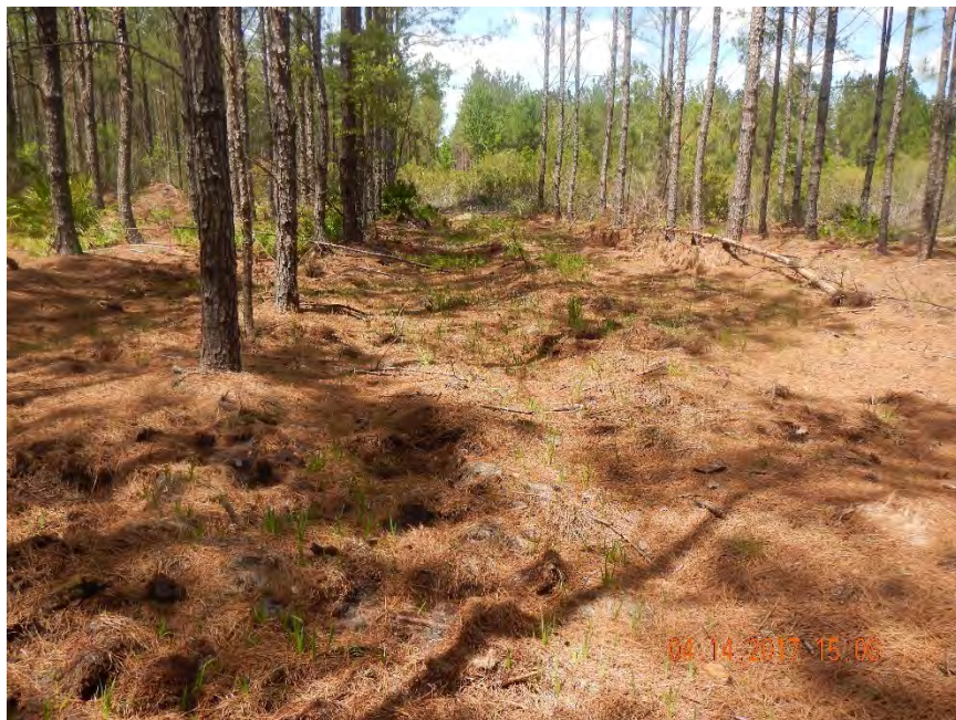
Photo 512. View of Hydric Planted Pine-Flatwoods community as seen at GPS location 10127 (Frame 1417; 04/14/17).