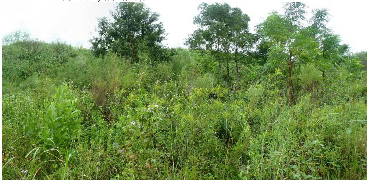
Photo 421. View of Upland: Oldfield as seen looking east from GPS location 7861 (Frames 2195-2196; 09/18/15).