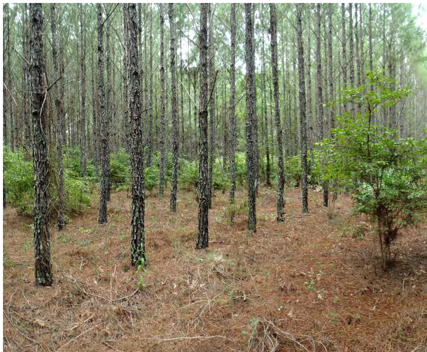
Photo 284. View of Mesic: Planted Pine-Mesic Pine Flatwoods as seen looking southeast from GPS location 5877 (Frames 2020-2021; 09/04/15).