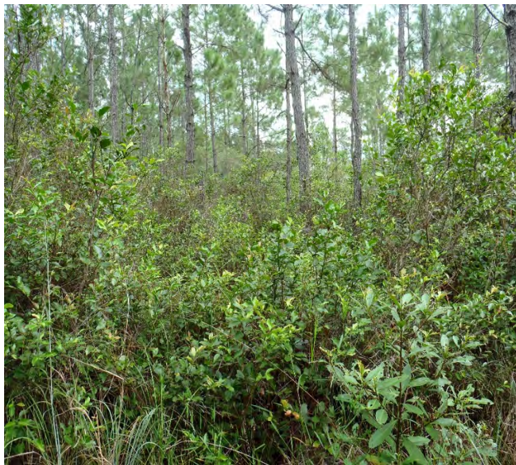
Photo 314. View of Wetland: Planted Pine-Mixed Hardwoods as seen looking east from GPS location 6545 (Frames 2088-2089; 09/09/15).