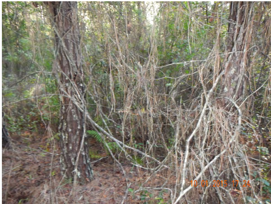
Photo 480. Dense dead and live Lyonia lucida occurring at GPS location 8416 (Frame 7699; 10/01/15).