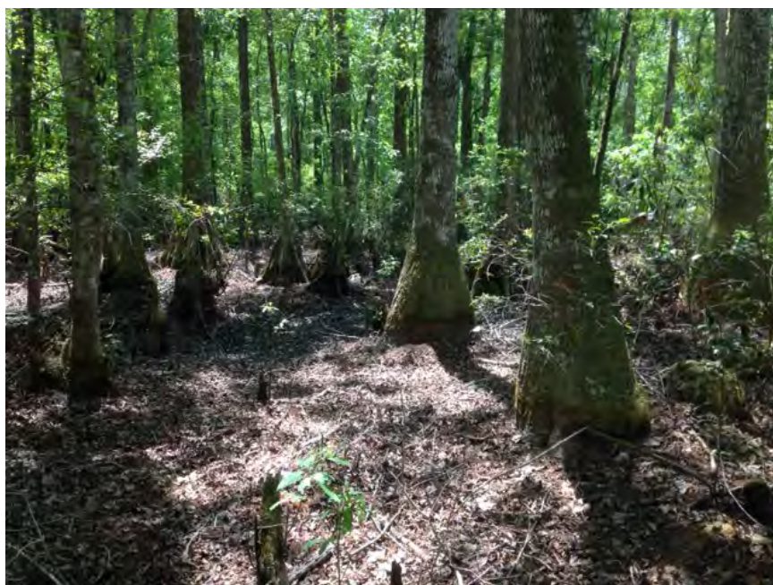
Photo 559. View of Mixed Hardwood Swamp as seen at GPS location 10482 (Frame 604; 04/18/17).