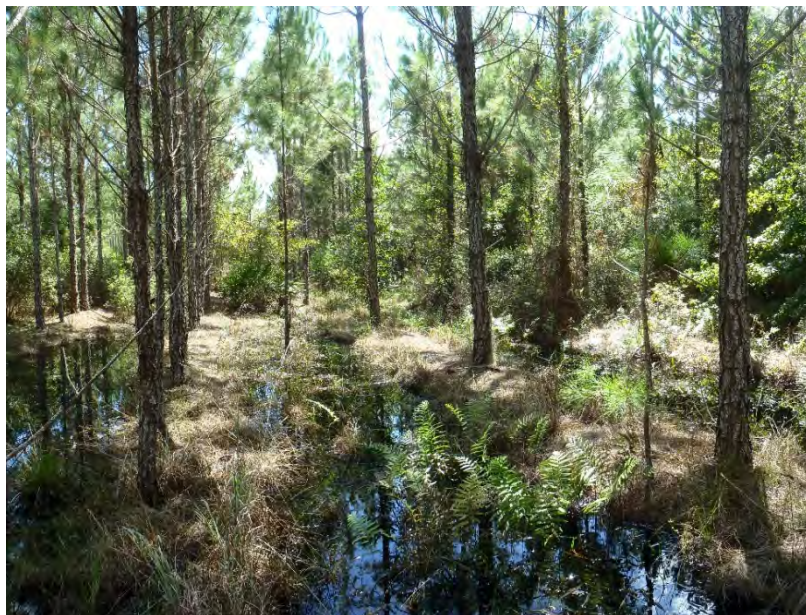
Photo 338. View of Wetland: Planted Pine-Marsh as seen looking south from GPS location 6809 (Frames 2136-2137; 09/11/15).