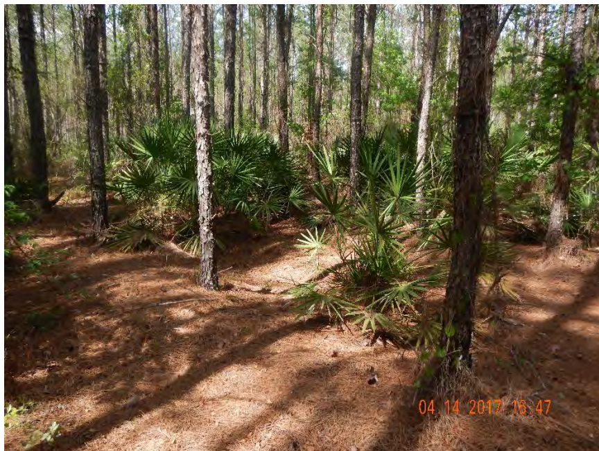
Photo 528. View of Mesic Planted Pine Flatwoods community as seen at GPS location 10212 (Frame 1438; 04/14/17).