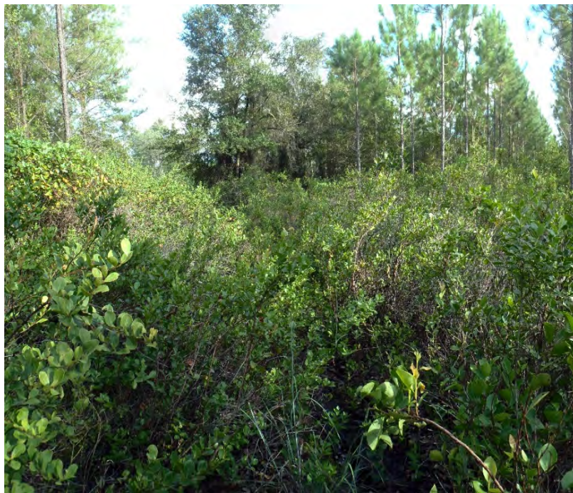
Photo 352. View of Mesic: Planted Pine-Mesic Pine Flatwoods as seen looking southeast from GPS location 7013 (Frames 2159-2160; 09/11/15).