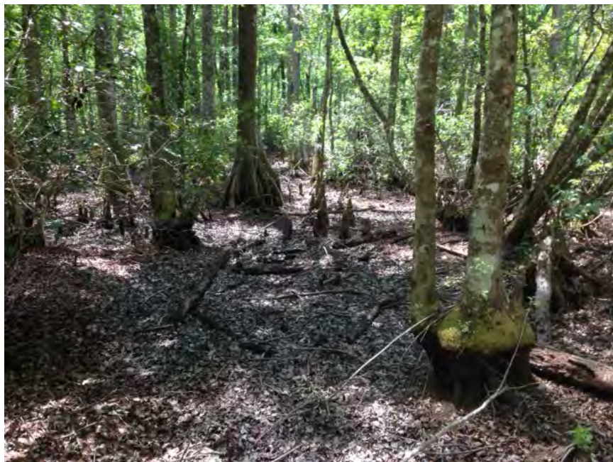
Photo 558. View of Mixed Hardwood Swamp as seen at GPS location 10482 (Frame 603; 04/18/17).