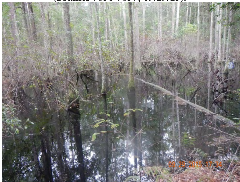
Photo 445. View of buttonbush dominated area of Wetland: Cypress-Mixed Hardwoods-Bays as seen looking northeast from GPS location 8138. This area is excavated (Frame 7658; 09/29/15).