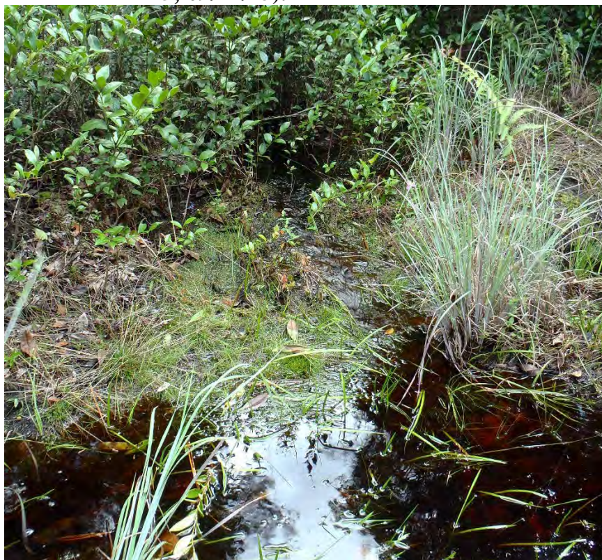
Photo 345. View of Wetland: Natural Flow-way as seen at GPS location 6893 (Frame 2146; 09/11/15).