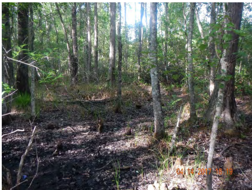
Photo 541. View to northwest of Hydric Hammock community as seen from south end of ditch at GPS location 10322 (Frame 1457; 04/17/17).