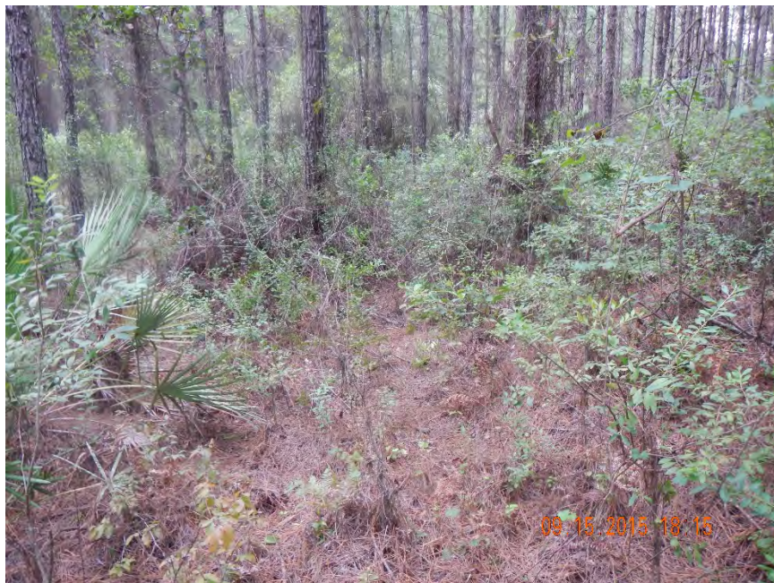
Photo 390. View of Hydric: Planted Pine Flatwoods as seen looking west from the jurisdictional boundary at GPS location 7430 (Frame 7525; 09/15/15).