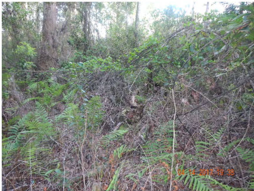
Photo 551. View of very disturbed historical cypress habitat with minimal pine and cypress canopy and very dense shrubs and briers as seen at GPS location 10396 (Frame 1467; 04/14/17).