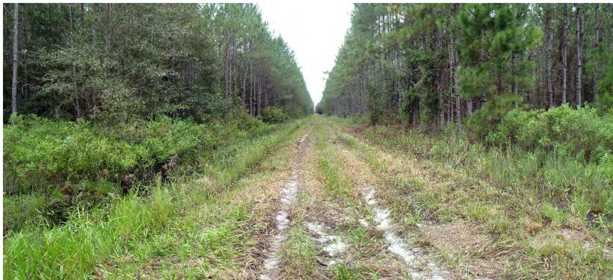
Photo 410. View of flow-way across top of gas line access road as seen looking south from GPS location 7756. Flow-way extends from GPS location 7756 south to 7757, a distance of 325 ft (Frames 2183-2184; 09/18/15).