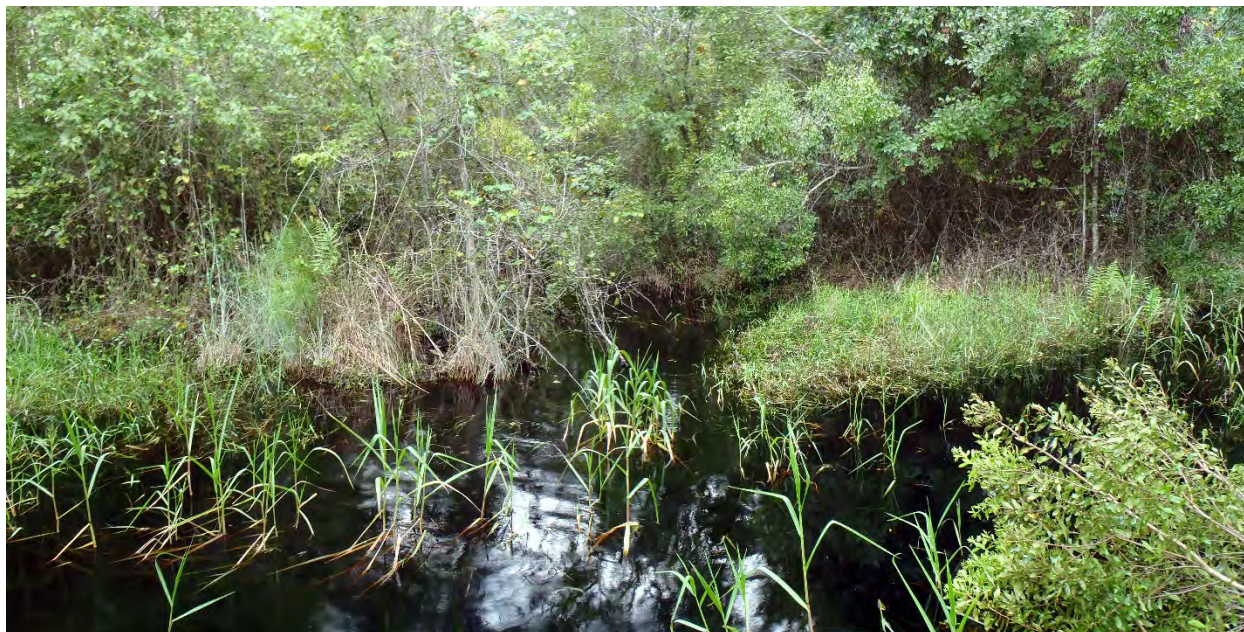
Photo 424. View of Wetland: Natural Flow-way as seen looking southwest from GPS location 7945 (Frames 2201-2202; 09/18/15).