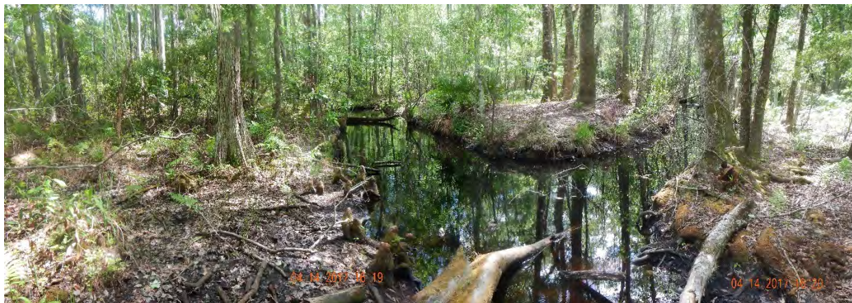
Photo 520. Panoramic view of excavated ditch within the unlogged Cypress-Mixed Hardwood-Bay Swamp as seen looking south to southwest at GPS location 10183 (Frames 1425–1427; 04/14/17).