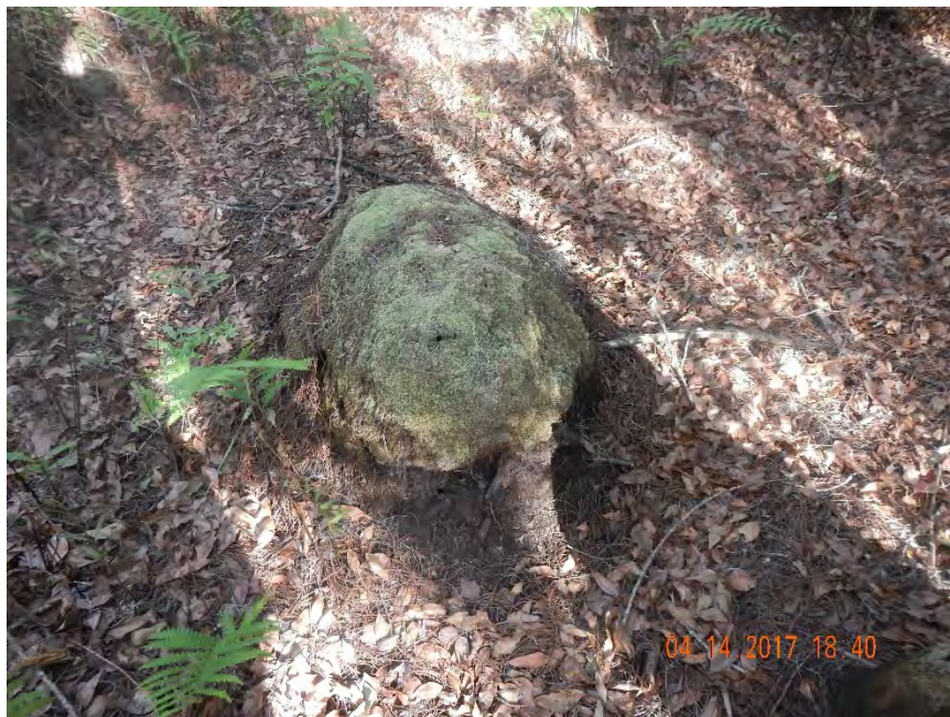
Photo 547. Moss lines in wetland.