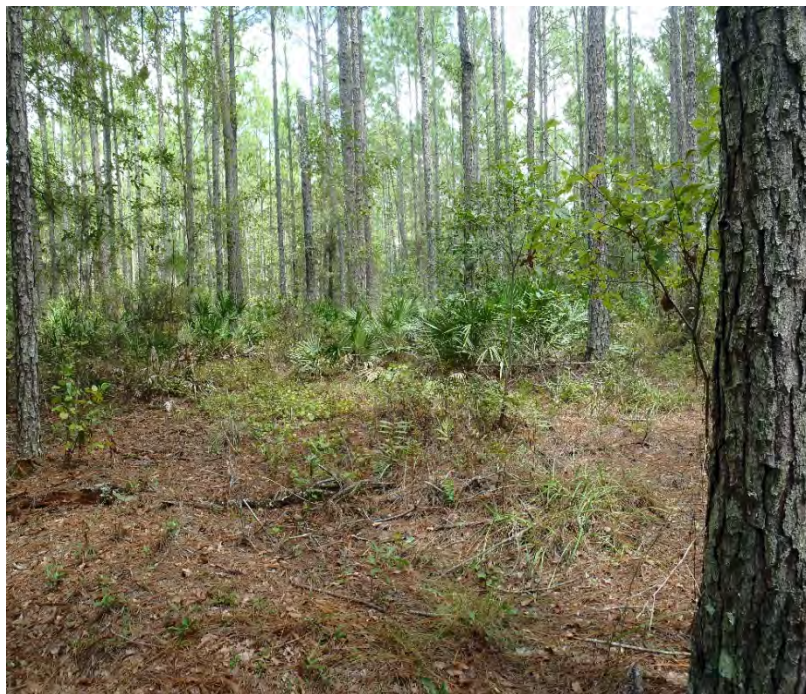
Photo 316. View of Mesic: Planted Pine-Mesic Pine Flatwoods as seen looking east from GPS location 6553 (Frames 2092-2093; 09/09/15).