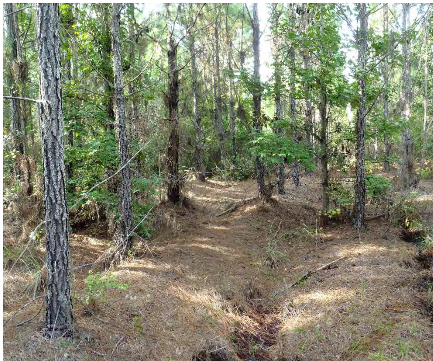
Photo 350. View of Wetland Boundary: Mixed Shrubs & Vines as seen looking northwest from GPS location 6991 (Frames 2155-2156; 09/11/15).