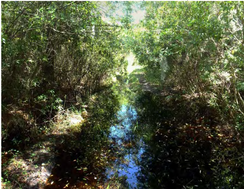
Photo 335. View of Wetland: Natural Flow-way that occurs across the top of the improved forest road as seen looking east from GPS location 6786 (Frames 2130-2131; 09/11/15).