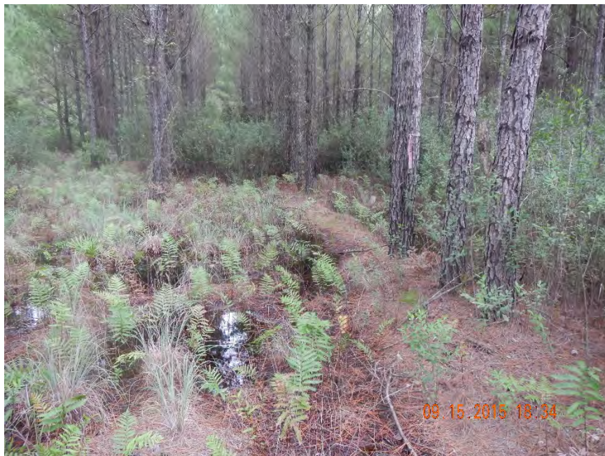
Photo 396. View of boundary between wet flatwoods and transitional flatwoods within the Hydric: Planted Pine Flatwoods community as seen looking east from GPS location 7459 (Frame 7532; 09/15/15).