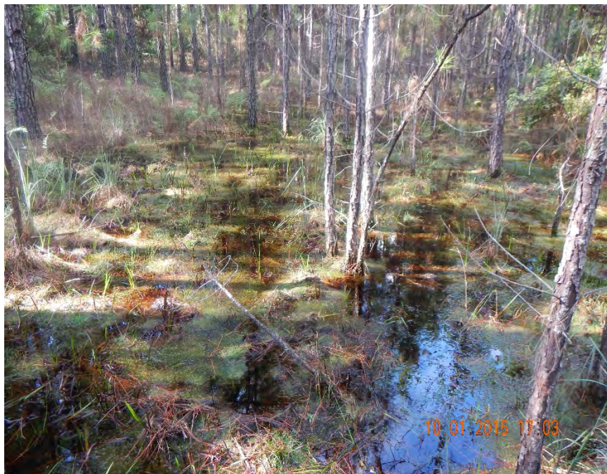
Photo 474. View of Wetland: Planted Pine-Marsh as seen looking northeast from GPS location 8364 (Frame 7693; 10/01/15).