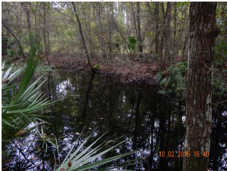
Photo 487. View of excavated pond occurring at GPS location 8574 (Frame 7710; 10/02/15).