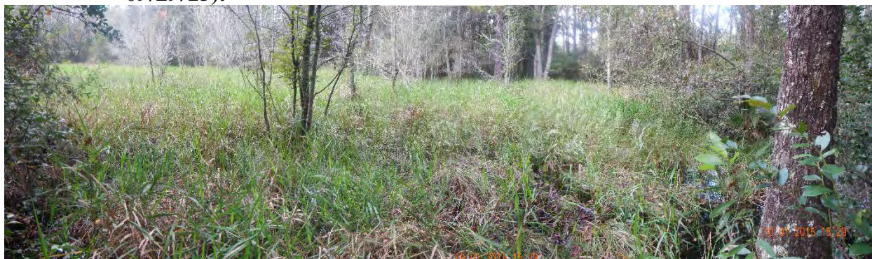
Photo 455. View of Wetland: Marsh dominated by Panicum hemitomon as seen looking west from GPS location 8242 (Frames 7671-7673; 10/01/15).