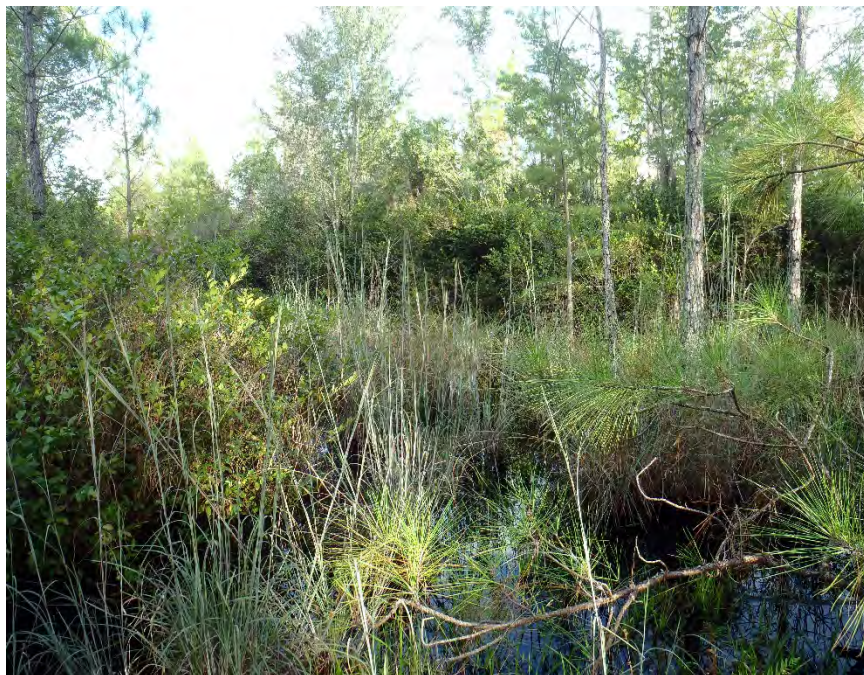
Photo 302. View of Wetland: Planted Pine-Marsh as seen looking southeast from GPS location 6221 (Frames 2060-2061; 09/18/15).