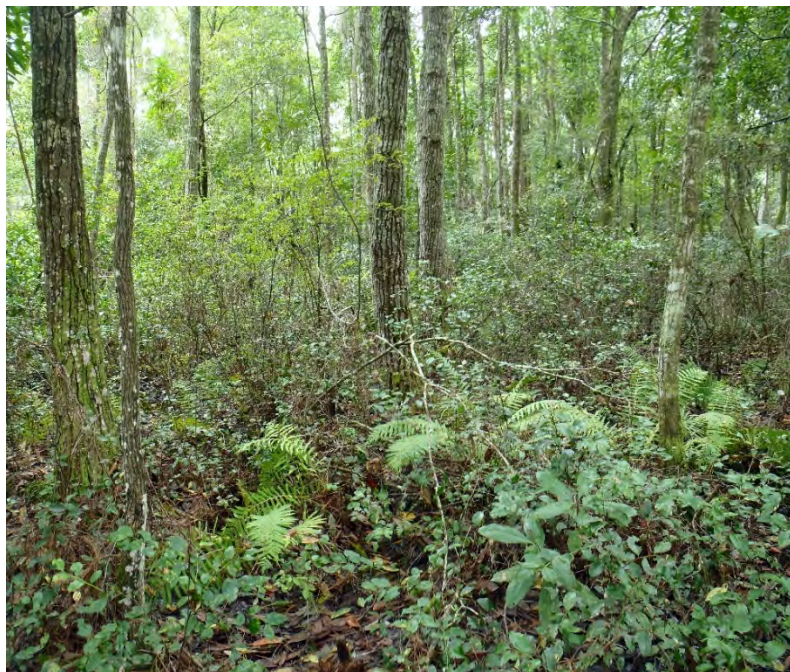
Photo 428. View of Hydric: Planted Pine Flatwoods as seen looking south from GPS location 7960 (Frames 2209-2210; 09/18/15).