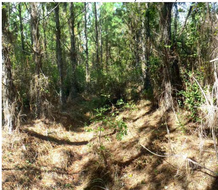
Photo 349. View of Mesic: Planted Pine-Mesic Pine Flatwoods as seen looking north from GPS location 6960 (Frames 2153-2154; 09/11/15).