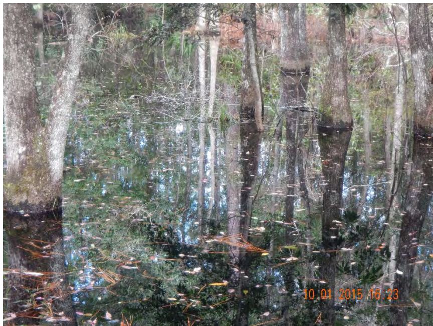
Photo 466. View of Wetland: Mixed Hardwood Swamp within excavated wetland at GPS location 8342 (Frame 7684; 10/01/15).