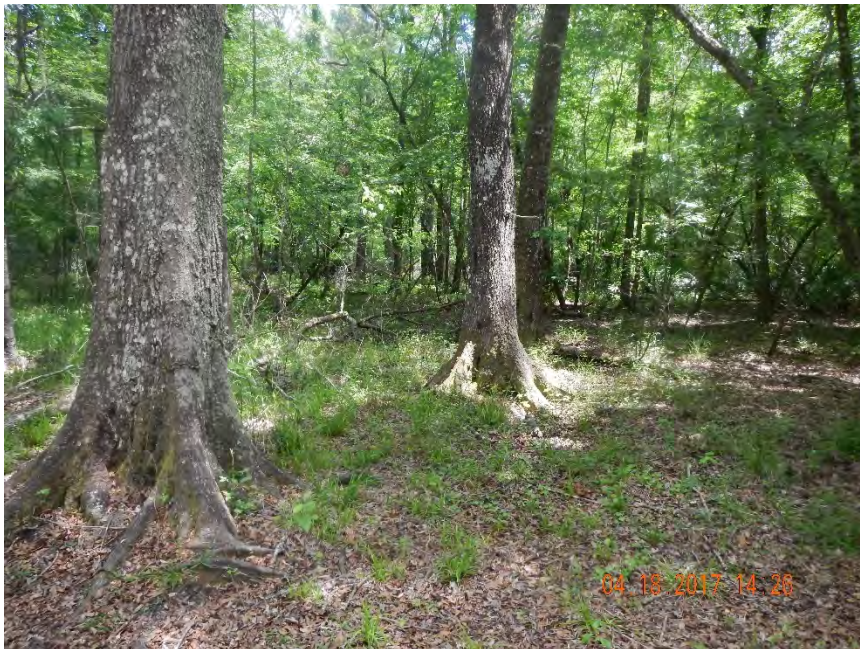
Photo 561. View of swamp laurel oak ( Quercus laurifolia ) Hydric Hammock habitat as seen at GPS location 10484 (Frame 1484; 04/18/17).