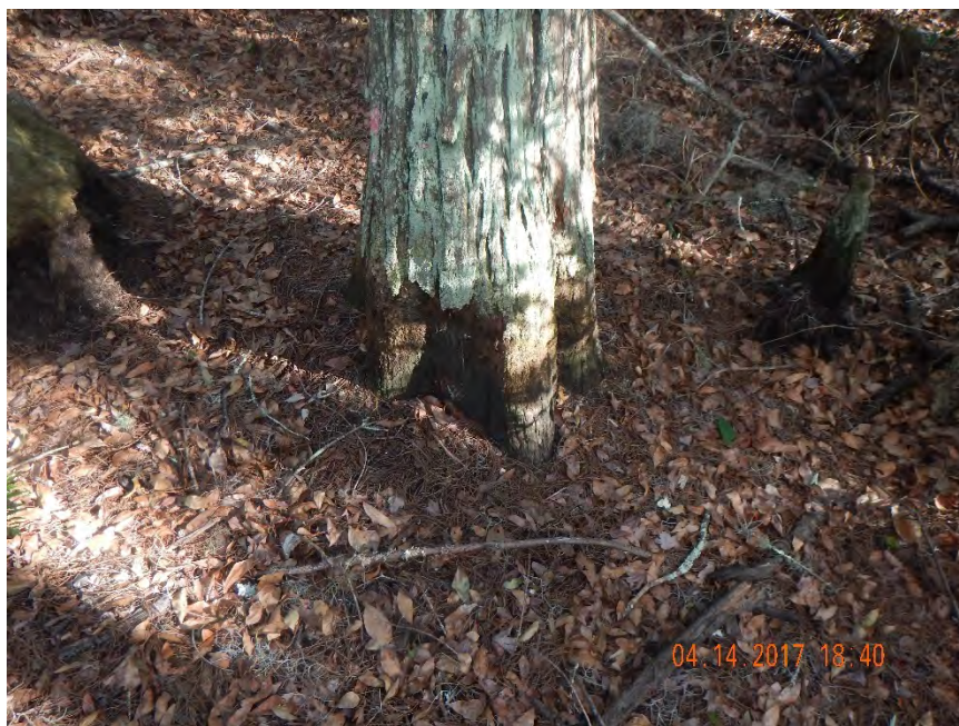
Photo 546. Lichen lines in wetland.