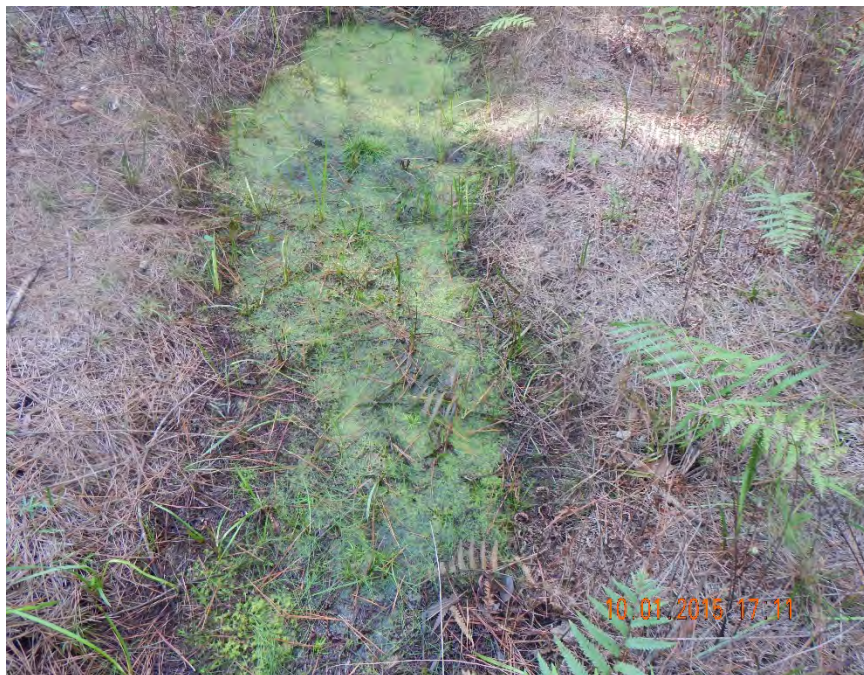
Photo 476. Pooled surface water and moss within the Hydric: Planted Pine Flatwoods at GPS location 8398 (Frame 7695; 10/01/15).