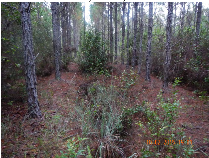
Photo 505. View of Hydric: Planted Pine Flatwoods as seen looking northwest from GPS location 8749 (Frame 7731; 10/02/15).