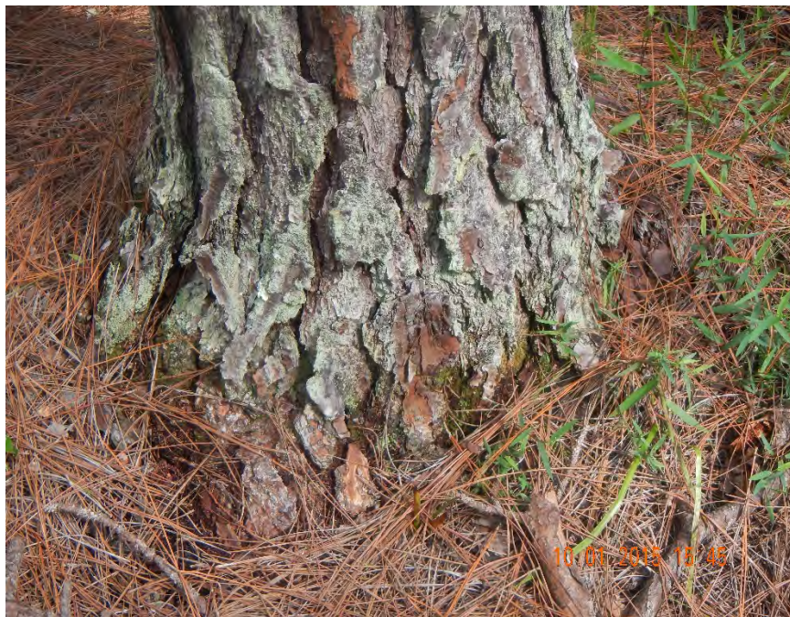
Photo 462. View of buttressed Pinus elliottii in Hydric: Planted Pine Flatwoods at GPS location 8256 (Frame 7680; 10/01/15).