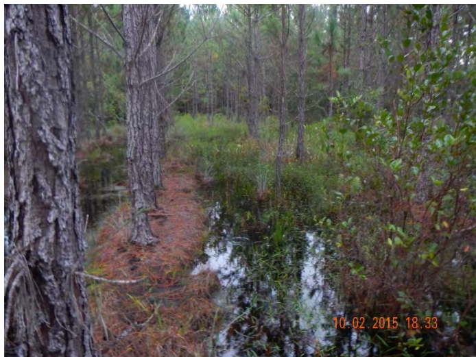
Photo 500. View of Wetland: Planted Pine-Marsh as seen looking southeast from GPS location 8704 (Frame 7725; 10/02/15).