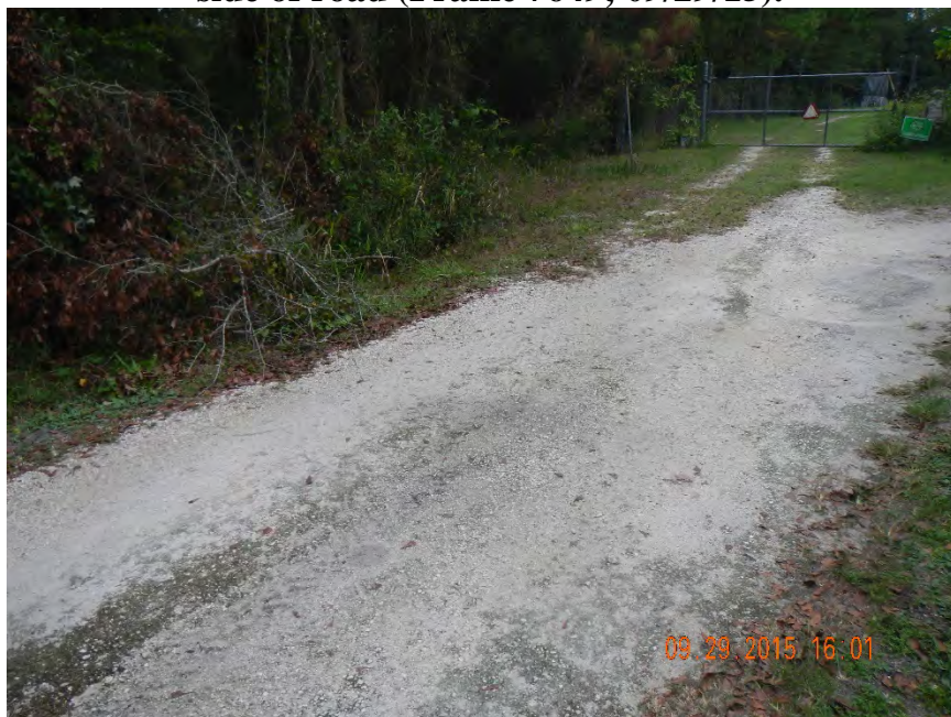
Photo 439. View of Physical Feature: Culvert at GPS locations 8101-8102. View is of north side of culvert (Frame 7650; 09/29/15).