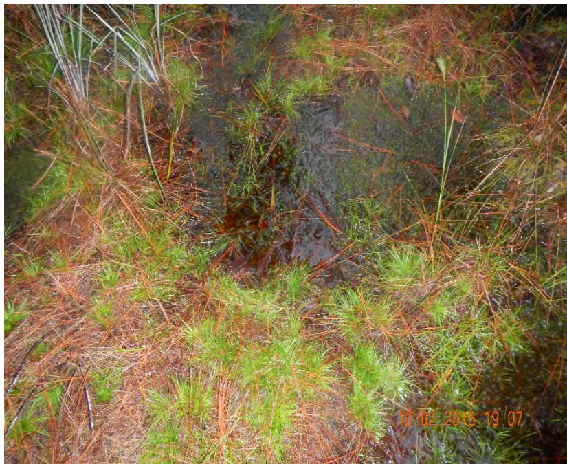
Photo 508. View of typical Hydric: Planted Pine Flatwoods groundcover and surface water as seen at GPS location 8757 (Frame 7734; 10/02/15).