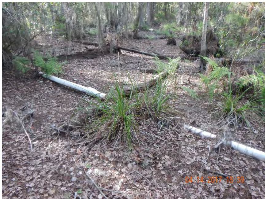
Photo 544. Sewage line.