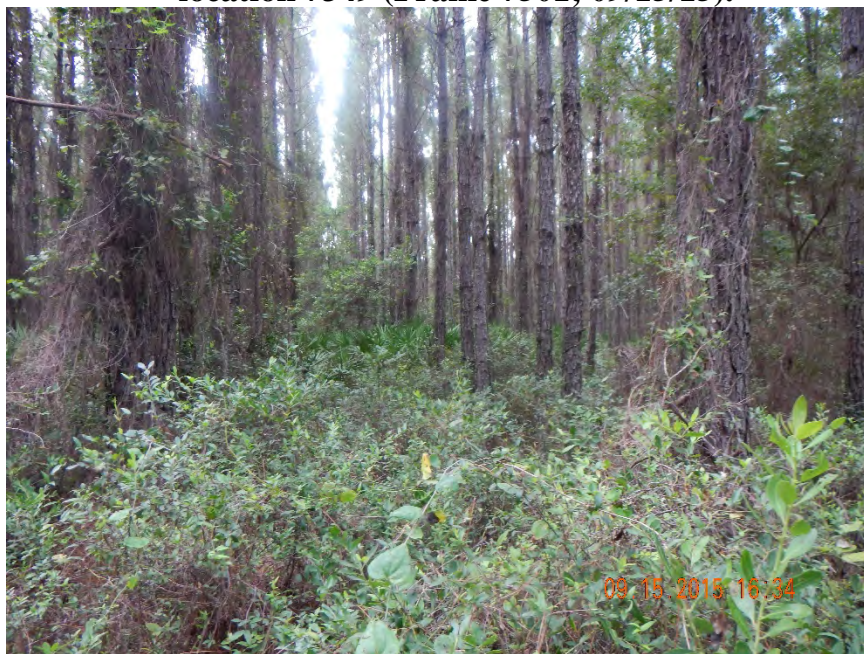
Photo 371. View of Mesic: Planted Pine-Mesic Pine Flatwoods as seen looking northeast from GPS location 7349 (Frame 7502; 09/15/15).