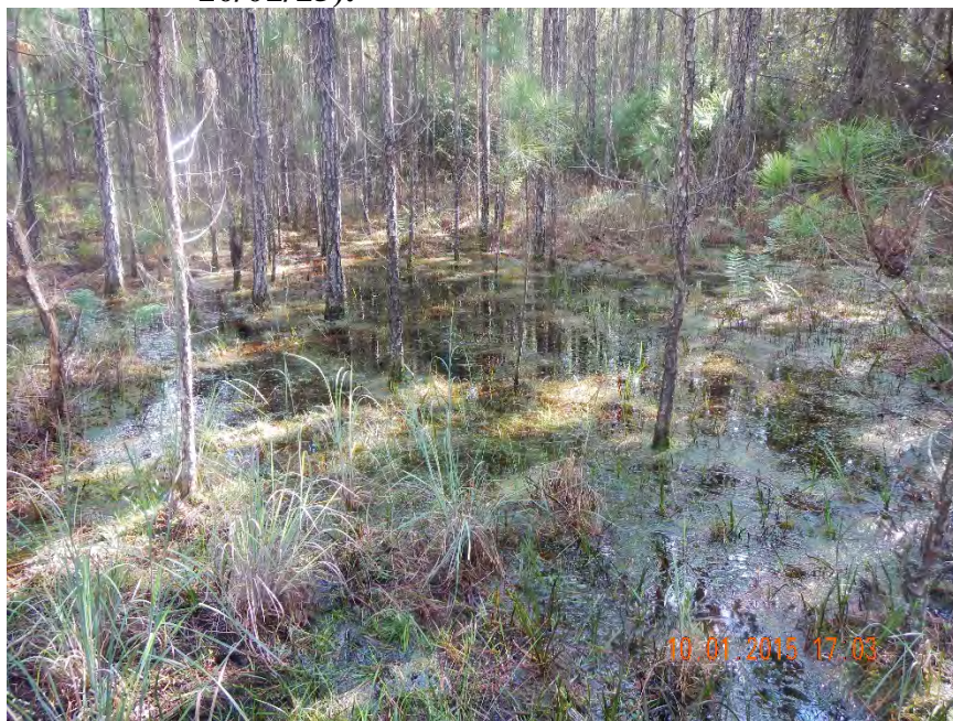
Photo 473. View of Wetland: Planted Pine-Marsh as seen looking southwest from GPS location 8364 (Frame 7692; 10/01/15).