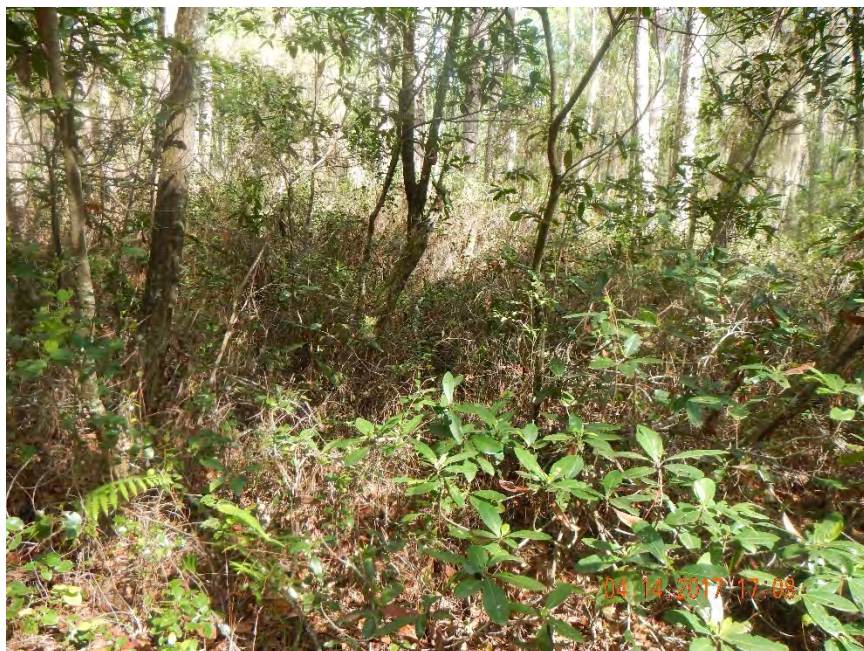
Photo 533. View of dense evergreen vegetation at boundary of pine-dominated wetland and Hydric Plant Pine Flatwoods community at GPS location 10251 (Frame 1444; 04/14/17).