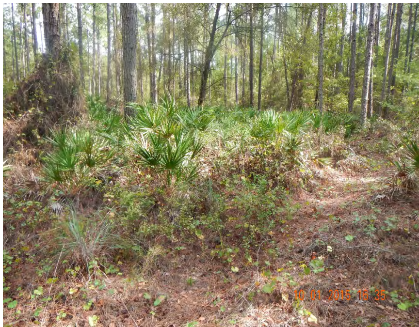
Photo 470. View of Mesic: Planted Pine-Mesic Pine Flatwoods as seen looking south from GPS location 8352 (Frame 7689; 10/01/15).