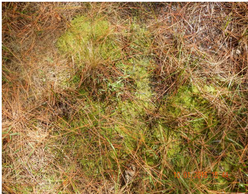
Photo 460. View of Sphagnum moss in Hydric: Planted Pine Flatwoods at GPS location 8256 (Frame 7678; 10/01/15).