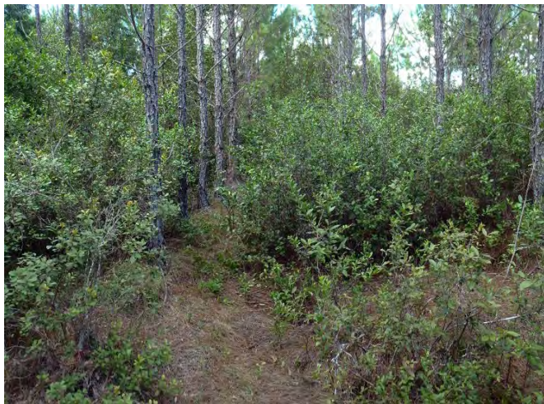
Photo 344. View of Mesic: Planted Pine-Mesic Pine Flatwoods as seen looking northwest from GPS location 6891 (Frames 2144-2145; 09/11/15).