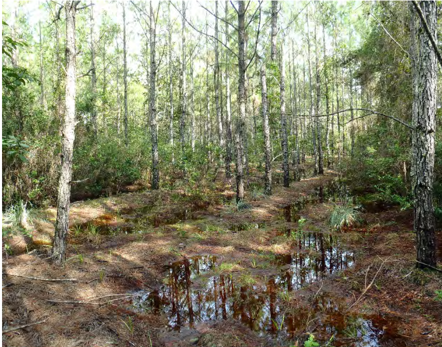
Photo 296. View of Wetland: Planted Pine-Marsh as seen looking east from GPS location 6104 (Frames 2048-2049; 09/08/15).