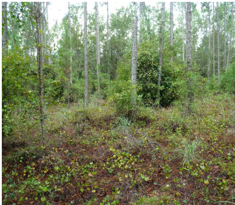
Photo 282. View of Mesic: Planted Pine-Mesic Pine Flatwoods as seen looking south from GPS location 5844 (Frames 2014-2015; 09/04/15).