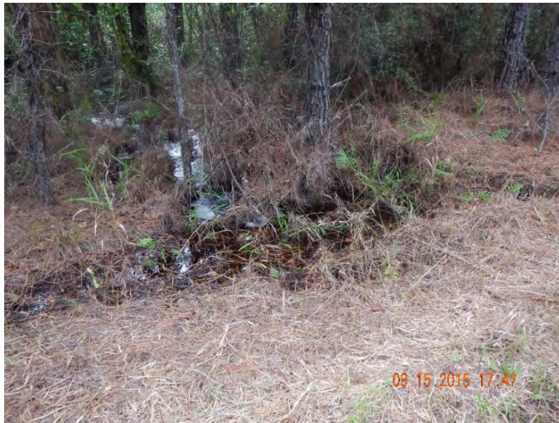
Photo 384. View of area at west end of Physical Feature: Culvert located at GPS location 7405. This is upstream area west of gas line (Frame 7518; 09/15/15).