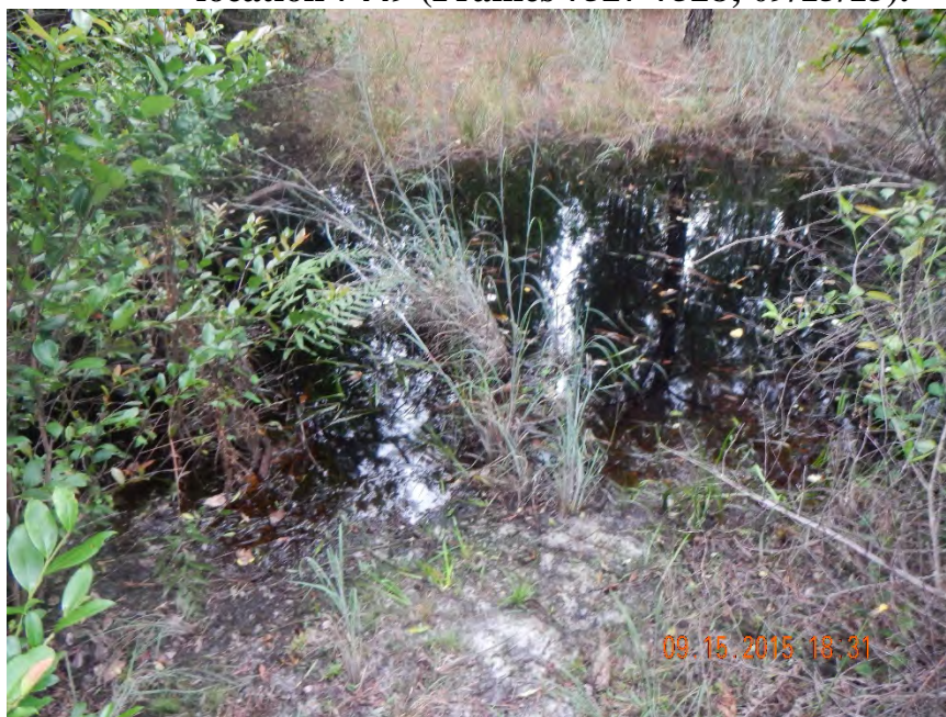
Photo 393. View of Surface Water: Excavated Ditch within Upland within a Transitional: Planted Pine Flatwoods as seen at GPS location 7456 (Frame 7529; 09/15/15).