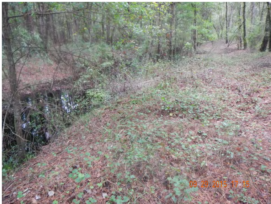
Photo 442. View of berm on south side of Fill: Old Roads-Berms-Windrows as seen looking east from GPS location 8106 (Frame 7654; 09/29/15).