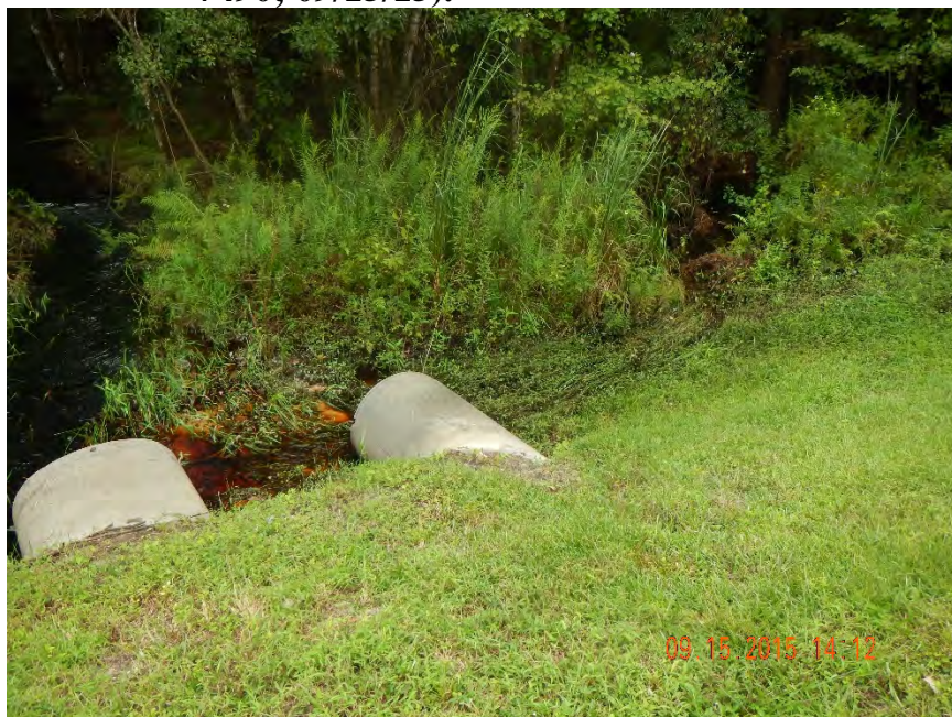
Photo 361. View to south (upstream) of culverts located in Rocky Creek at GPS location 9841 (Frame 7491; 09/15/15).