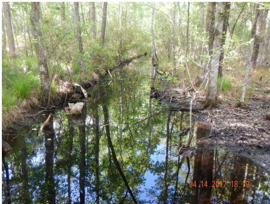
Photo 540. View of berm (left side [west]) and excavated ditch that flows north within the Cypress-Mixed Hardwood-Bay Swamp community as seen at GPS location 10322 (Frame 1456; 04/14/17).