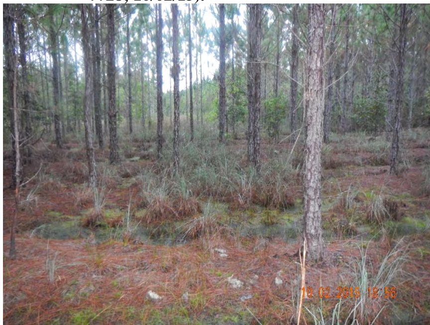
Photo 503. View of Wetland: Planted Pine-Marsh as seen looking south from GPS location 8734 (Frame 7729; 10/02/15).