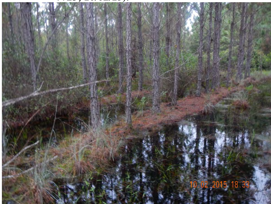
Photo 499. View of Wetland: Planted Pine-Marsh as seen looking northeast from GPS location 8704 (Frame 7724; 10/02/15).