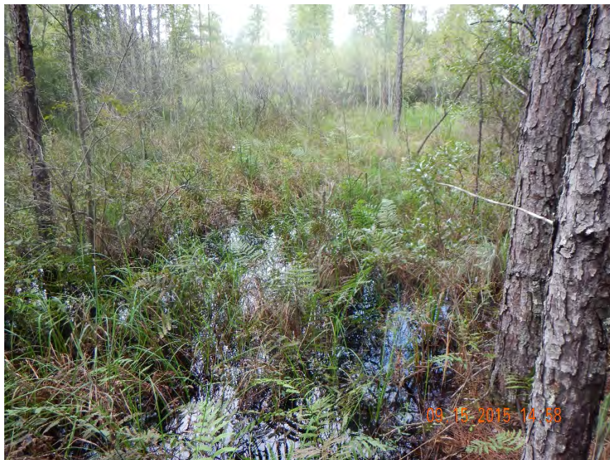
Photo 364. View of Wetland: Cypress-Mixed Hardwoods-Bays as seen looking west from GPS location 7304 (Frame 7495; 09/15/15).