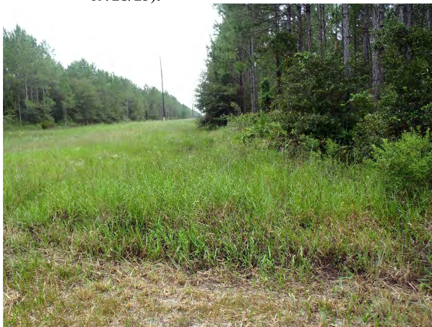
Photo 415. View of wetland marsh on north side of power line access road as seen looking west from culvert located at GPS location 7765 (Frame 2182; 09/18/15).