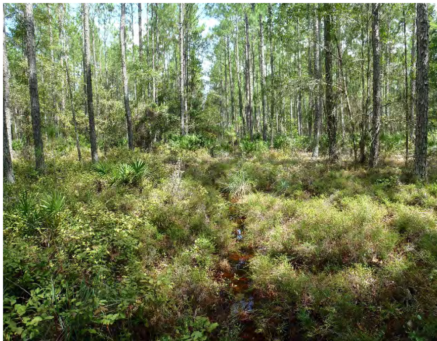
Photo 306. View of Mesic: Planted Pine-Mesic Pine Flatwoods as seen looking north from GPS location 6337 (Frames 2072-2073; 09/09/15).