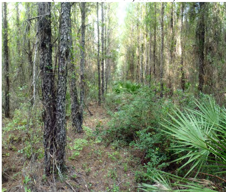
Photo 355. View of Mesic: Planted Pine-Mesic Pine Flatwoods as seen looking north from GPS location 7041 (Frames 2165-2166; 09/11/15).