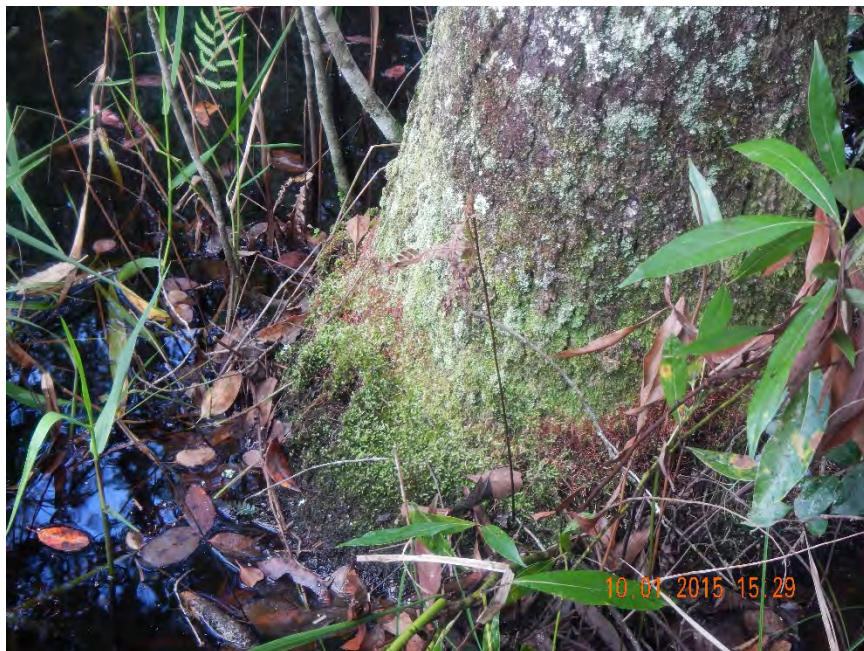
Photo 456. View of lichen and moss lines as seen within Wetland: Marsh at GPS location 8242 (Frame 7674; 10/01/15).