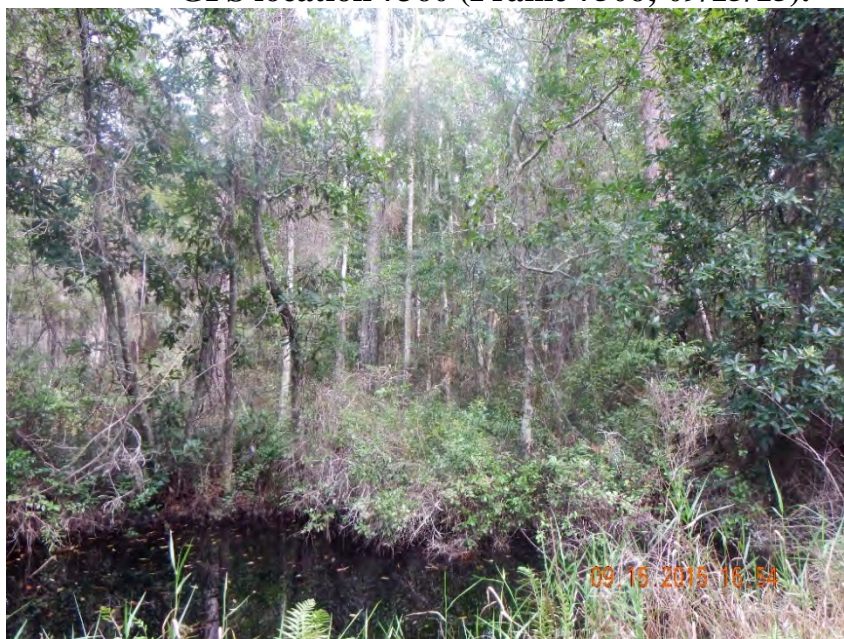
Photo 375. View of wetland shrubs and marsh area of Wetland: Cypress-Mixed Hardwoods-Bays community from Physical Feature: Culvert as seen looking west (upstream) from GPS location 7360 (Frame 7507; 09/15/15).