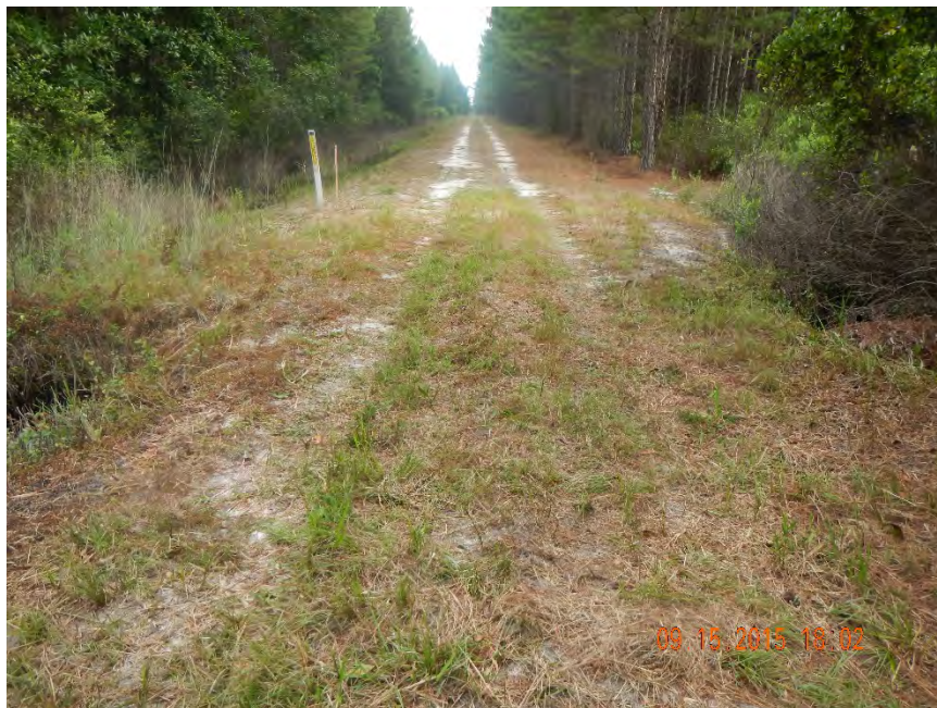
Photo 388. View of Physical Feature: Culvert area within gas line right-of-way as seen looking south from GPS location 7421 (Frame 7522; 09/15/15).