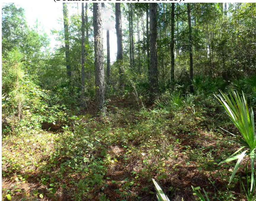
Photo 303. View of Mesic: Planted Pine-Mesic Pine Flatwoods as seen looking northeast from GPS location 6263 (Frames 2062-2063; 09/09/15).