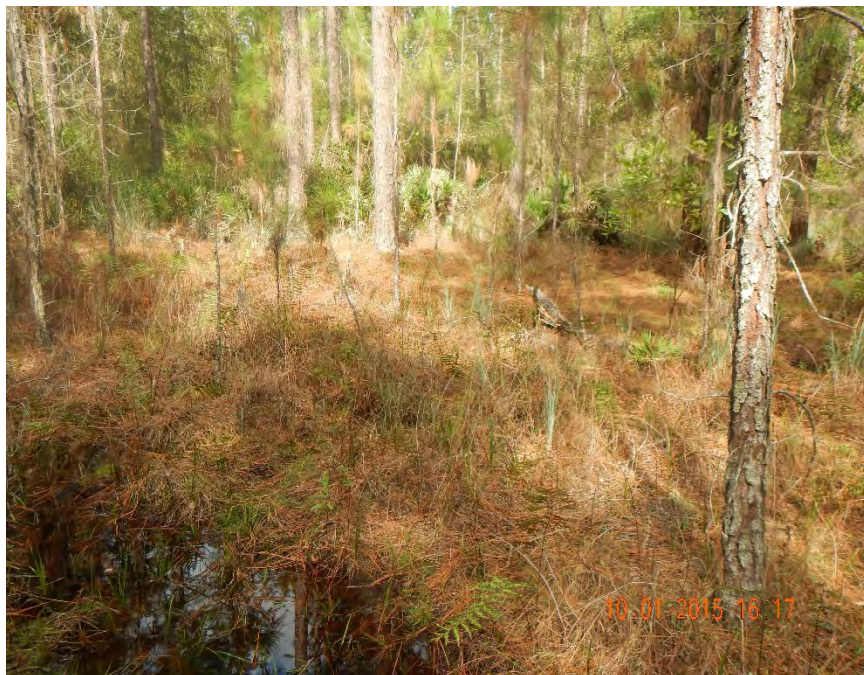
Photo 464. View of Hydric: Planted Pine Flatwoods at GPS location 8284 (Frame 7682; 10/01/15).