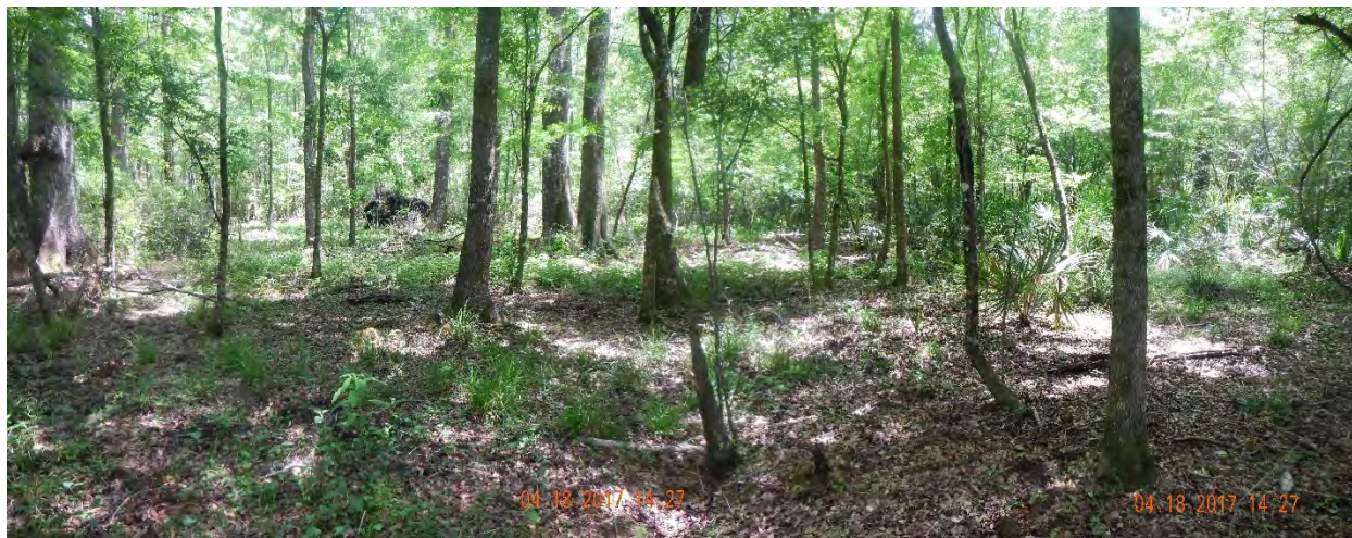
Photo 562. View of Hydric Hammock community as seen at GPS location 10489 (Frames 1485-1486; 04/18/17).