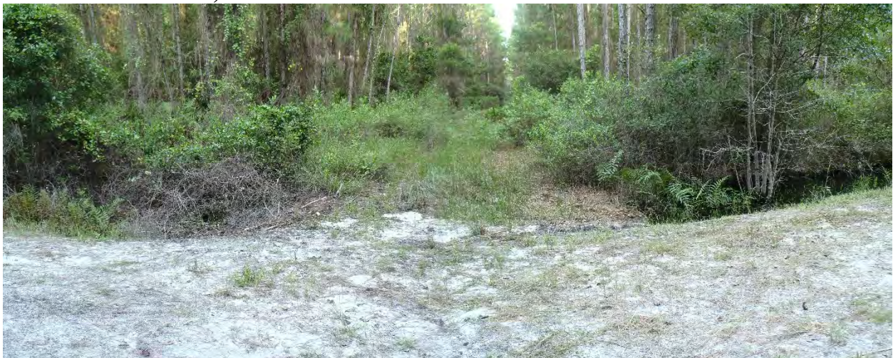
Photo 357. View of Ditch Block within ditch located along east boundary of gas line easement as seen looking east from GPS location 7068. Water is pooled to the south at this location (Frames 2169-2170; 09/11/15).