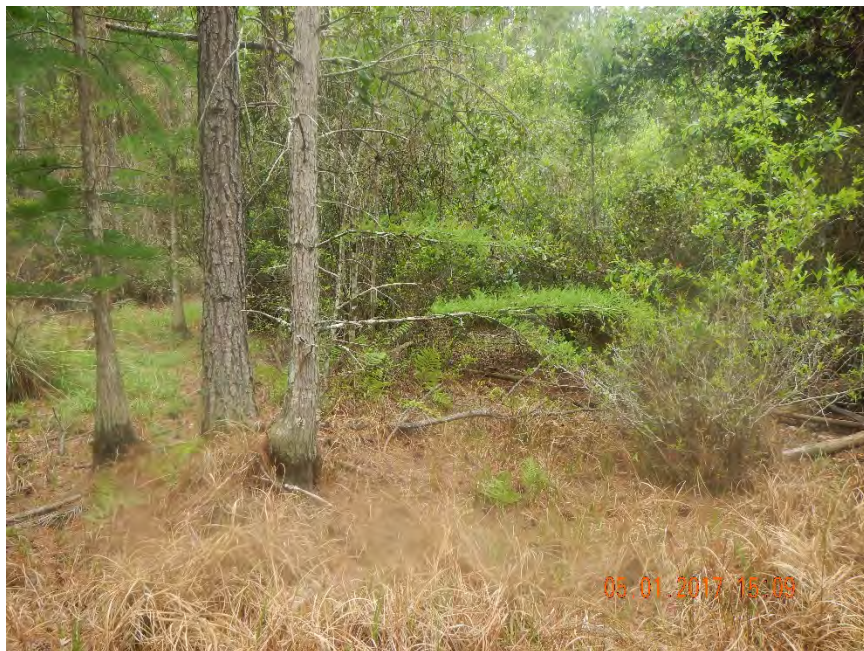
Photo 574. View of logged Cypress and Mixed Hardwood Wetland located at GPS location 10766 (Frame 1568; 05/01/17).