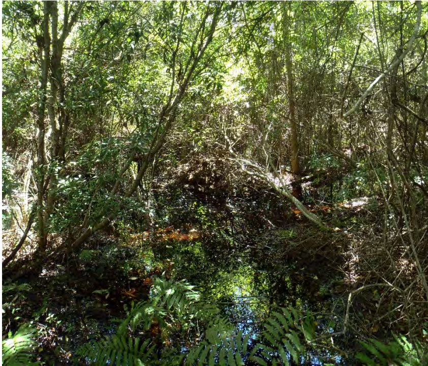
Photo 336. View of Wetland: Mixed Hardwoods-Seepage Slope as seen looking south from GPS location 6793 (Frames 2132-2133; 09/11/15).