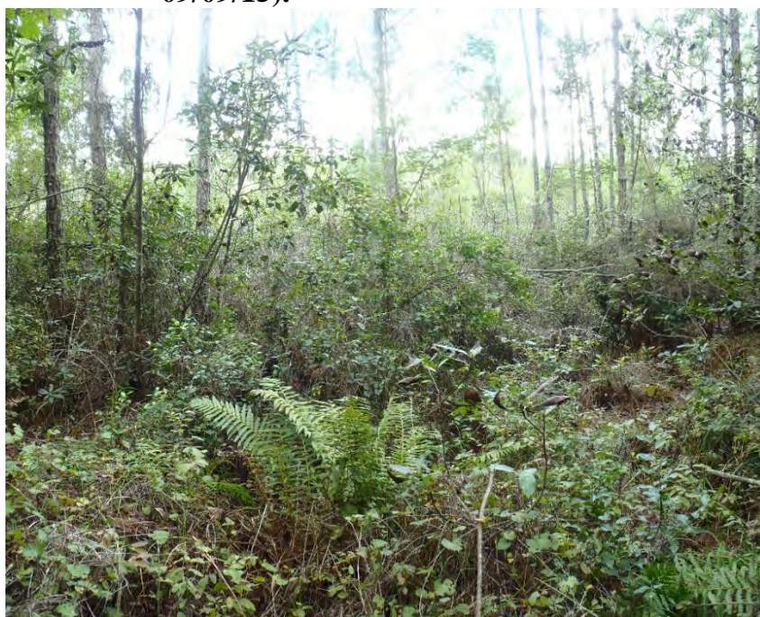
Photo 309. View of Wetlands: Mixed Hardwood Swamp-Bays-Fetterbush as seen looking northwest from GPS location 6375 (Frames 2078-2079; 09/09/15).