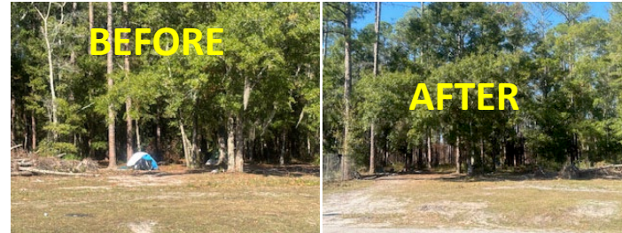
Grace Market Place