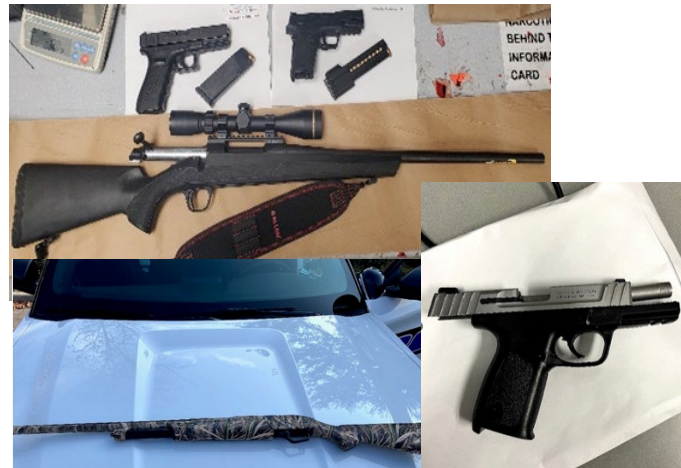
Seized Illegal Firearms