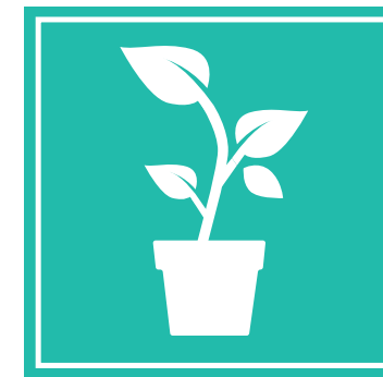
More Sustainable Community