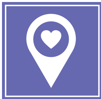
A Great Place to Live & Experience