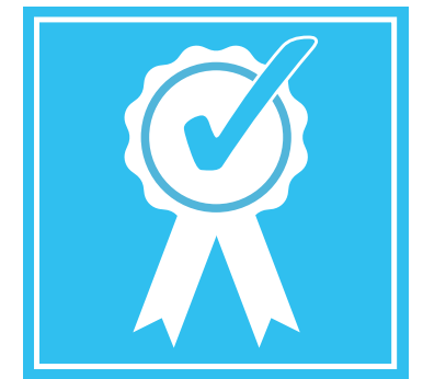
“Best in Class” Neighbor Services